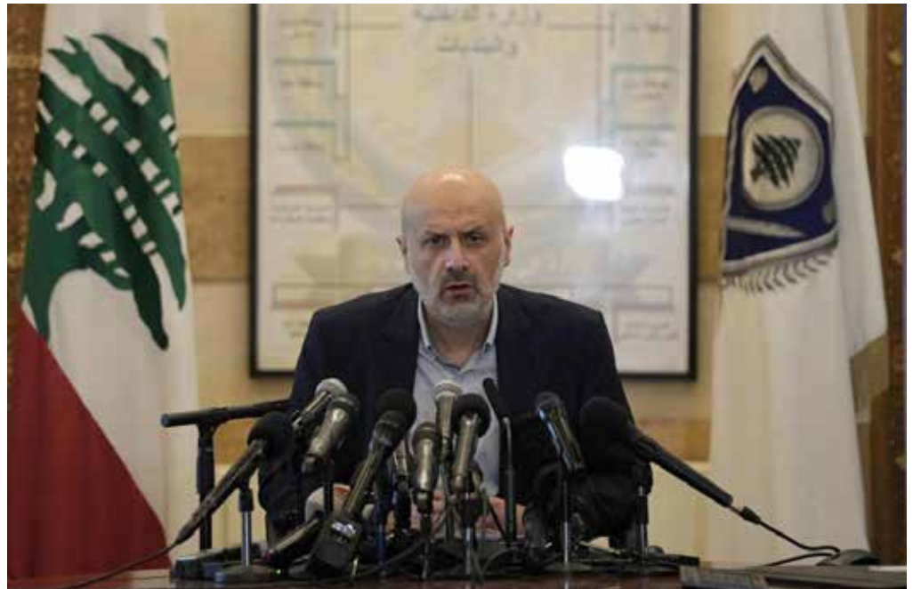
Lebanese Interior Minister Bassam Mawlawi, centre, speaks during a press conference about Sunday's parliamentary elections, at the interior ministry in Beirut, Lebanon, Monday, May 16, 2022. Lebanon's militant Hezbollah group and its allies suffered losses in this weekend's parliamentary elections, with preliminary results Monday showing some of their most vocal opponents picking up more seats and several of their traditional partners routed out of the legislature.

Hezbollah's most vocal opponent, the nationalist Christian Lebanese Forces party, emerged as the biggest winner, while its Christian rival, the Free Patriotic Movement founded by President Michel Aoun, suffered a political setback.