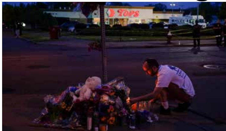
A man pays his respects outside the scene of a shooting at a supermarket, in Buffalo, N.Y., Sunday, May 15, 2022.