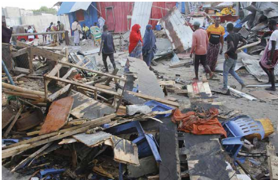
People look at destroyed shops in Mogadishu's Lido beach, Somalia, Saturday, April, 23, 2022, after a bomb blast by Somalia's Islamic extremist rebels hit a popular seaside restaurant killing at least six people. Ambulance service officials say the explosion occurred Friday evening when many patrons gathered for an Iftar meal to break the Ramadan fast.

It's a reminder that the U.S. remains engaged in the long fight against Is-