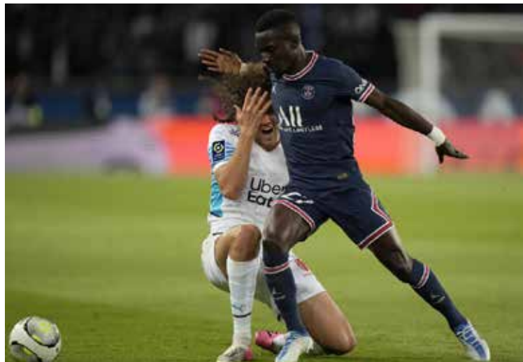
Marseille's Matteo Guendouzi, left, duels for the ball with PSG's Idrissa Gueye during the League One soccer match between Paris Saint Germain and Marseille, at the Parc des Princes stadium, in Paris, France, Sunday, April 17, 2022.

For the second consecutive season, professional clubs in the country had