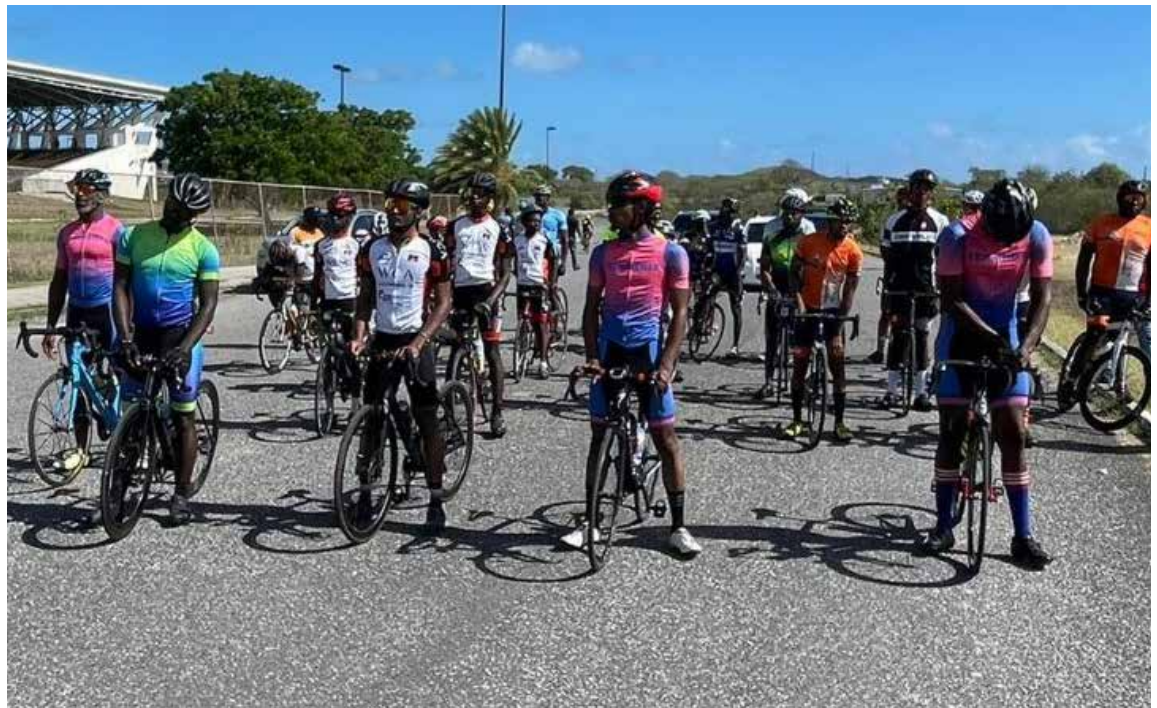
Cyclists converge at the starting point of the Palm Sunday Road Race at the Sir Vivian Richards Stadium on 10th April, 2022.