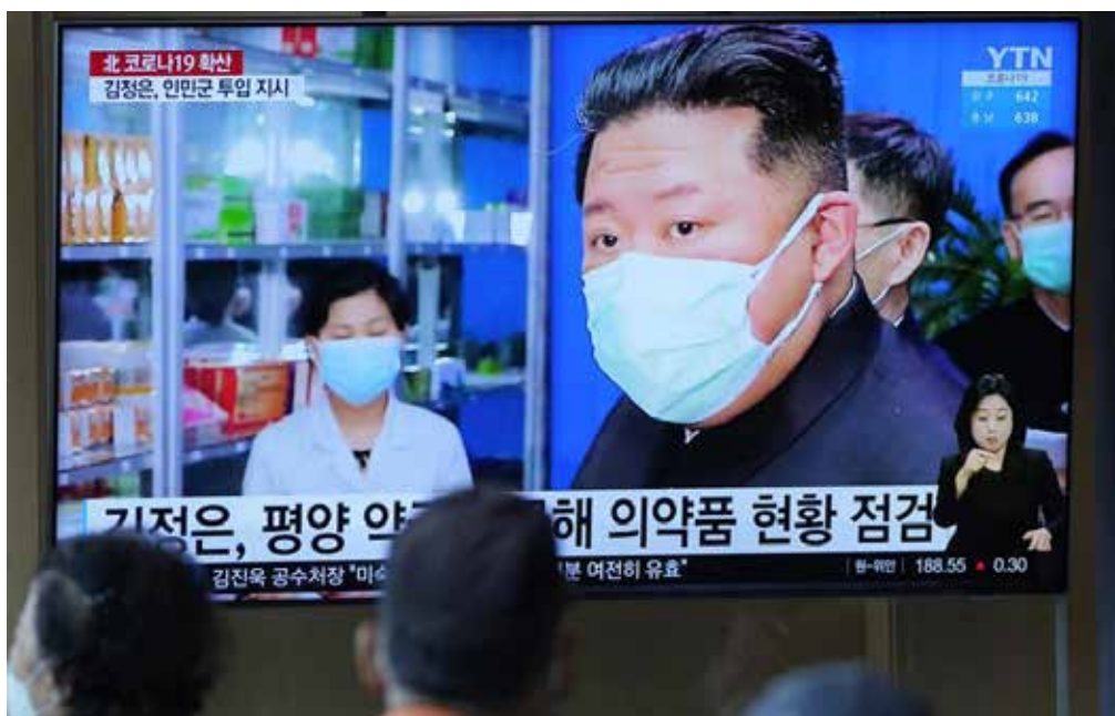
People watch a TV screen showing a news programme reporting with an image of North Korean leader Kim Jong Un, at a train station in Seoul, South Korea on May 16, 2022.

toll is low for a country where most of the 26 million people are unvaccinated and medicine is in short supply.