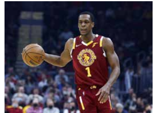
Cleveland Cavaliers' Rajon Rondo (1) plays against the San Antonio Spurs during the first half of an NBA basketball game, Wednesday, Feb. 9, 2022, in Cleveland.

Two days after the alleged incident occurred, a judge granted the woman the protective order. The judge ordered