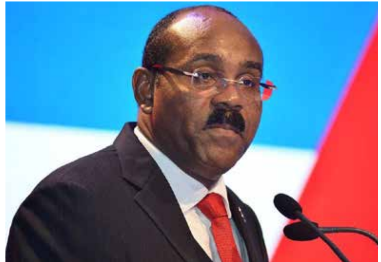
Prime Minister Gaston Browne

The court further ordered an injunction, which bars Turner standing as the ABLP candidate until there is a "hearing and determination of this action or until there