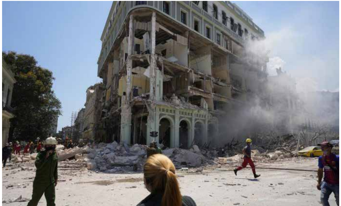
Rooms are exposed at the five-star Hotel Saratoga where emergency crew work after a deadly explosion in Old Havana, Cuba, .

"We intend to protect all the affected families without distinction, due to the transcendence and painful repercussion of the accident," she said.