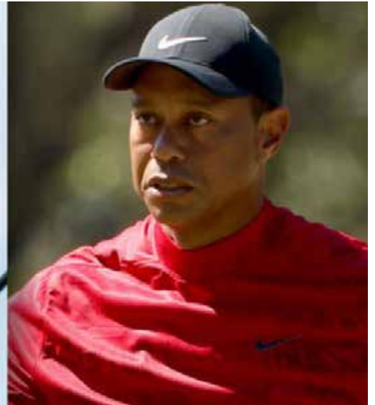
Phil Mickelson and Tiger Woods have won 21 major championships between them

see him face the media for the first time in months and, while he has been named as a provisional starter, he could still pull out at the last minute.