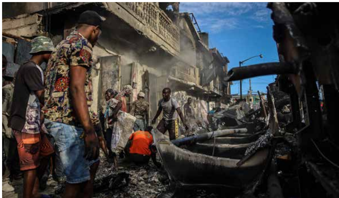
Resumed gang fighting in Haiti kills 26; hundreds flee homes

“Displaced people need access to clean water, food, sanitation kits, children’s