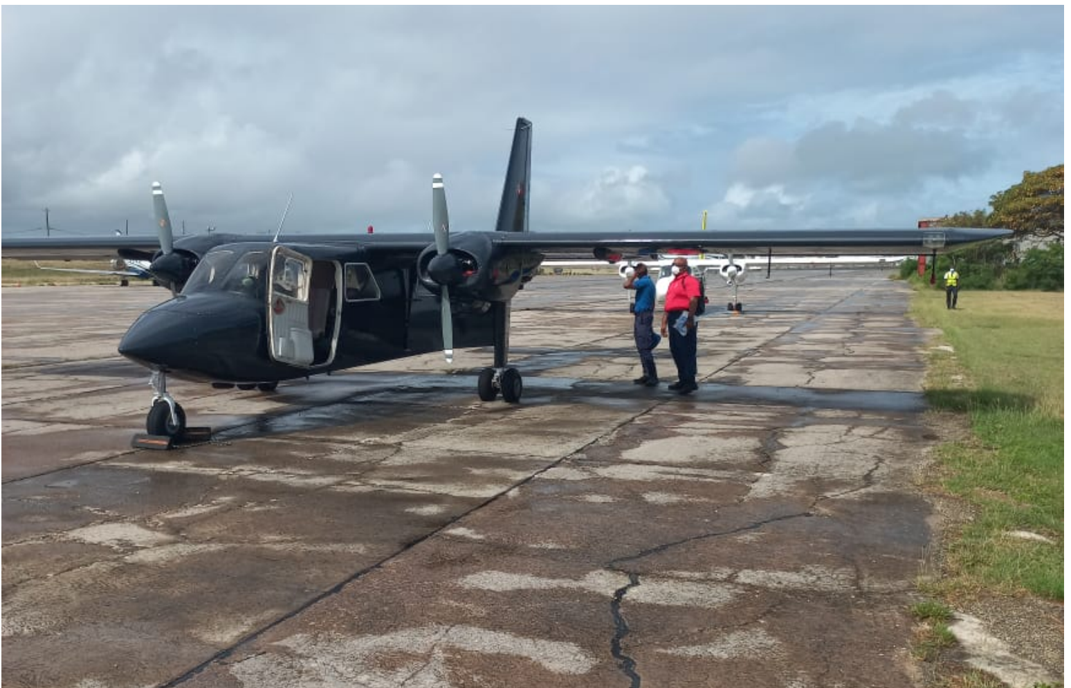
The Airwing division of the Antigua and Barbuda Defense Force (ABDF) has been responding to medical emergencies in Barbuda by flying to Antigua those in need of urgent specialised care. Story on page 5.