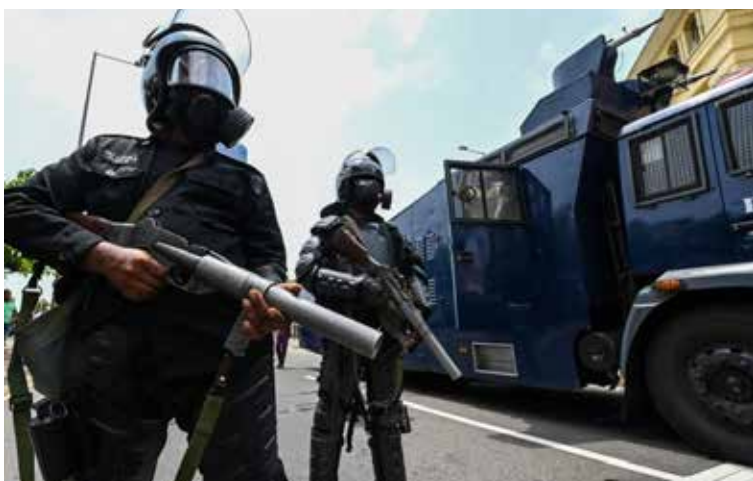
Police stand guard outside the president's office amid worsening violence in Sri Lanka after weeks of anti-government protests

A draft opinion leaked last week suggests a majority of the Supreme Court would overturn US women's federally protected right to abortion.