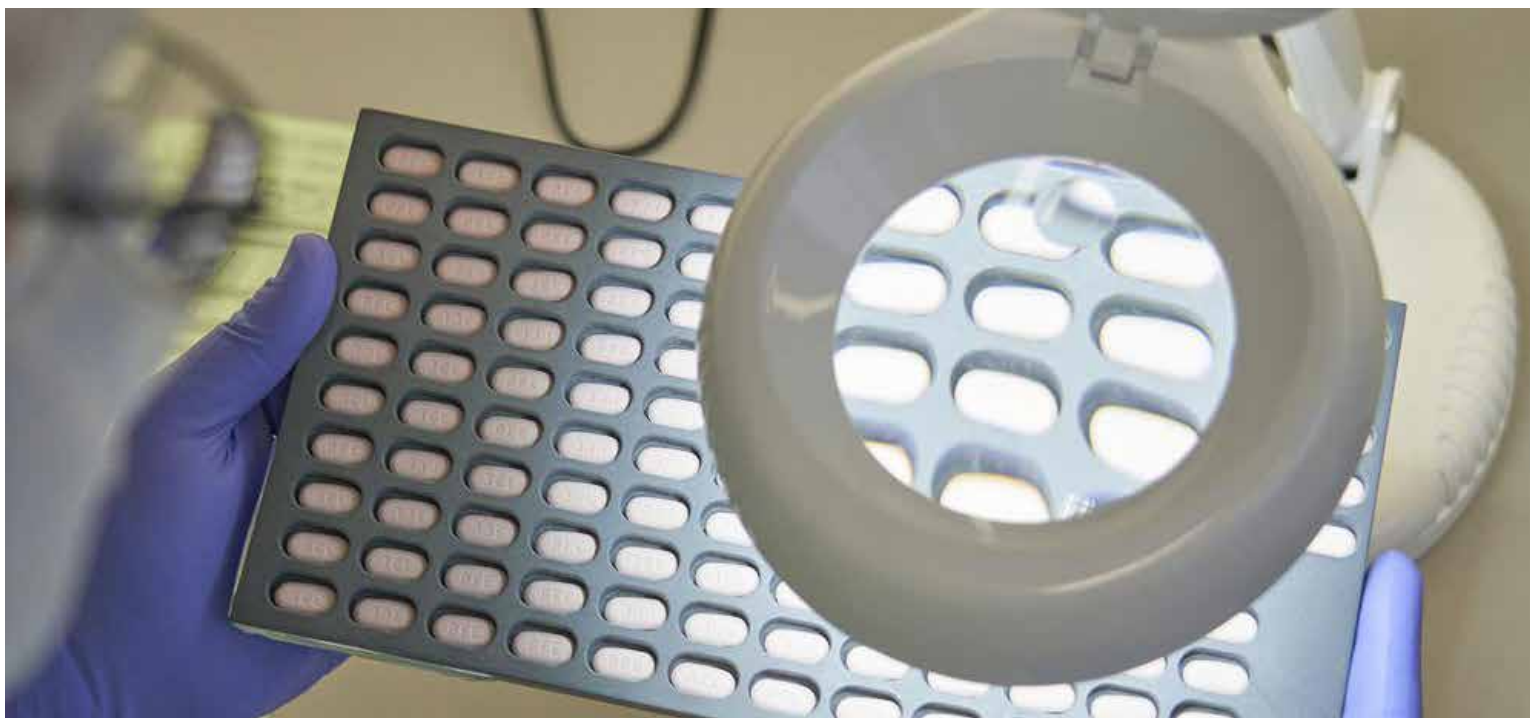
In this photo provided by Pfizer, a lab technician visually inspects COVID-19 Paxlovid tablet samples in Freiburg, Germany in December 2021 (Pfizer via AP, File)