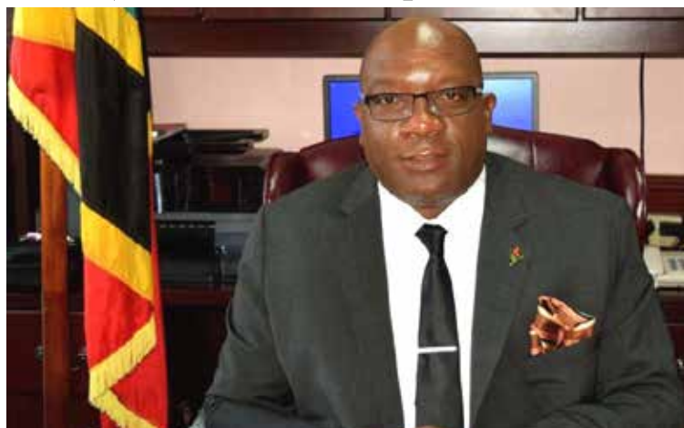
Dr the Hon. Timothy Harris ering for you.”

“While others neglected their duty, and fail to attend cabinet meetings I must commend the members of the cabinet who continue to show great respect for the institution of the Cabinet and for giving yeoman service to their country. We have been focused on deliv-