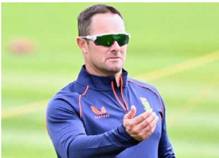
Mark Boucher was appointed South Africa men's head coach in December 2019

BBC – Cricket South Africa (CSA) have withdrawn disciplinary charges against men's head coach Mark Boucher.