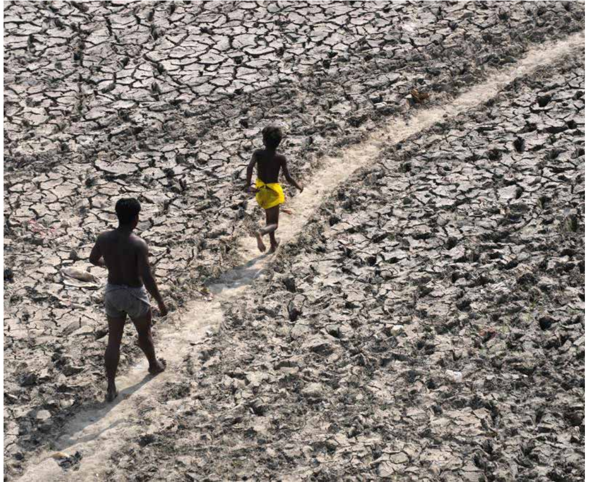
A man and a boy walk across the almost dried up bed of river Yamuna following hot weather in New Delhi, India, Monday, May 2, 2022.

They also said there's a 93% chance that the five years from 2022 to 2026 will be the hottest on re-