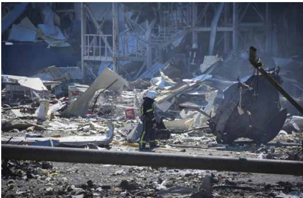
An Ukrainian firefighter works near a destroyed building on the outskirts of Odesa, Ukraine, Tuesday, May 10, 2022. The Ukrainian military said Russian forces fired seven missiles a day earlier from the air at the crucial Black Sea port of Odesa, hitting a shopping centre and a warehouse.

Ukraine alleged at least some of the munitions used dated back to the Soviet era, making them unreliable in targeting. But the Center for Defense Strategies, a Ukrainian think tank