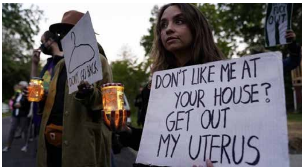
Protesters outside the home of Supreme Court Justice Samuel Alito on Monday night

Monday that demonstrations should never include "violence, threats or vandalism".