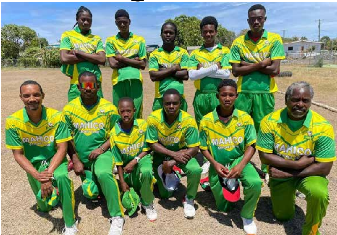
The Mahico cricket team that played in last weekend's matches in the ACB Caribbean Parish League's Richie Richardson competition.

Both Police and Newfield won their two matches last weekend. Police maintained their unbeaten run this season by recording four-wicket