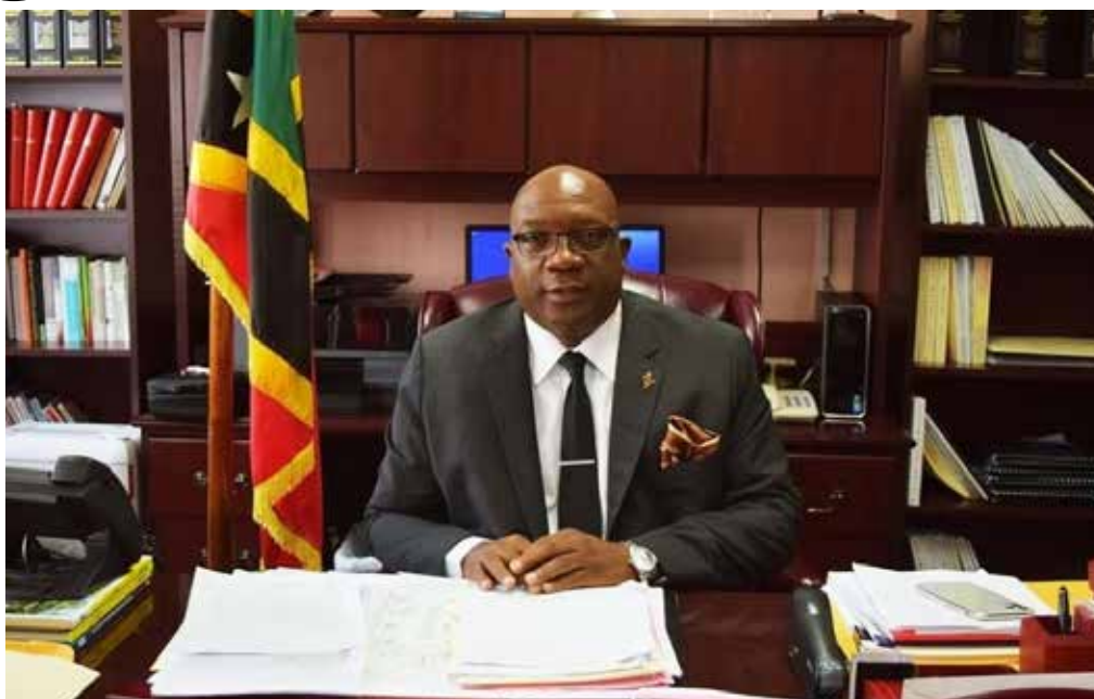
Prime Minister Dr Timothy Harris

prises Harris’s People’s Labour Party (PLP) the People’s Action Movement (PAM) and the Concerned Citizen’s Movement (CCM). The PLP controls two of the nine seats in the coalition government with the two other seats in the National assembly belonging to the SKNLP.