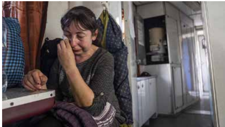
A woman from Luhansk region cries while sitting on the evacuation train in Pokrovsk, eastern Ukraine, Tuesday, April 26, 2022.

In other developments, Poland and Bulgaria said the Kremlin is cutting off natural gas supplies to the two NATO countries starting Wednesday, the first such actions of the war. Both nations had refused