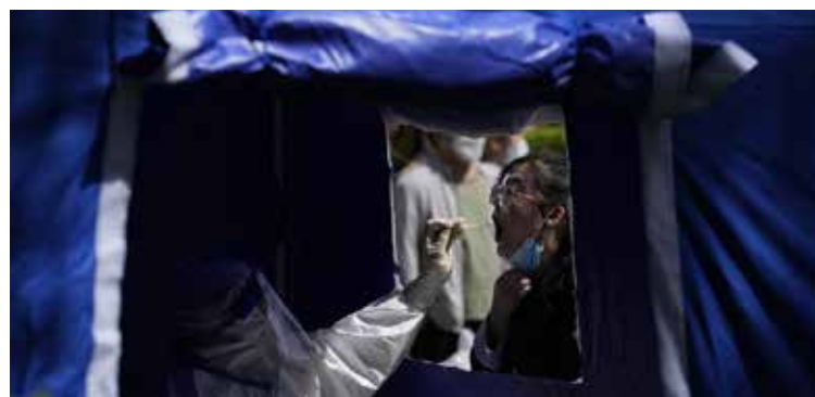
A resident gets tested outside an office building in the Haidian district on Tuesday, April 26, 2022, in Beijing. China's capital Beijing is enforcing mass testing and closing down access to neighborhoods as it seeks to contain a new COVID-19 outbreak.

Fears of a total lockdown have been fed by disruptions in the supply of food, medicine and daily necessities in Shanghai, a southeast coast business hub whose 25 million residents have only gradually been allowed to leave their homes after three weeks of confinement.