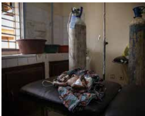
A malnourished baby is cared for in the pediatric department of Boulmiougou hospital in Ouagadougou, Burkina Faso, Friday April 15, 2022.

Some 3.5 million people are food insecure, with nearly 630,000 expected to be on the brink of starvation, according to the latest food security report by the government and U.N.