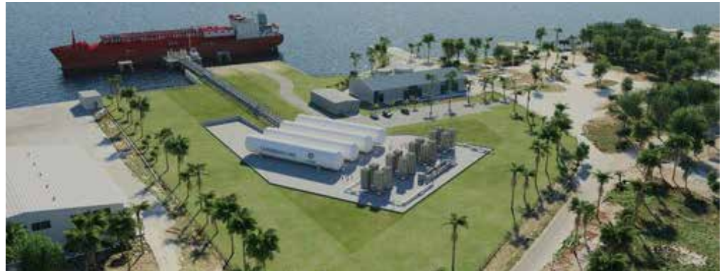
Caribbean LNG Terminal

It will also serve as a template and anchor plant to service power and other energy requirements to other coun-