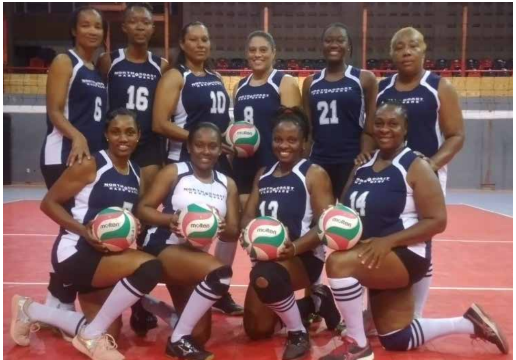
North Coast Hardware Starz 1 Nova won their opening match in the Female Division of the Antigua and Barbuda Volleyball Association's Local League at the YMCA Sports Complex on Saturday, 23rd April, 2022.

Enforcers took the opening set 25-22 before Flyerz claimed the second 25-18 to level the match at 1-1. Flyerz took a 2-1 advantage by taking the third