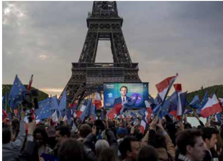
French President Emmanuel Macron celebrates with supporters in front of the Eiffel Tower Paris, France, Sunday, April 24, 2022. Polling agencies projected that French President Emmanuel Macron comfortably won reelection Sunday in the presidential runoff, offering French voters and the European Union the reassurance of leadership stability in the bloc's only nuclear-armed power as the continent grapples with Russia's invasion of Ukraine.

"No one will be left by the side of the road," Ma-