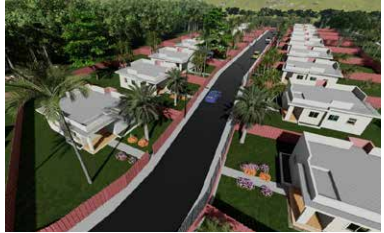
Under the ABLP's proposed housing plan, pictured here, low-income families will be able to purchase a "naked" two-bedroom home for as little as $110,000 with mortgage payments as low as $750 monthly.

"We believe we have a duty to offer choice," said Lovell, "so that persons can say, 'If I pay $250,000 for a single storey bungalow, I may be able to pay $100,000 if it is a three-storey block and I get the same size, it's just that I