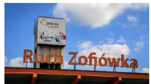
A general view of the Borynia-Zofiowka coal mine in Jastrzebie-Zdroj, Poland. April 23, 2022.

Polish Prime Minister Mateusz Morawiecki, who visited the Borynia-Zofiowka mine on Saturday, said that all procedures in both mines will be “thoroughly checked” by a special commission.