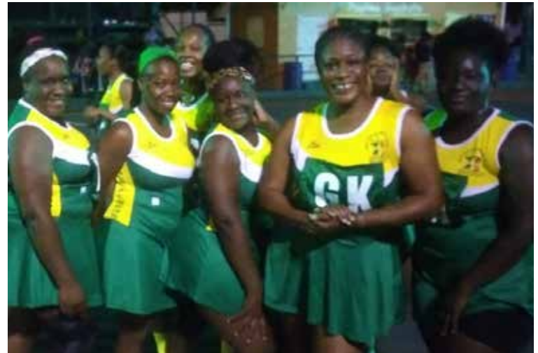
The John Hughes team during a break in the Female Division encounter against Spencer's All Saints United 1 at the YMCA Sports Complex on Saturday, 23rd April, 2022.

There were wins as well for Drazh Eastsiders and Grays Green Tigers in the Female Division.