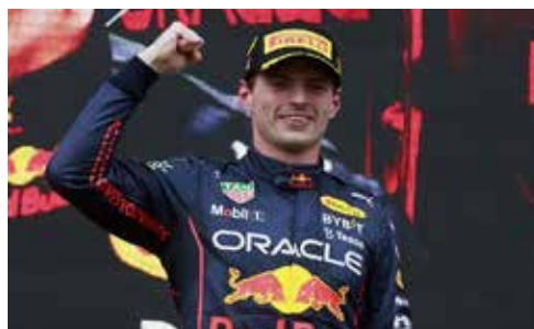
Max Verstappen second.

The error enabled Verstappen to slash his deficit to Leclerc from 45 points to 27, moving the Dutchman up from fifth in the championship to