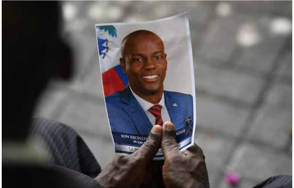
A man holds a photo of the late Haitian President Jovenel Moïse during his memorial ceremony at the National Pantheon Museum in Port-au-Prince, Haiti, July 20, 2021.

The U.S. Attorney's Office declined to comment on Joseph's expected extradition to Miami. A criminal complaint is expected to charge him with conspiring to provide "material support" in a plot to kill a foreign