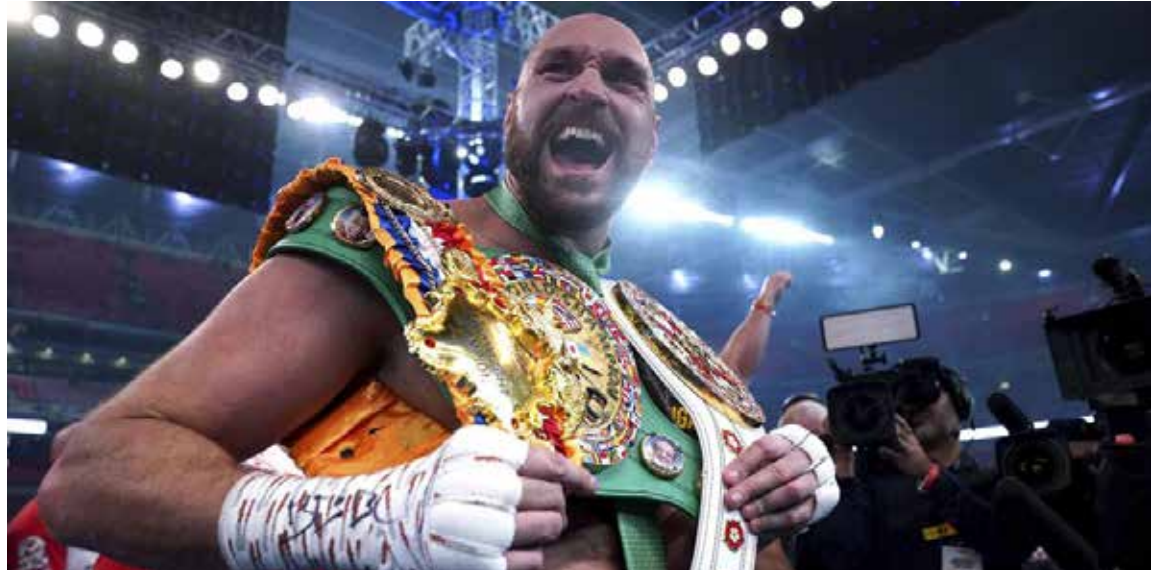
Britain's Tyson Fury celebrates after beating Britain's Dillian Whyte to win their WBC heavyweight title boxing fight at Wembley Stadium in London, Saturday, April 23, 2022.

won two English titles, two British titles, two Commonwealth titles, the Irish title, the European title, WBO intercontinental, WBO super, WBA super, IBF, IBO, Ring Magazine, lineal, WBC — I've won every belt there is