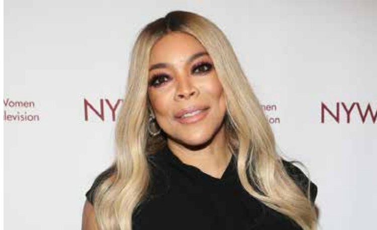
Wendy Williams, here in 2019, is leaving her talk show after 13 seasons.

Williams' departure comes as she has been absent from her hosting duties since the premiere of the 13th season of "Wendy." Williams was recovering