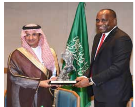
Prime Minister Roosevelt Skerrit (right) met with Saudi Minister of Tourism Alkhateeb at the Kempinski Hotel on Monday

Skerrit said that there are a number of areas his island is interested in developing a relationship with the oil-rich country including tourism and agriculture, adding "we believe we can collaborate with the Kingdom".