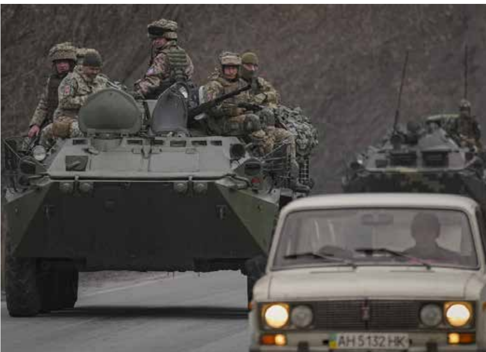
Ukrainian servicemen sit atop armored personnel carriers driving on a road in the Donetsk region, eastern Ukraine, Thursday, Feb. 24, 2022.