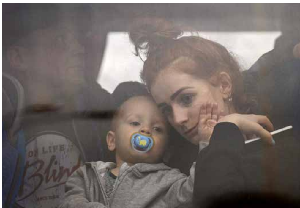
A woman holds her baby inside a bus as they leave Kyiv, Ukraine, Thursday, Feb. 24, 2022.

peting claims about damage they had inflicted. Russia's Defense Ministry said it had destroyed scores of Ukrainian air bases, military facilities and drones, and confirmed the loss of a Su-25 attack jet, blaming "pilot error." It said it was not targeting cities, but using precision weapons and claimed that "there is no threat to civilian population."