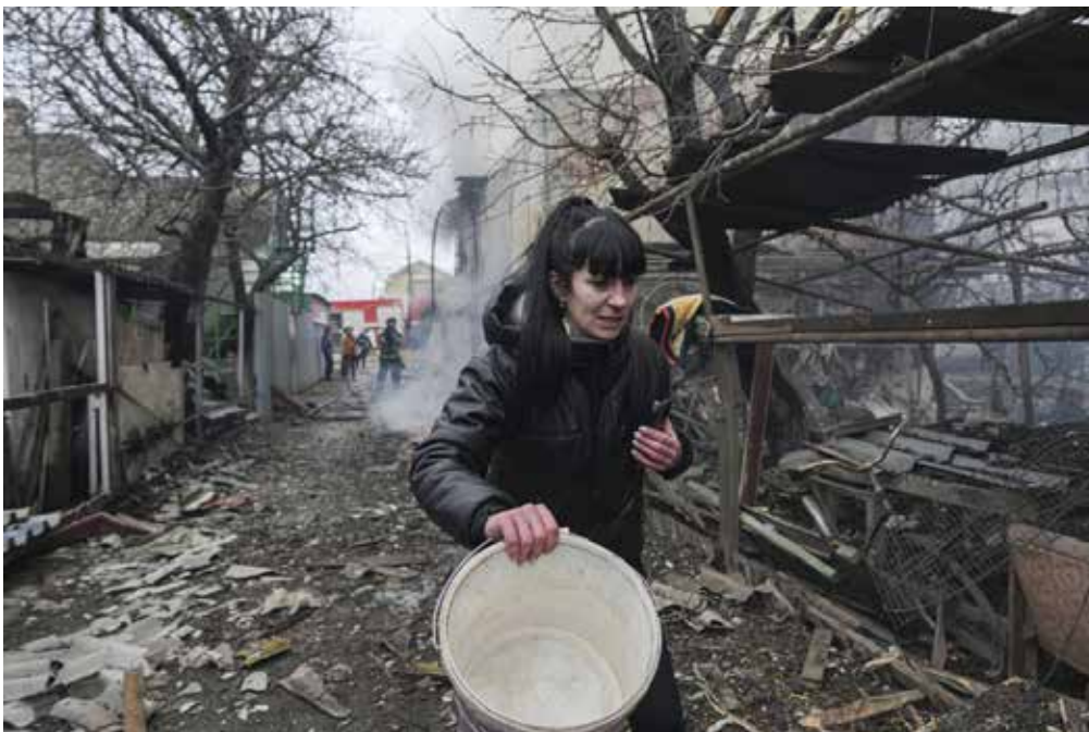
A woman walks past the debris in the aftermath of Russian shelling, in Mariupol, Ukraine, Thursday, Feb. 24, 2022.

Zelenskyy, who earlier cut diplomatic ties with Moscow and declared martial law, described Russian forces advancing on a series of fronts, including a "difficult situation" developing in Kharkiv, Ukraine's second-largest city, just over 20 kilometers away from the eastern border with Russia, and Russian troops slowly advancing from the north on the city of Chernihiv.