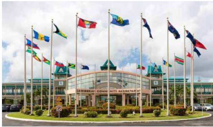
The CARICOM Secretariat in Georgetown, Guyana.

Weeks of intense diplomacy and the imposition of Western sanctions on Russia failed to deter Putin, who had massed between 150,000 and 200,000 troops along