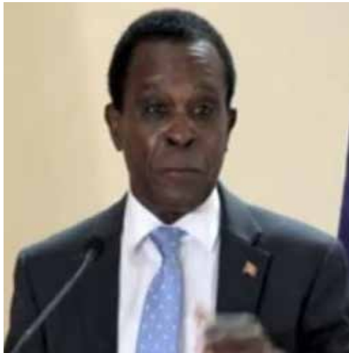
Prime Minister of Grenada, Dr Keith Mitchell, addressing the signing ceremony for the St George's Declaration on Roaming on February 23, 2022.

He said essentially the Single ICT Space represents the digital arm of the CARICOM Single Market and Economy (CSME) that allows for the free movement of skills, goods, ser-