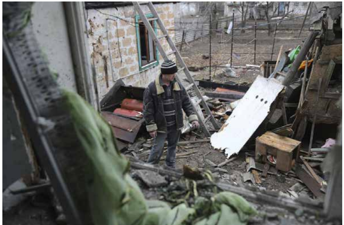
A local citizen stands between debris of his house following Ukrainian shelling in the territory controlled by pro-Russian militants, eastern Ukraine, Thursday, Feb. 24, 2022.

The chief of the NATO alliance said the “brutal act of war” shattered peace in Europe, joining a chorus of world leaders who decried