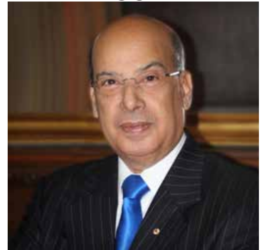
Sir Ronald Sanders

At the time of writing, both the United Nations and the Organization of American States (OAS) are working on issuing strong resolutions, condemn-