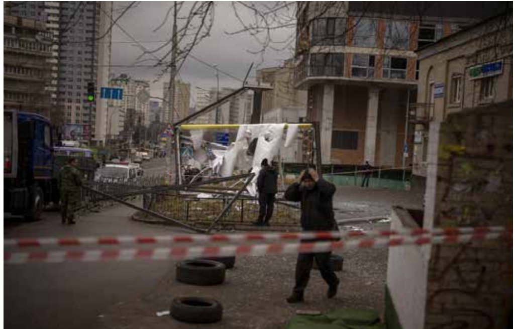
Police officers inspect area after an apparent Russian strike in Kyiv Ukraine, Thursday, Feb. 24, 2022. Russian President Vladimir Putin on Thursday announced a military operation in Ukraine and warned other countries that any attempt to interfere with the Russian action would lead to "consequences you have never seen."

"Russia has embarked on a path of evil, but Ukraine is defending