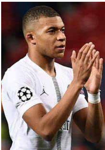
Paris-Saint Germain forward Kylian Mbappe

Paris-Saint Germain forward Kylian Mbappe has reportedly turned down the Ligue 1 club's latest contract offer.