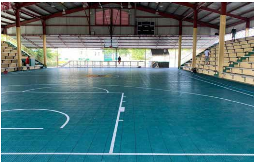
The resurfaced basketball court at the JSC Sports Complex.

It was in these trips to the World Youth Basketball Festivals that Browne's eyes were opened to the benefits that could be achieved by Antigua and Barbuda as a sports tourism destination if an indoor basketball sta-