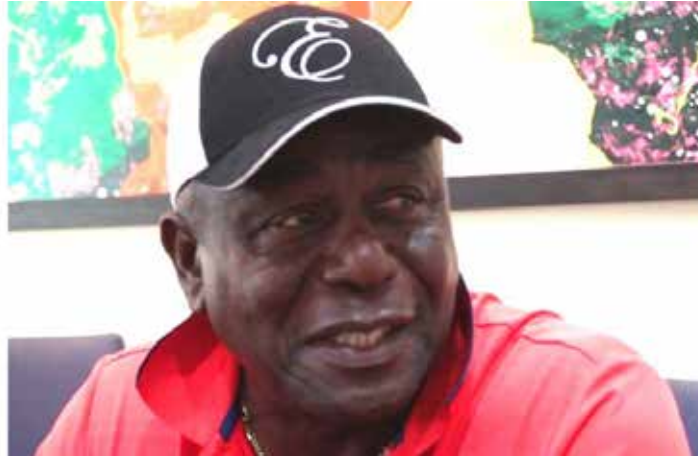
Dr. Desmond Haynes

Some of the top performers in the first two rounds of the West Indies Four-Day Championship have been included in the squad. John Campbell is back in the set-up after im-