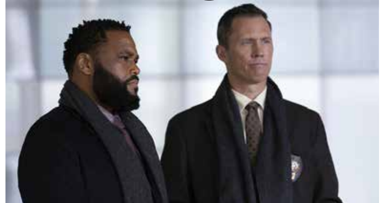
Anthony Anderson and Jeffrey Donovan in 'Law & Order.'

alities and power dynamics are thus already pretty clear, following series creator Dick Wolf's maxim to flesh out details about the regular players with an eye-dropper, not a ladle. In "Law & Order," the focus is and always has been on the cases, not the personnel.