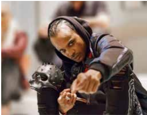
Tommy Lee Sparta

The attorney said he is awaiting the outcome of the Independent Commission of Investigation (INDECOM) probe to decide on how to move forward on his client's behalf.