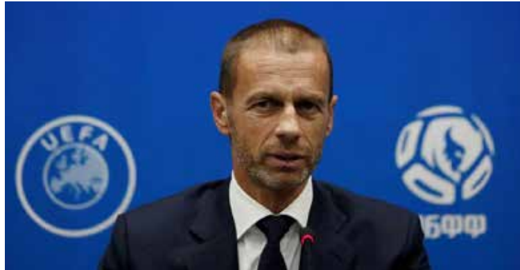
UEFA President Aleksander Ceferin speaks during a news conference in Minsk, Belarus September 19, 2019.

"We are dealing with this situation with the ut-