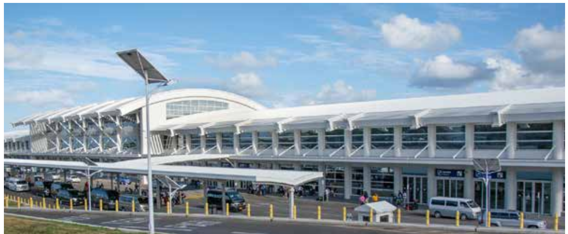
V.C. Bird International Airport

"That document as well as others that are usually shown to port health upon your arrival here in Antigua. The object is to have that document in electronic format so that it could reduce significantly the amount of minutes one spends in front of the port health authorities