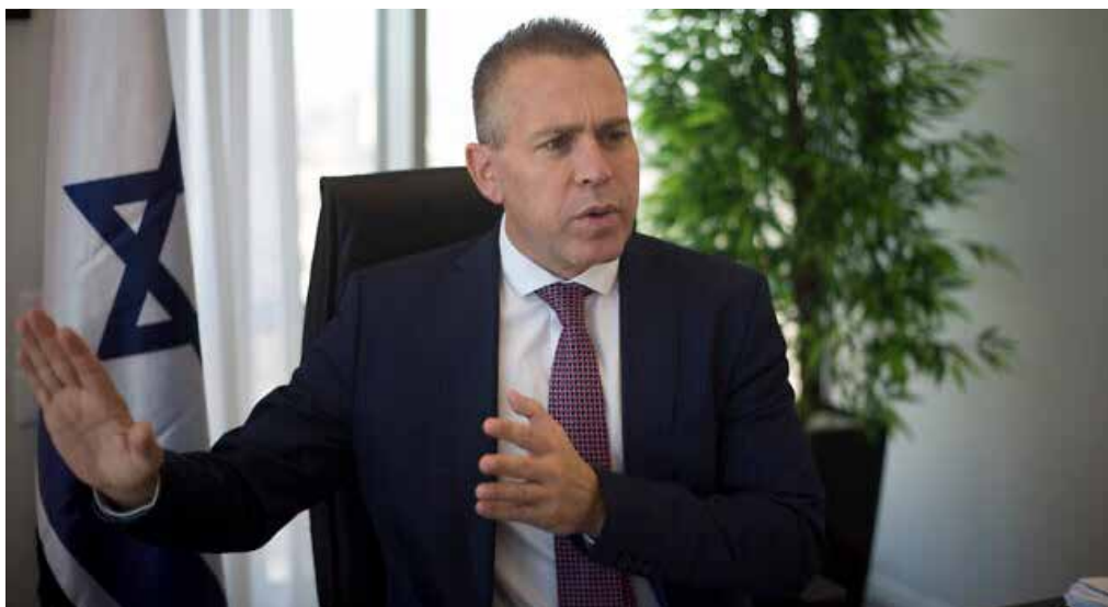
Israeli Public Security Minister Gilad Erdan speaks during an interview with The Associated Press in his office in Bnei Brak, east Tel Aviv, on Thursday, October 26, 2017.

He said the Security Council may not be ready to use the word "apartheid." But he said it is, and has been, "our reality," and while Israel may be outraged by Palestinians using the