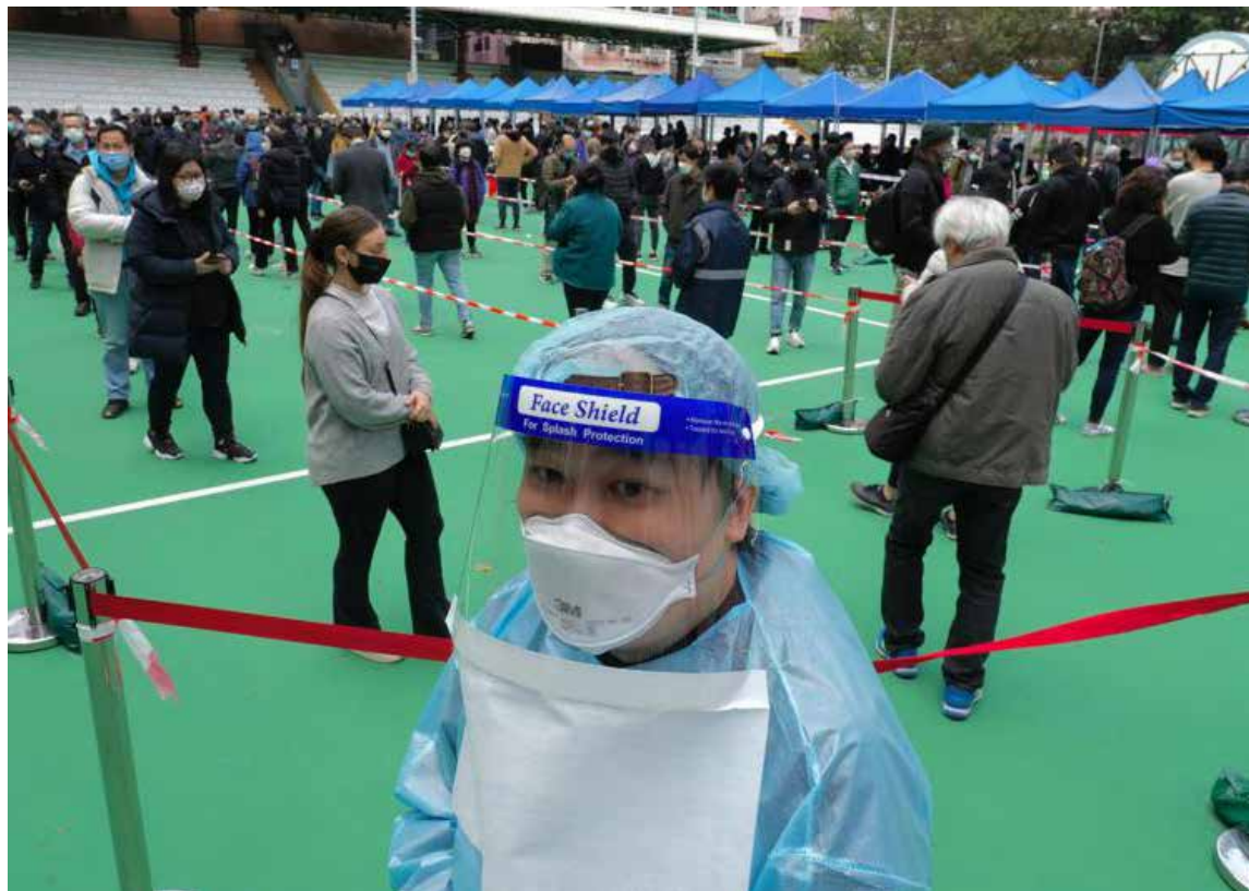
Residents queue up to get tested for the coronavirus at a temporary testing center for COVID-19 in Hong Kong, Thursday, Feb. 24, 2022.

Mainland experts have been brought in to help put up temporary testing facilities and new isolation wards to handle a mass testing of the entire population of 7.4 million people