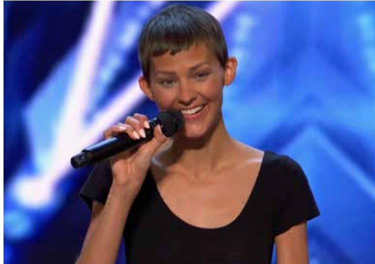
Host and judges pay tribute to 'America's Got Talent' contestant who lost battle to cancer

The singer caught the attention of many after delivering a stunning audition last year on "America's Got Talent," performing an original song called "It's OK." During her performance, she disclosed to the judges that she was battling cancer that had spread to her lungs, spine and liver. She impressed judge Simon Cowell with her positivity and