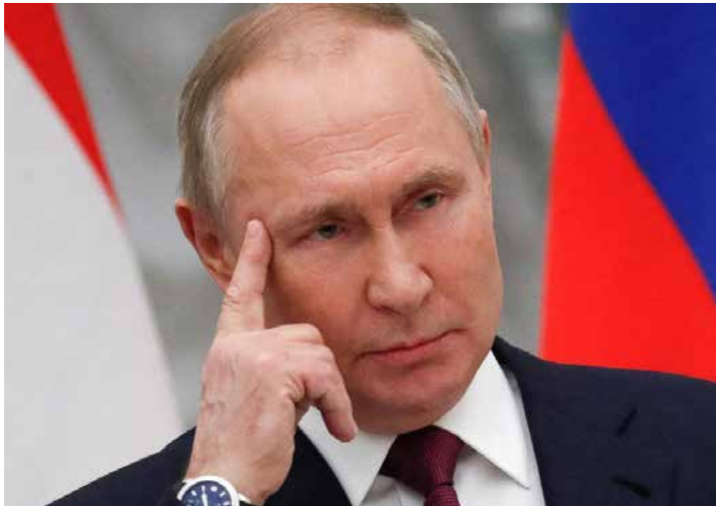
Vladimir Putin was speaking after talks with Hungarian Prime Minister Viktor Orban in Moscow.

Mr Putin said the US had ignored Moscow's concerns in its response to Russian demands for legally binding security guarantees, including a block on Nato's further expansion to the east.