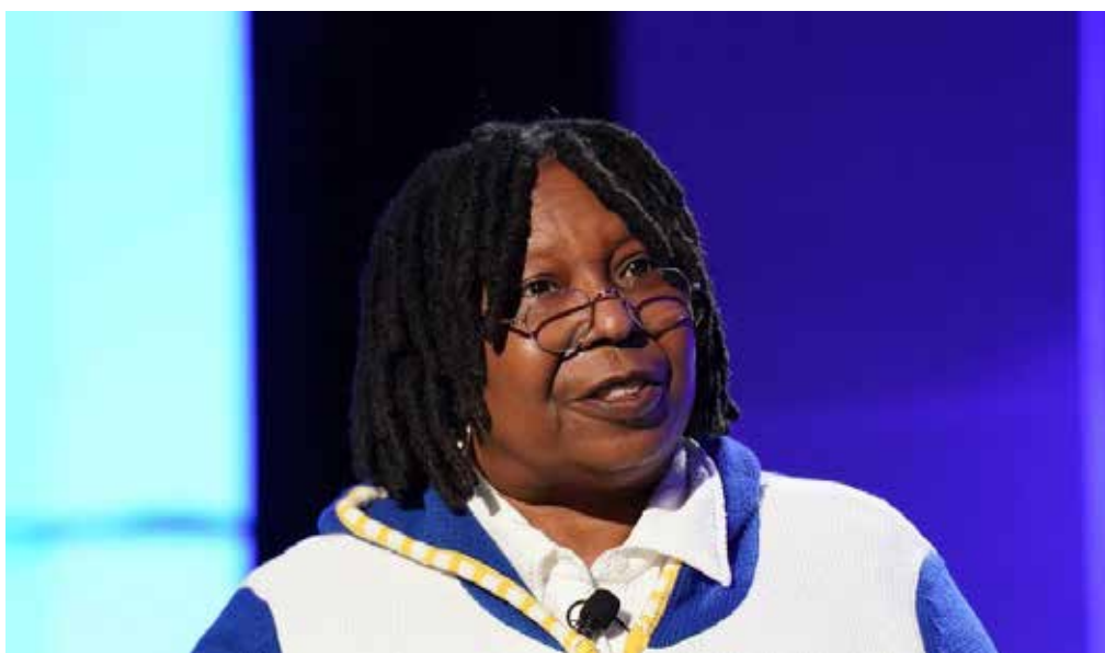
Whoopi Goldberg made the comments on the talk show The View.

Goldberg said: "But it's not about race. It's not. It's about man's inhumanity to other man."