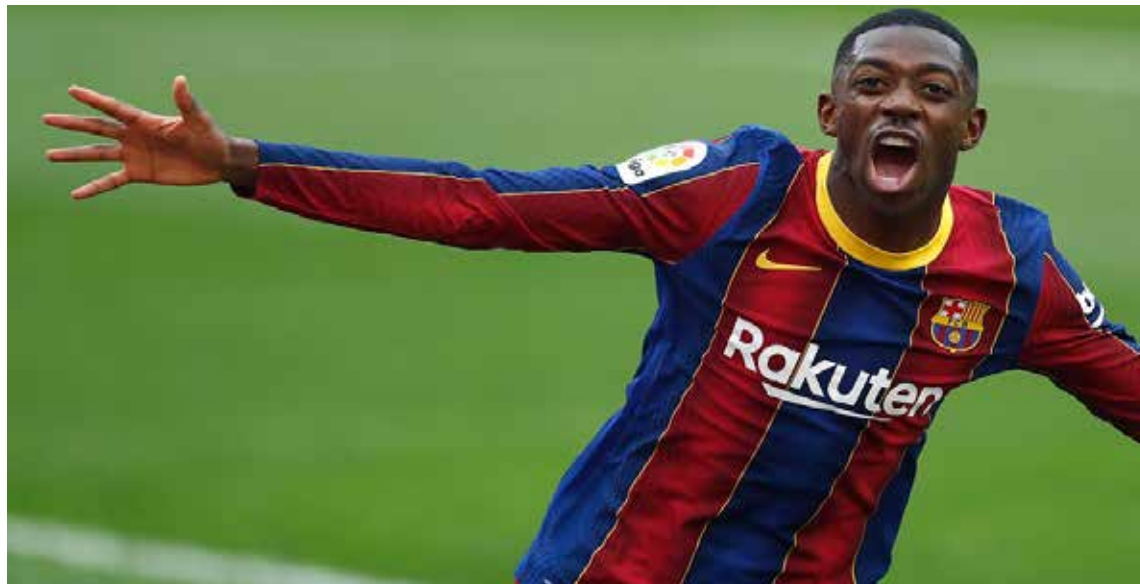
Barcelona's Ousmane Dembele celebrates after scoring during a Spanish La Liga football match against Sevilla at the Ramon Sanchez-Pizjuan stadium in Seville, Spain, Saturday Feb. 27, 2021.

Dembélé's contract ends in June and he will be able to leave for free. Barcelona broke their own record to sign the young forward from Borussia Dortmund in 2017 in a deal worth up to 147 million euros (then