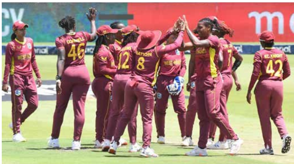
West Indies Women celebrate a wicket during the second One-Day International against South Africa at the Wanderers Stadium in Johannesburg on Monday.

Once in the super-over, Dottin stamped her authority, plundering 19 runs from the first five balls before her partner Hayley Matthews smashed the final ball over mid-wicket for six, to leave the visitors defending 25 runs. Facing a tall order, South Africa gathered 15 from the first four balls but