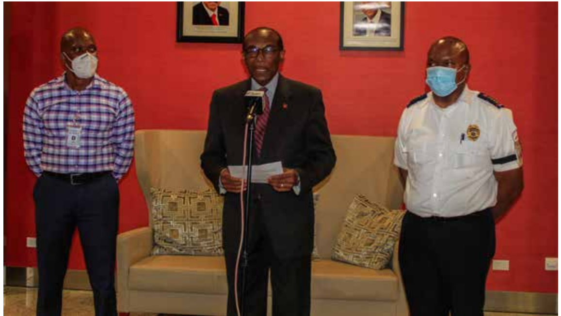
Minister of Health, Wellness and the Environment Sir Molwyn Joseph, centre, accepted a shipment of AstraZeneca Vaccines and Rapid Antigen Tests from the Government of Malta

"It is amazing to me that after one meeting in