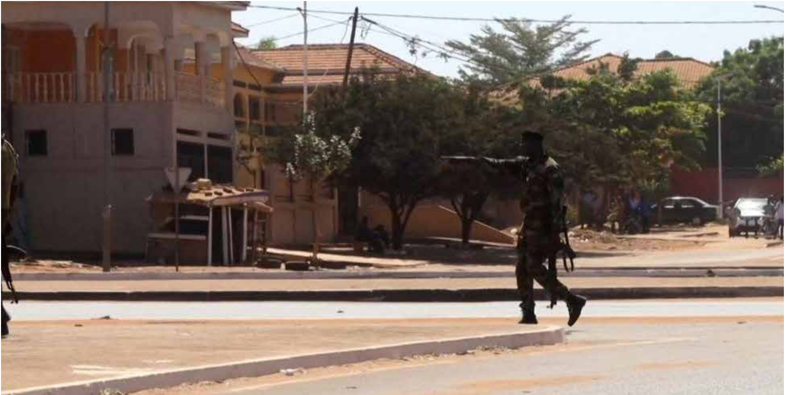
Soldiers could be seen patrolling the government palace area.

BBC - A reported coup in the West African state of Guinea-Bissau has left many members of the security forces dead, its president says.