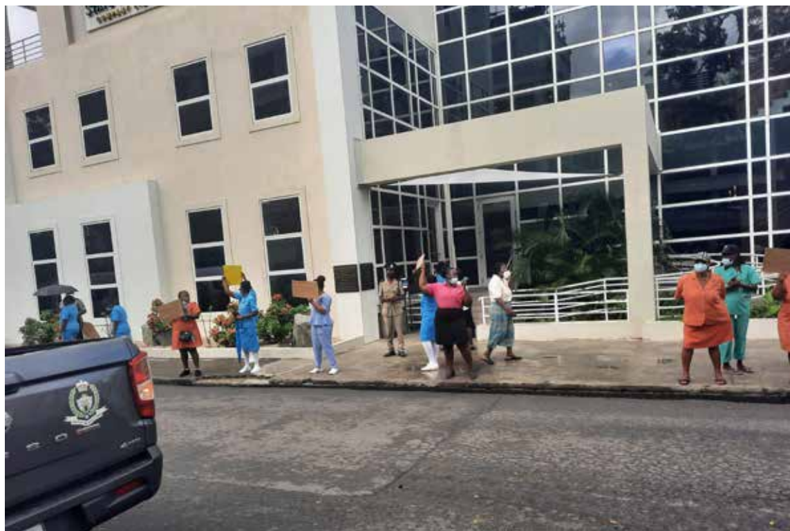
The workers descended on the Treasury Department yesterday morning in protest

dramatically during the COVID period. Now we’re rebounding, we are slowly prioritizing different workers,” Weston added.