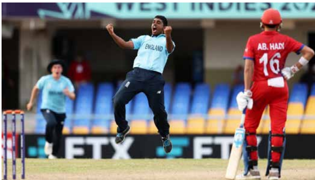
Rehan Ahmed claimed three wickets at the death to rescue England