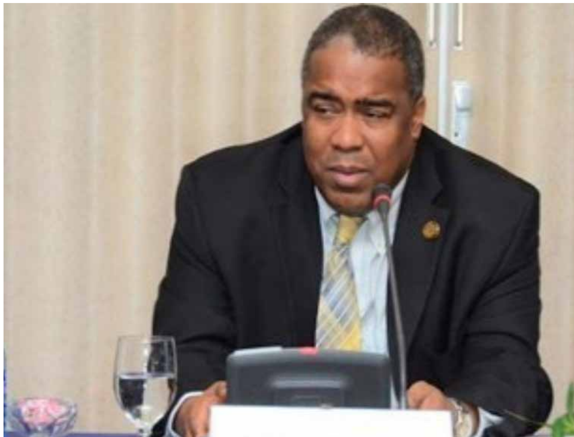
Former Finance Minister Gillmore Hoefdraad.