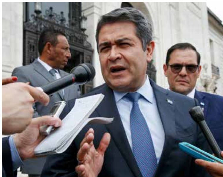
Former president of Honduras, Juan Orlando Hernández

U.S. prosecutors in New York had repeatedly implicated Hernández as a co-conspirator during his brother's 2019 drug trafficking trial, alleging that