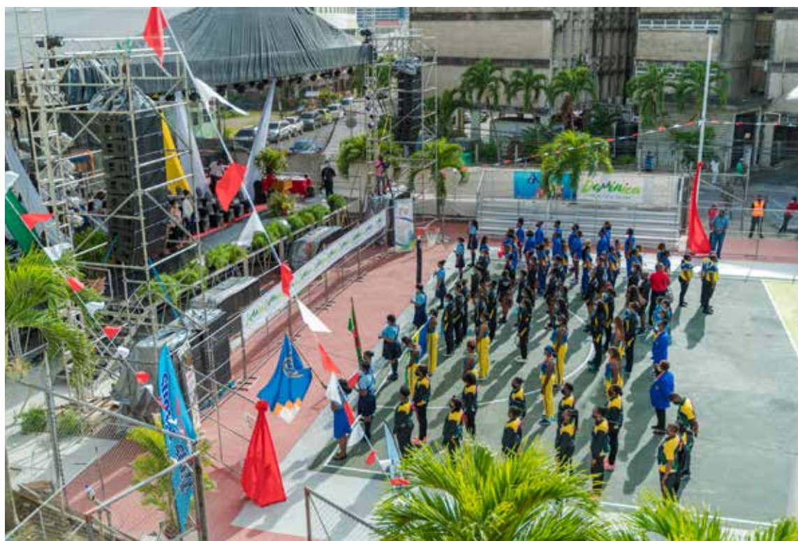
An aerial view of the participating teams during the opening ceremony at the Second Organisation of Eastern Caribbean States (OECS) Eastern Caribbean Central Bank (ECCB) International Netball Series at Windsor Park Stadium in Dominica on Sunday, 13 February, 2020.