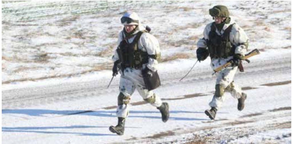
A Russian military build-up around Ukraine has sparked alarm

Russia has deep cultural and historic ties with Ukraine, and has been seeking guarantees it will not join the Nato military alliance, something the