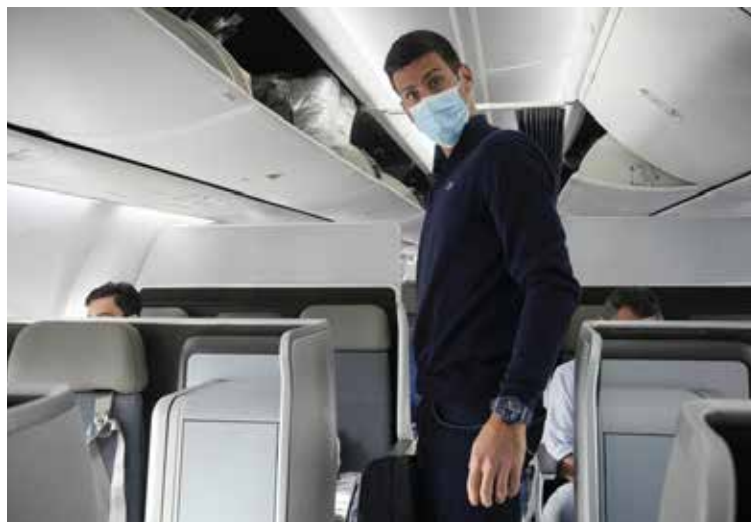
Novak Djokovic prepares to take his seat on a plane to Belgrade, in Dubai, United Arab Emirates, Monday, Jan. 17, 2022.

If need be, not defending his titles at Roland Garros and Wimbledon and missing other tournaments is