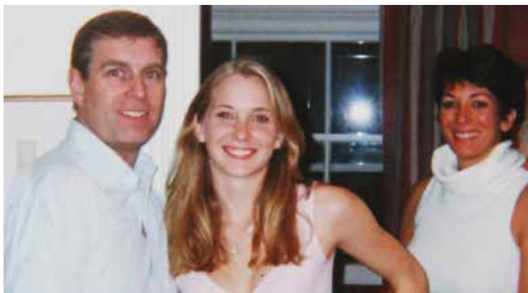
Prince Andrew, Virginia Roberts and Ghislaine Maxwell in 2001

In a letter to US judge Lewis A Kaplan, Ms Giuffre's lawyer David Boies wrote jointly with Prince