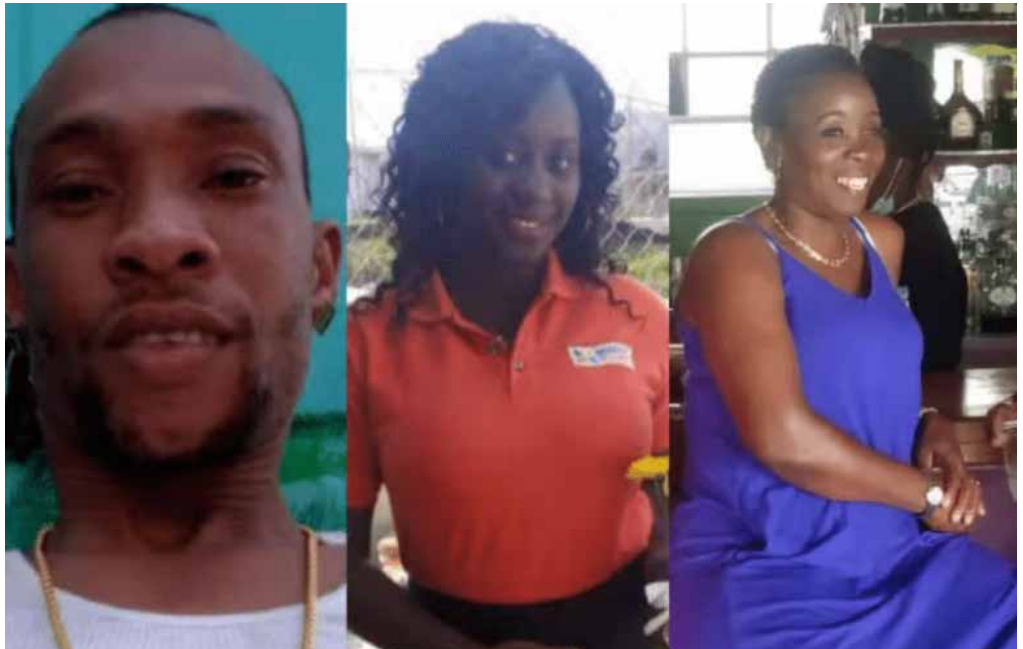
Shooting victims.

At Monday's news conference, the Royal Saint Lucia Police Force (RSLPF) extended sincere condolences to the relatives, friends, and others impacted by the tragedy and disclosed that the organisation would be providing psycho-social support to those affected, including responding law enforcement officers.