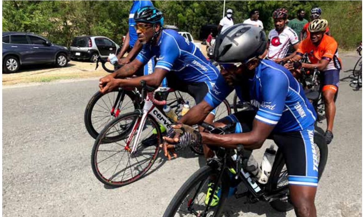
ABCF Southern Loop Road Race, Sunday 16th May 2021

"The reason why we had to do a time trial for the first race of the season is because of COVID-19. Normally, when we have a time trial you will have somebody standing behind you that will hold up your bike so