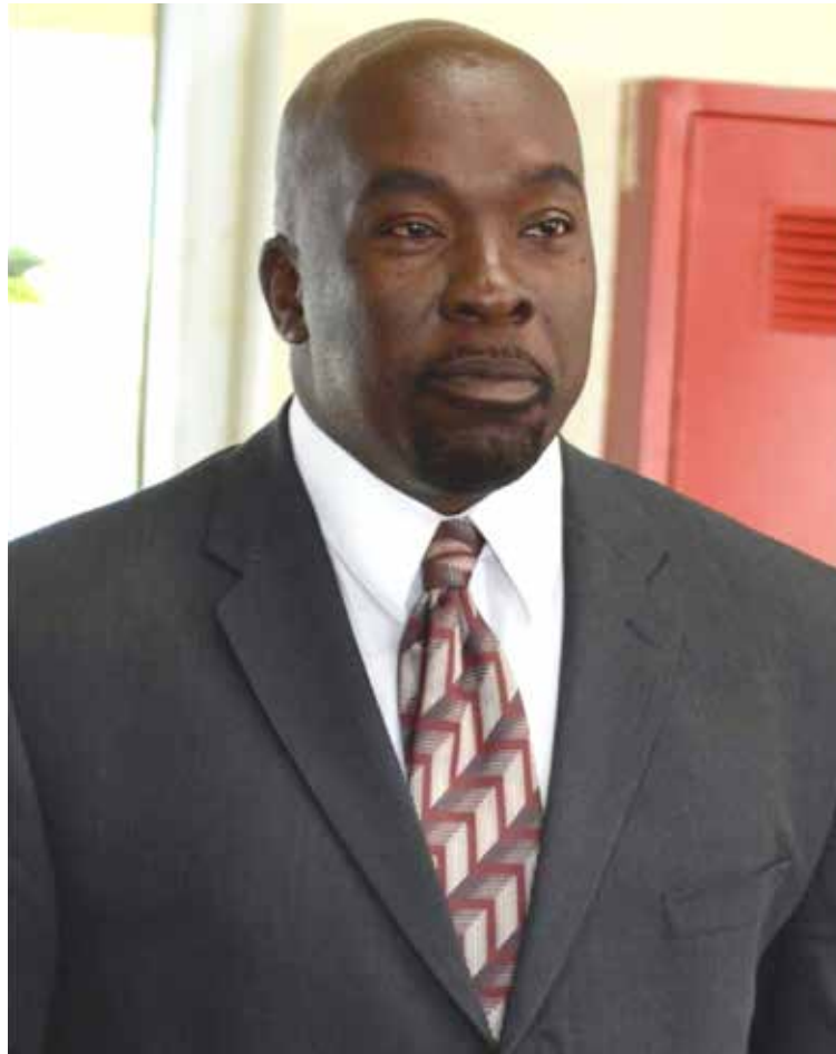
Telecommunications Minister Melford Nicholas

"We are in discussions currently with FLOW, and