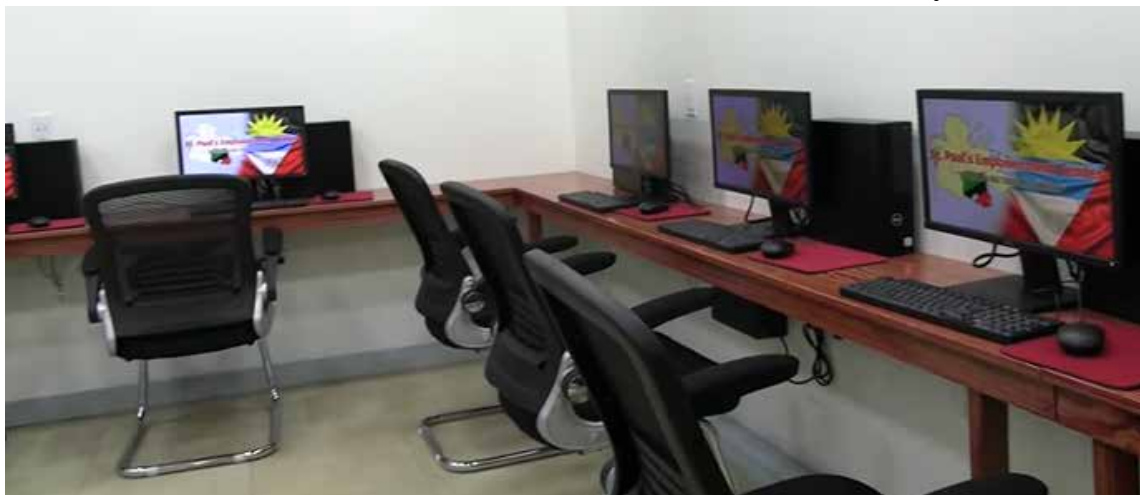
The St. Paul's Empowerment Centre's IT room

MP Greene indicated that a schedule will be published shortly with the available programmes on offer along with registration details.