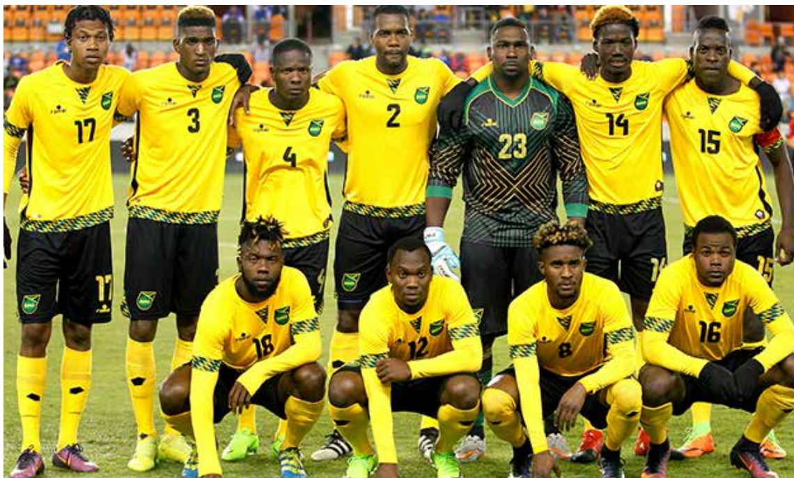
Jamaica's football team

points behind fourth place team Panama with four games remaining. Earlier Sunday Canada defeated the United States 2-nil, while