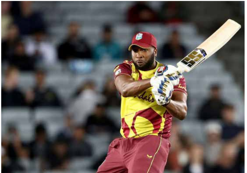
Kieron Pollard will lead the West Indies team in the India series.

“I have no reason to believe there will be any change in coach and captain any time soon. But remember the captaincy is evaluated as is the coach. If the system says these guys are not right people, we will deal with it. At the moment I don’t see anything coming at me that says these guys must go.