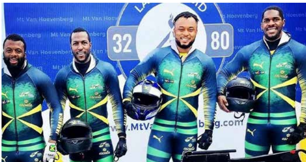
Jamaica's 2022 Bobsled team

President of the JBSF, announced that the Americans, realizing their