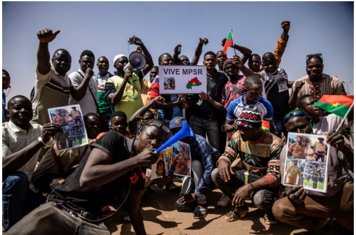
People take to the streets of Ouagadougou to express support for the coup makers

The AU's move came three days after the Economic Community of West African States (ECOWAS) regional bloc suspended Burkina Faso from its ranks and warned of possible sanctions pending the outcome of meetings with the coup makers, who have dissolved the government and parliament and suspended the constitution, pledging to re-establish "constitutional order"