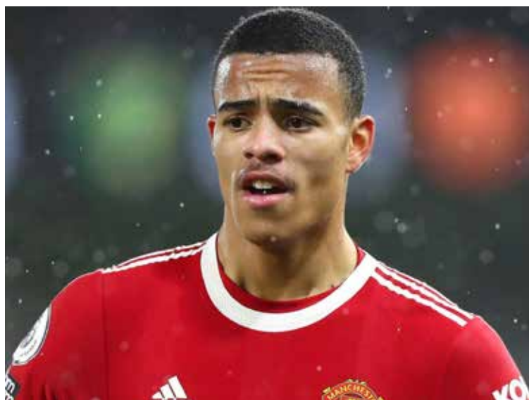
Mason Greenwood

The England international who made his debut for Manchester United in March 2019, was arrested on Sunday following allegations on social media. Greater Manchester Police (GMP) said he remained in custody for questioning. Manchester United earlier said the forward would not return to training or matches