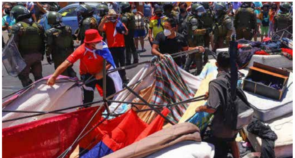
Some protesters tore down a makeshift migrant camp

But there have been growing tensions over border control in the country, with migration and crime among