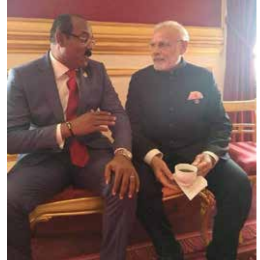
Prime Minister Gaston Brown speaks with Indian Prime Minister Narendra Modi.

ISA is an action-oriented, member-driven, collaborative platform for increased deployment of solar energy technologies as a means for bringing en-