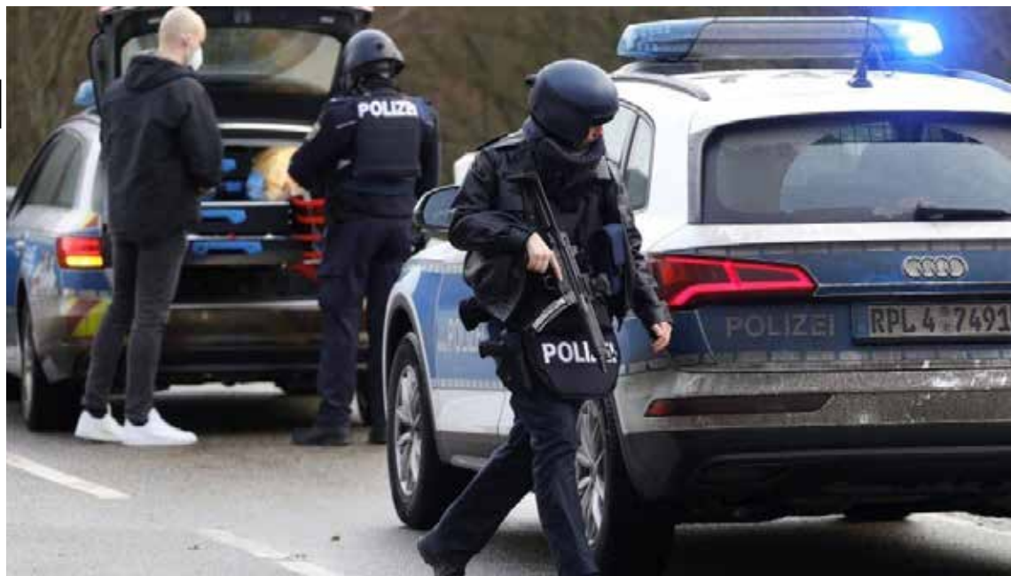
Officers shut roads in the area while launching a major manhunt on Monday.

Some details of the incident are unclear. As yet there is little description of what happened in the attack and police have not suggested a possible motive.