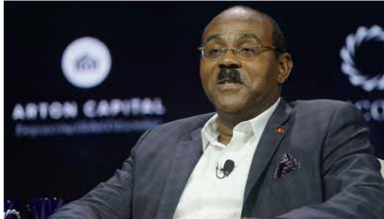
Prime Minister Gaston Browne

"We would have strengthened the legislative