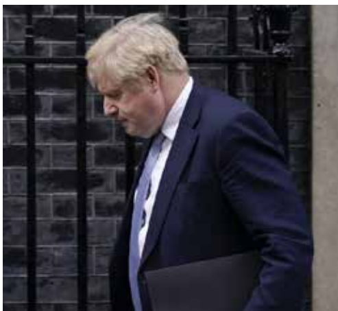
Britain's Prime Minister Boris Johnson leaves 10 Downing Street as he makes his way to the House of Commons, in London, Monday, Jan. 31, 2022.

Her findings on 12 others have been withheld at the request of the police, who last week launched a criminal investigation into the most serious alleged breaches of coronavirus rules.