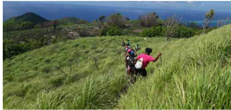
Signal Hill before vandals set fire to the area last year.

"Yesterday morning [Sunday] when Wallings Nature Reserve along with the 35 volunteers got to Signal Hill, all the plants were eaten. When we did a quick assessment to see how many plants remained on the hill before we would have updated the tracker, we did not have over