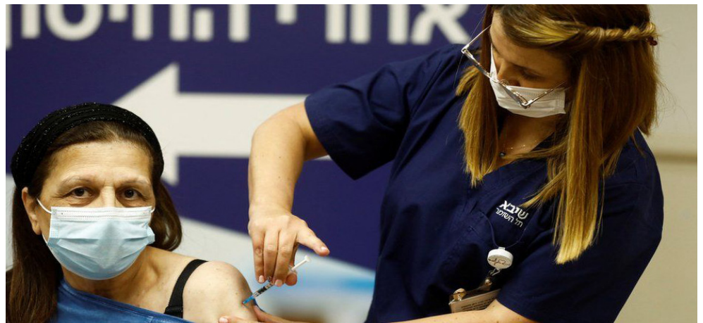
Israel has approved a fourth vaccine dose for the immunocompromised and the elderly in care homes

The prime minister has previously insisted the aim is to prevent a spike in serious illness while keeping the