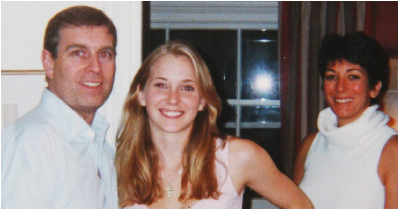
Prince Andrew, Virginia Roberts and Ghislaine Maxwell in 2001

Virginia Giuffre agreed not to sue anyone connected to Jeffrey Epstein who could be described as a “potential defendant”, a 2009 damages settlement against the sex offender shows.