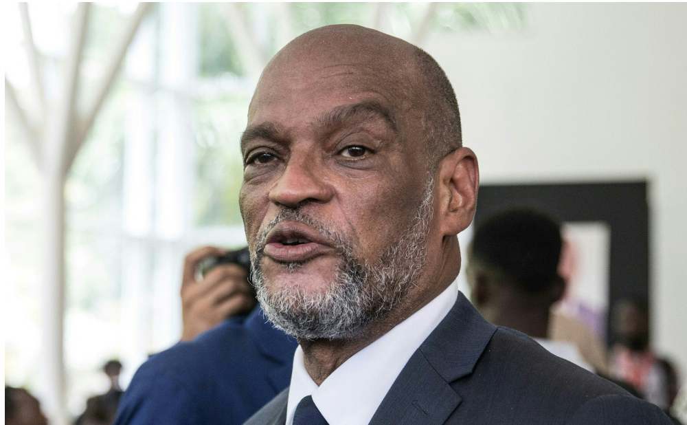
Prime Minister of Haiti, Ariel Henry

Henry, who was installed as prime minister weeks after President Jovenel Moïse was assassinated at his home in early July, has been focusing on trying to clamp down on the increase in crime and violence across the country.