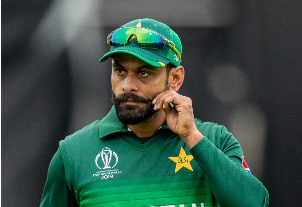
Former Pakistan captain Mohammad Hafeez has retired from international cricket

Former Pakistan captain Mohammad Hafeez has retired from international cricket.