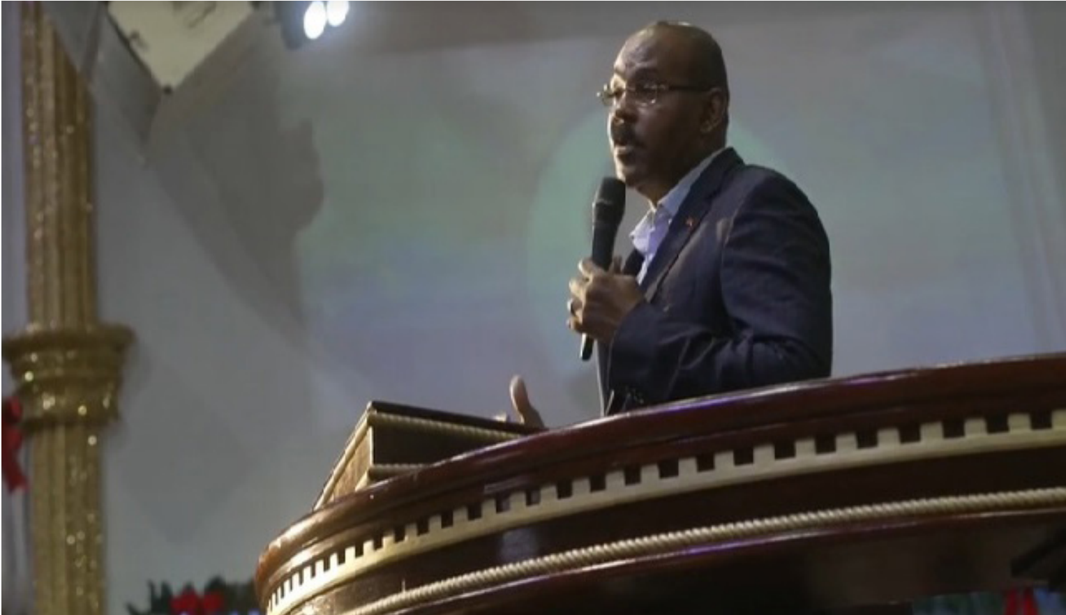
PM Gaston Browne appealed to members of the public to become vaccinated during Sunday's National Service of Thanksgiving and Prayer

During the National Service of Thanksgiving and Prayer, Prime Minister Gaston Browne made an appeal to those who have not received one of the approved vaccines to do so.