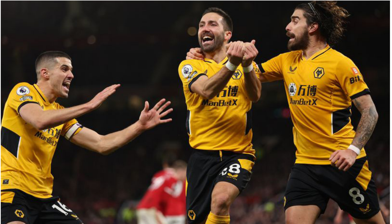
Red Devils downed by Moutinho

Joao Moutinho's late strike downed an insipid Manchester United as Wolves recorded a 1-0 win in the Premier League yesterday.