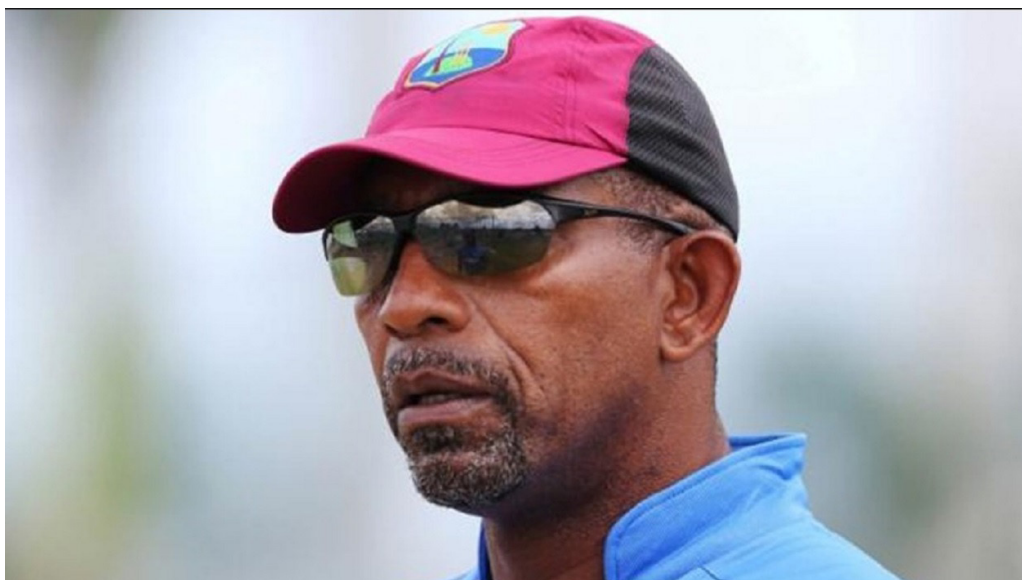
West Indies head coach, Phil Simmons

West Indies head coach Phil Simmons is expecting more energy and enthusiasm from a new-look squad as the team bowls off the year with series against Ireland and England.