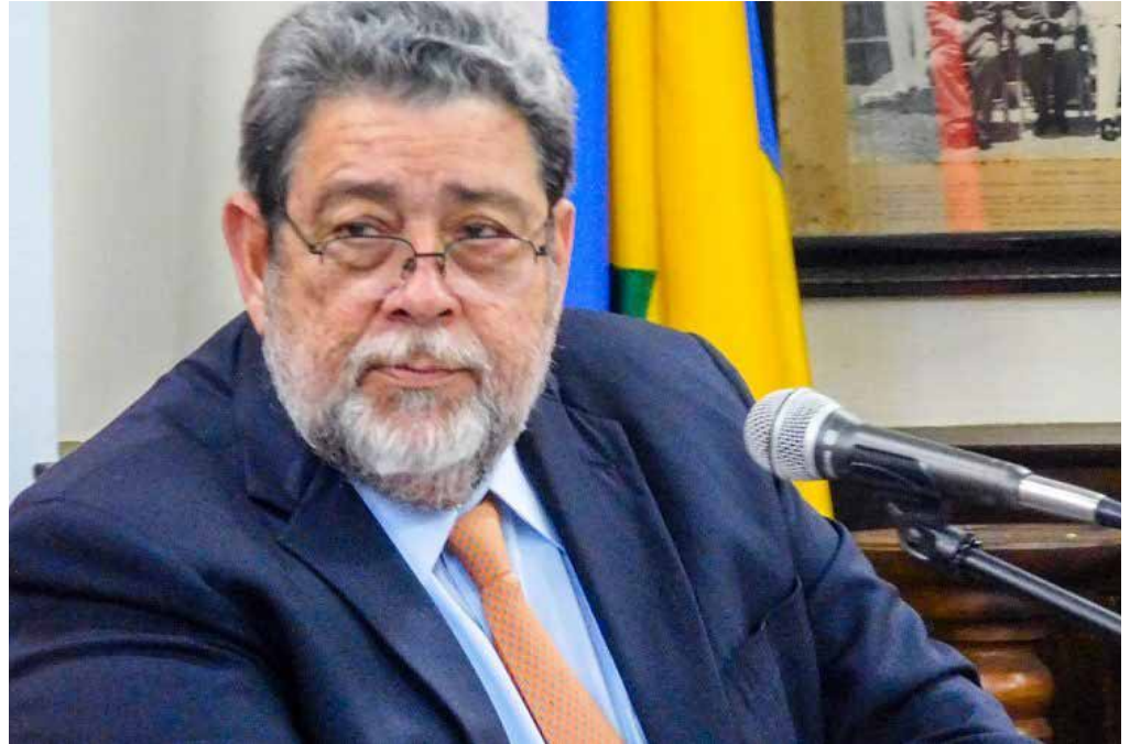
Prime Minister Ralph Gonsalves

He noted that on Dec. 14, the Gazette published, through the Eastern