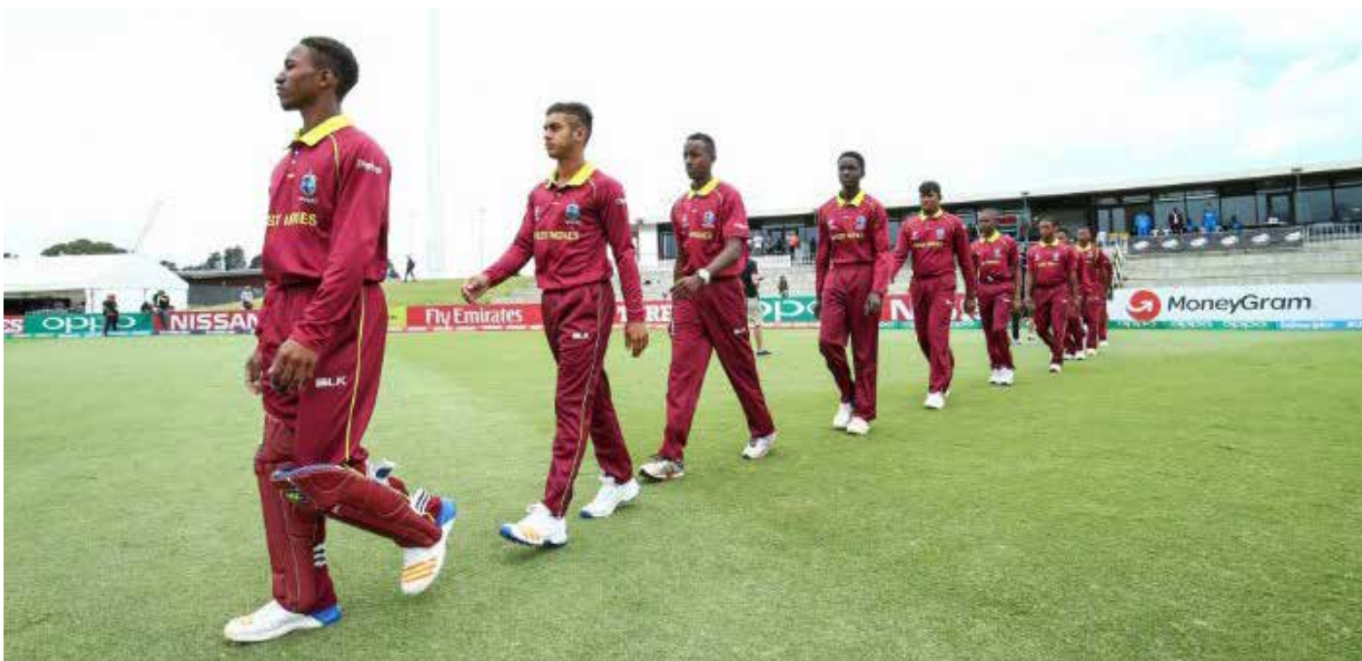
The West Indies Under-19 team.

West Indies Under-19 Under-19's today in Trinidad will play Papua New Guinea and Tobago in a quarter-final of the ICC Men's Under-19 Cricket World Cup Plate