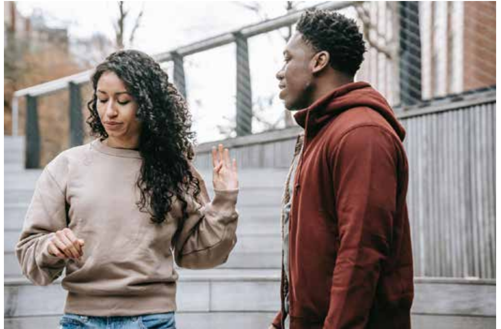
Free yourself from a pattern of dysfunctional relationships.

Emotional or mental abuse: calling you derogatory names, yelling, blaming, or threatening you; dismissing your feelings or telling you that you're "crazy," exaggerating, confused, or making things up.