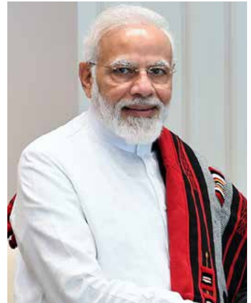
Prime Minister of India, Hon. Mr. Narendra Modi

Till today, only a handful of countries have developed their own vaccines. More than 180 countries are dependent on an extremely limited pool of producers and dozens of nations are still waiting for the supply of vaccines, even as India has crossed 1.6 billion doses! Imagine the situation if India did not have its own vaccine. How would have India secured