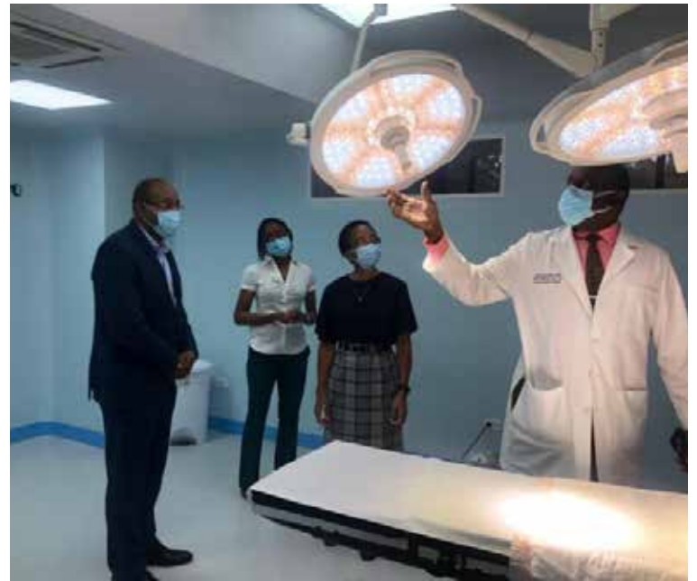
PM Gaston Browne touring Rover Surgical Suites on Monday

continued support. Any you can rest assured that it assistance you may need, will be forthcoming," said once it is within our means, Browne.