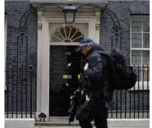
A police officer walks past 10 Downing Street in London, Tuesday, Jan. 25, 2022

Police have previously faced criticism for suggesting that they wouldn’t investigate the “partygate” scandal because they don’t routinely investigate historical breaches of coronavirus regulations.