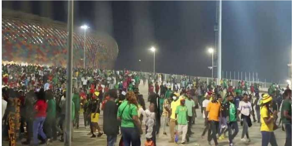
At least eight people, including two children, were killed outside Yaounde Stadium

Two children, aged eight and 14, were among the dead, and seven people were seriously injured in the crush. Caf president Patrice Motsepe visited injured supporters in the hospital and the scene outside the Olembe Stadium on Tuesday, and later said he was "sad