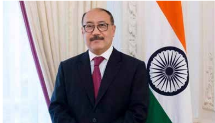
Harsh Vardhan Shringla is the Foreign Secretary, Government of India

The pandemic has demonstrated that we need a more, and not less, interconnected world. Common problems must have common solutions. Prime Minister Narendra Modi, over the last few months, has in the G7, G20, in COP 26, in the first Quad Summit, in the United Nations General Assembly and as Chair of the UN Security Council, BRICS and the Shanghai Cooperation Organisation Council of Heads of Government, articulated a vision of a new world order that is relevant to the challenges of the post-pandemic world. He has also, through a vari-