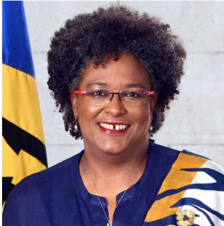
Barbados' Prime Minister Mia Mottley

“The government that I led is determined that Barbados will be viewed as one of the world’s top countries, a place of energy and enlightenment, opportunity.