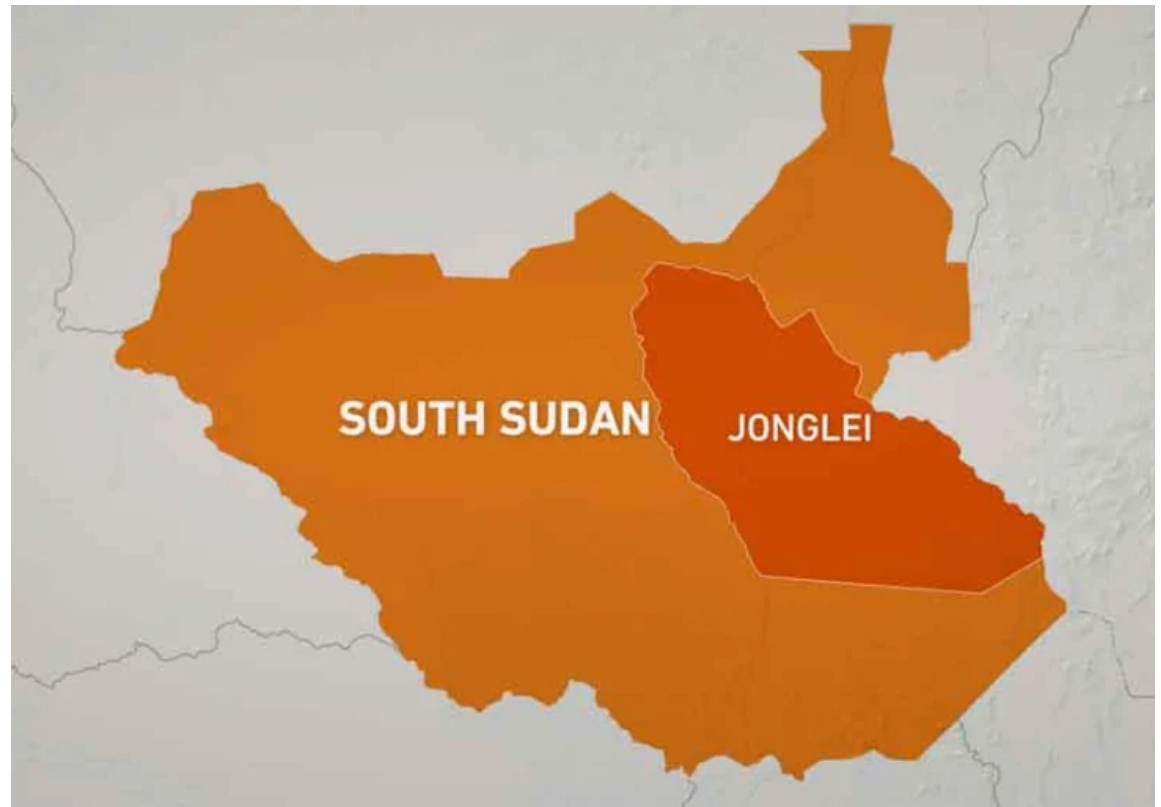
Map of South Sudan's Jonglei state.

"The Mission further calls on authorities to carry out timely investigations and that the perpetrators be held accountable."