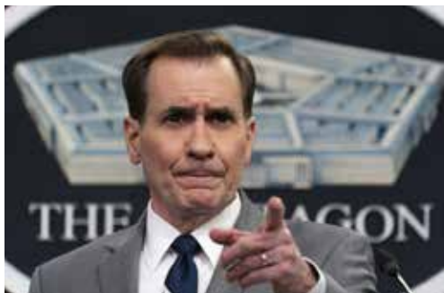
Pentagon spokesman John Kirby speaks during a briefing at the Pentagon in Washington, Monday, Jan. 24, 2022.

“I had a very, very, very good meeting -- total unanimity with all the European leaders,” Biden told reporters at the