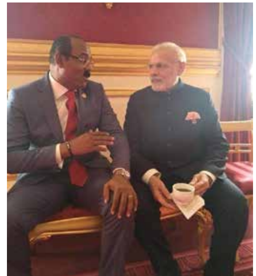
Prime Minister Gaston Browne meeting with Prime Minister Narendra Modi

Hon'ble Prime Minister of India, Mr. Narendra Modi had announced during