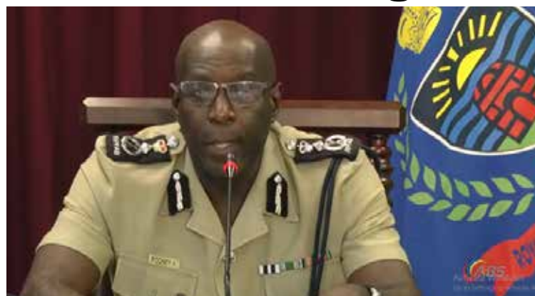
Commissioner of Police, Atlee Rodney

“Most of the complaints deal with the issue of incurring debt; house rent,