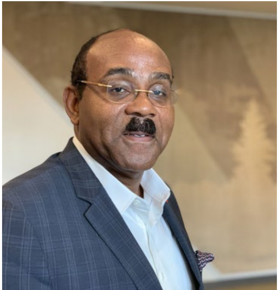
Prime Minister Gaston Browne.

"We wanted to go into 2022 with less restrictions as we seek to strike that delicate balance between saving lives and saving livelihoods. We can't be paralysed by COVID. We have to learn to live with COVID," PM Browne declared.