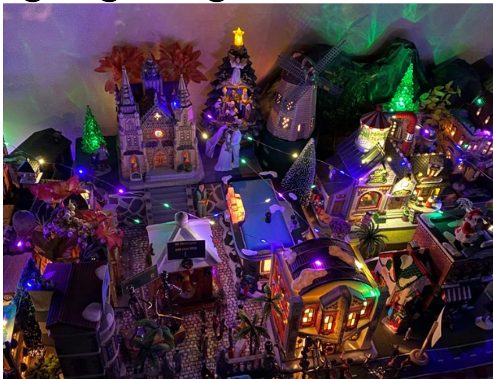
Entrepreneur creates Christmas Village highlighting Caribbean culture

The Village comes alive, especially at night when the decorative lights are switched on and the buildings are lit. It features a harbour with yachts and a cruise ship, palm trees, a sugar mill, along with