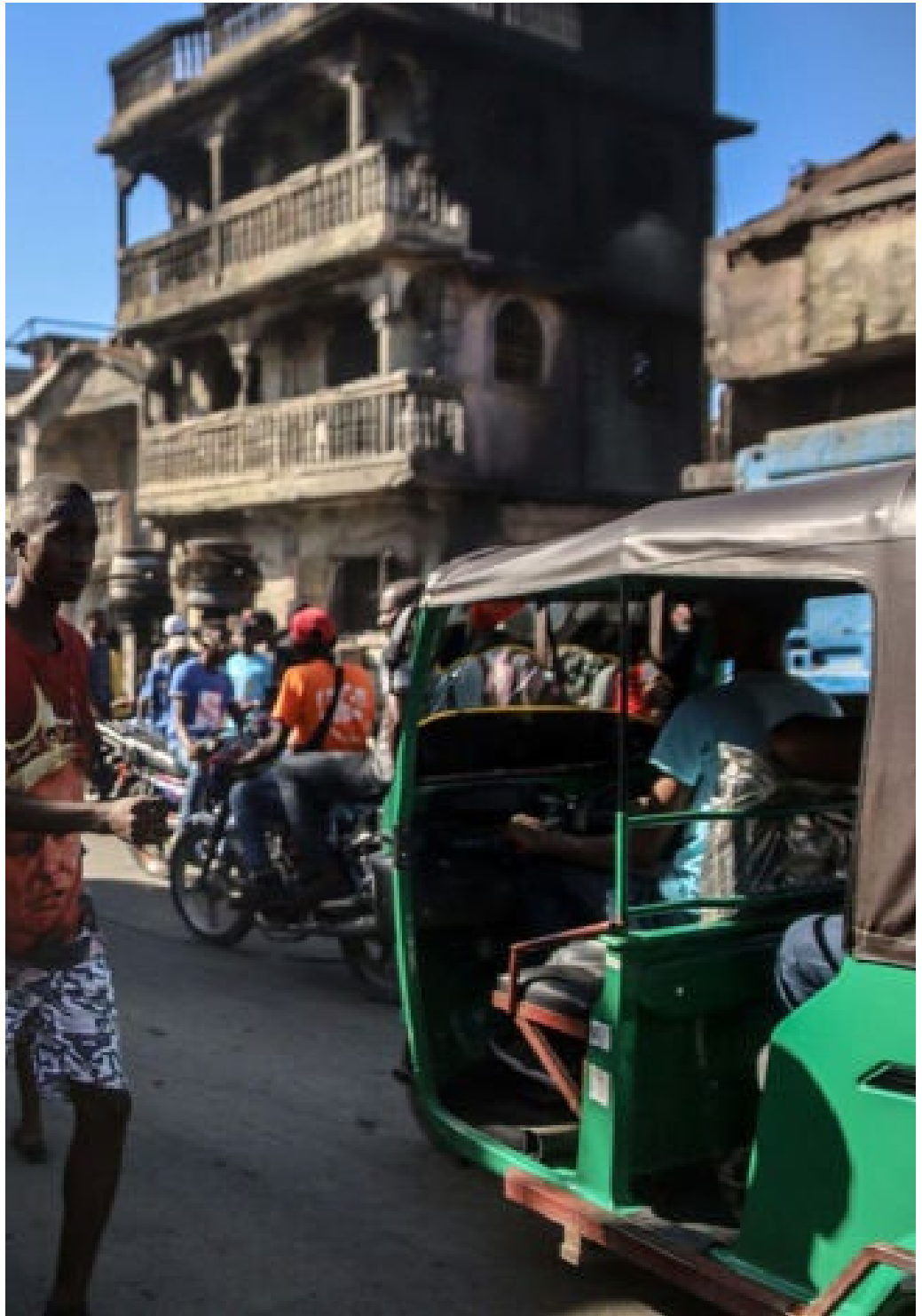
People walk in the streets near the site of an oil tanker explosion on December 15, 2021 in Haiti.

The first two of the hostages were released in late November, followed by three more missionaries on Dec. 5th.