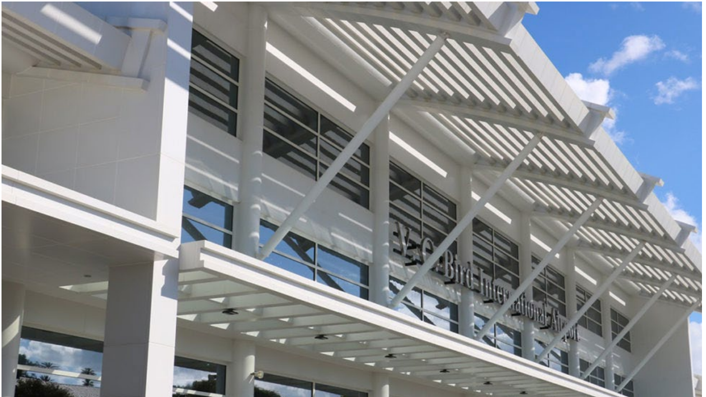
VC Bird International Airport