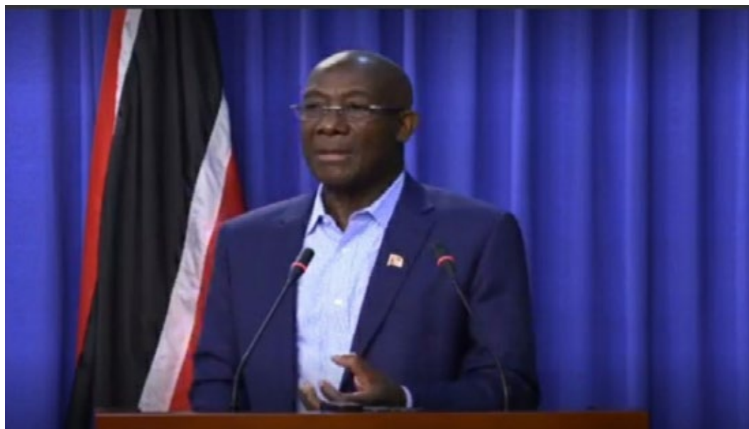
Prime Minister Dr. Keith Rowley

He added that no consumption of alcohol, loud music or partying