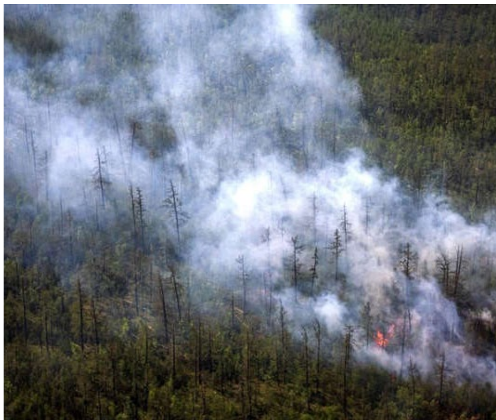
Wildfires have been made more severe by high temperatures and strong winds in the Arctic.