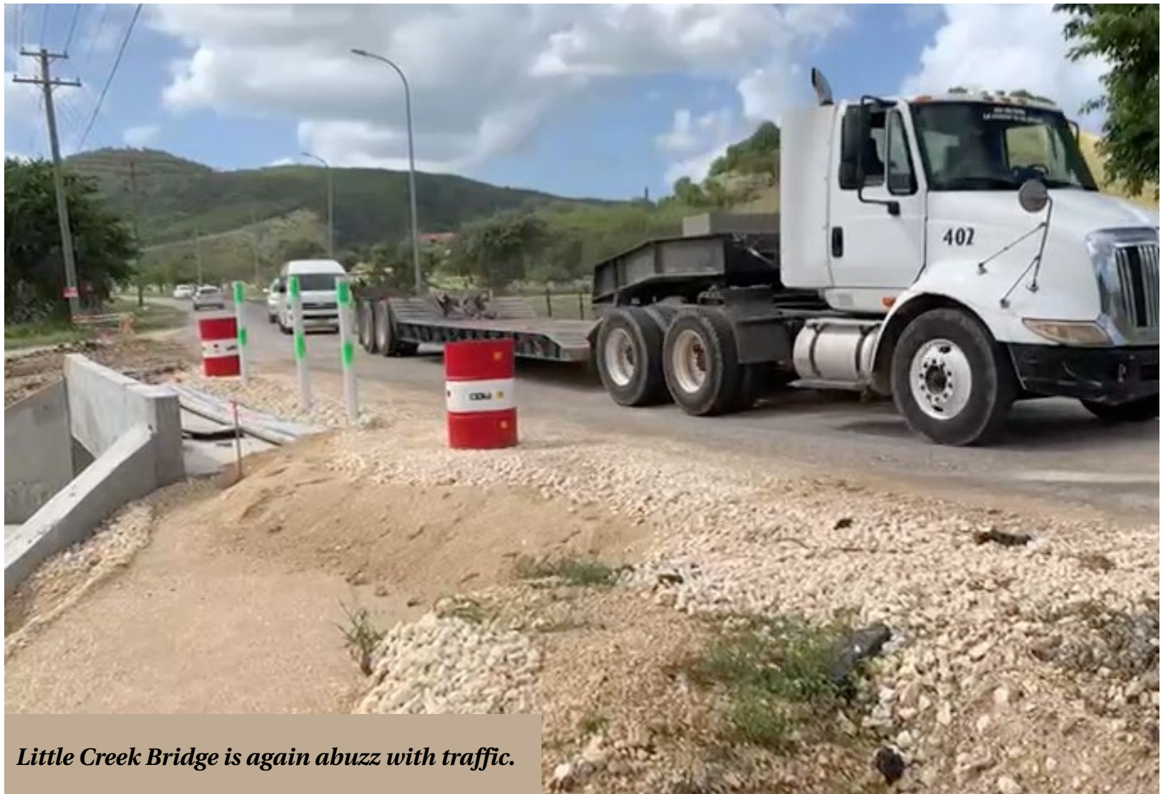
Little Creek Bridge is again abuzz with traffic.

The Works Minister is projecting that, “By the end of 2022 most of our major highways would have been rebuilt from scratch, giving us a brand new system of high quality international roads. Antigua and Barbuda will no longer be satisfied with sub-standard highways.”