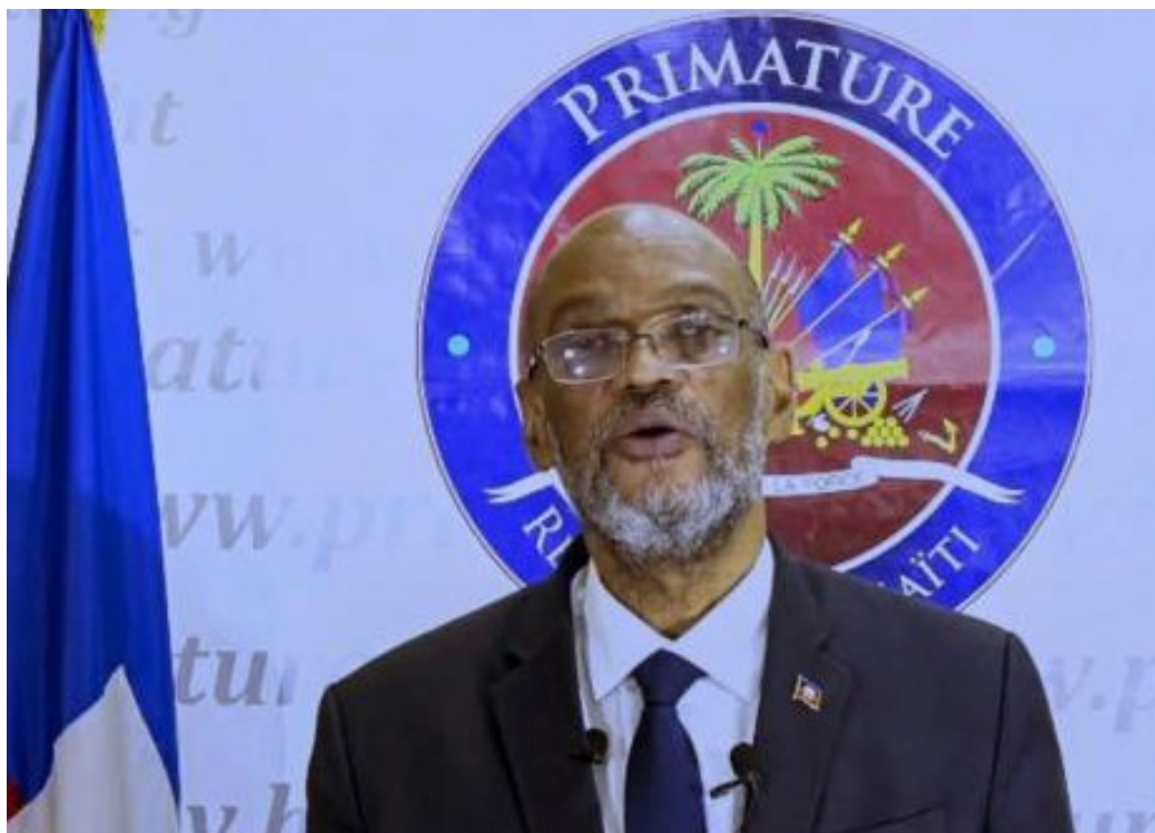
Haiti's Prime Minister, Dr. Ariel Henry

The country of more than 11 million people also has been hit by a