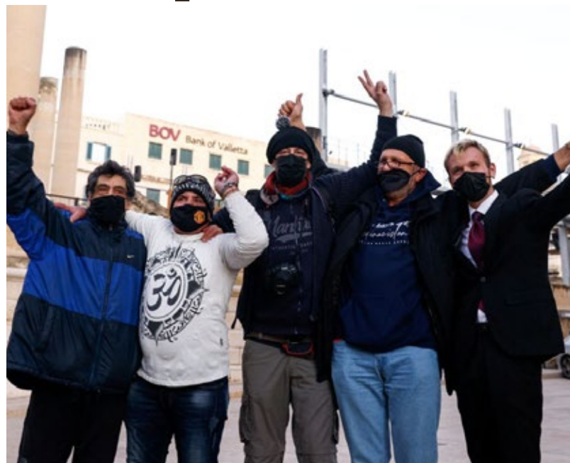
Supporters of the bill to legalise cannabis for personal use celebrate outside Parliament House after the bill was passed, in Valletta, Malta, December 14, 2021.

Bonnici has rejected suggestions that the law will increase drug abuse on the Mediterranean island. “The government is in no way urging adults to resort to cannabis use or promoting a cannabis culture. The government always urges people to make healthier choices,”