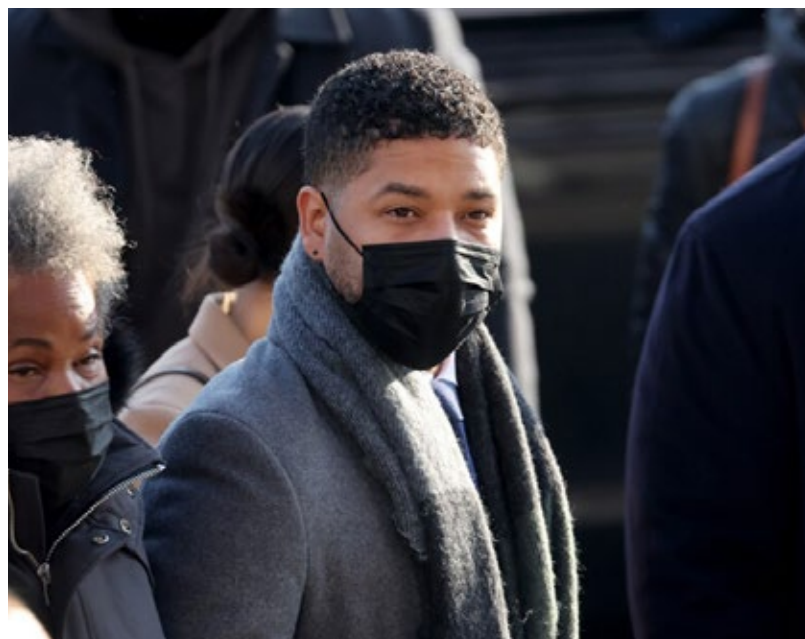
Actor Jussie Smollett, seen arriving Wednesday at the Leighton Criminal Court Building in Chicago.

Washington Post - Jussie Smollett was on Thursday found guilty of staging and falsely reporting to police that he had been the victim of a hate crime in Chicago three years ago.