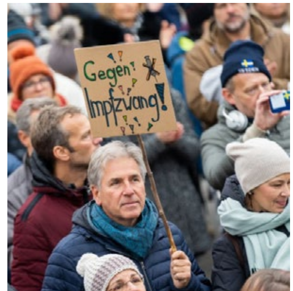
A protester holds a placard reading 'Against Compulsory Vaccination' during a rally in Vienna.

He also said that people who are eligible for exemptions will have to register those in a central vaccination register which will be checked at regular three-month intervals. The first cut-off date will be March 15.