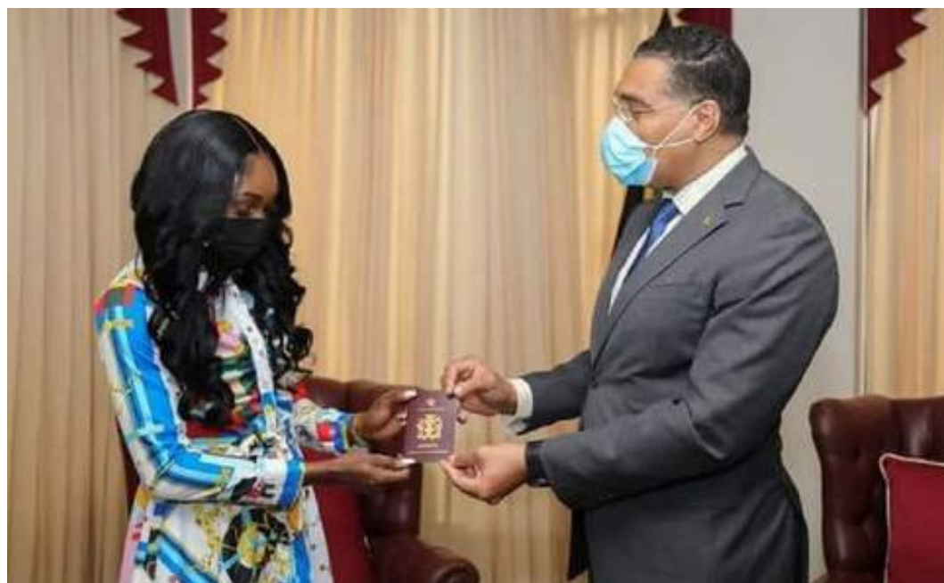
Prime Minister Andrew Holness presents Elaine Thompson-Herah with a diplomatic passport on Tuesday.

Olympic Games sprint double champion Elaine Thompson-Herah on Tuesday was presented with a diplomatic passport from the Government of Jamaica. The presentation of the document was made to the Jamaican sprinter by Prime Minister Andrew Holness during a courtesy call at the Office of the Prime