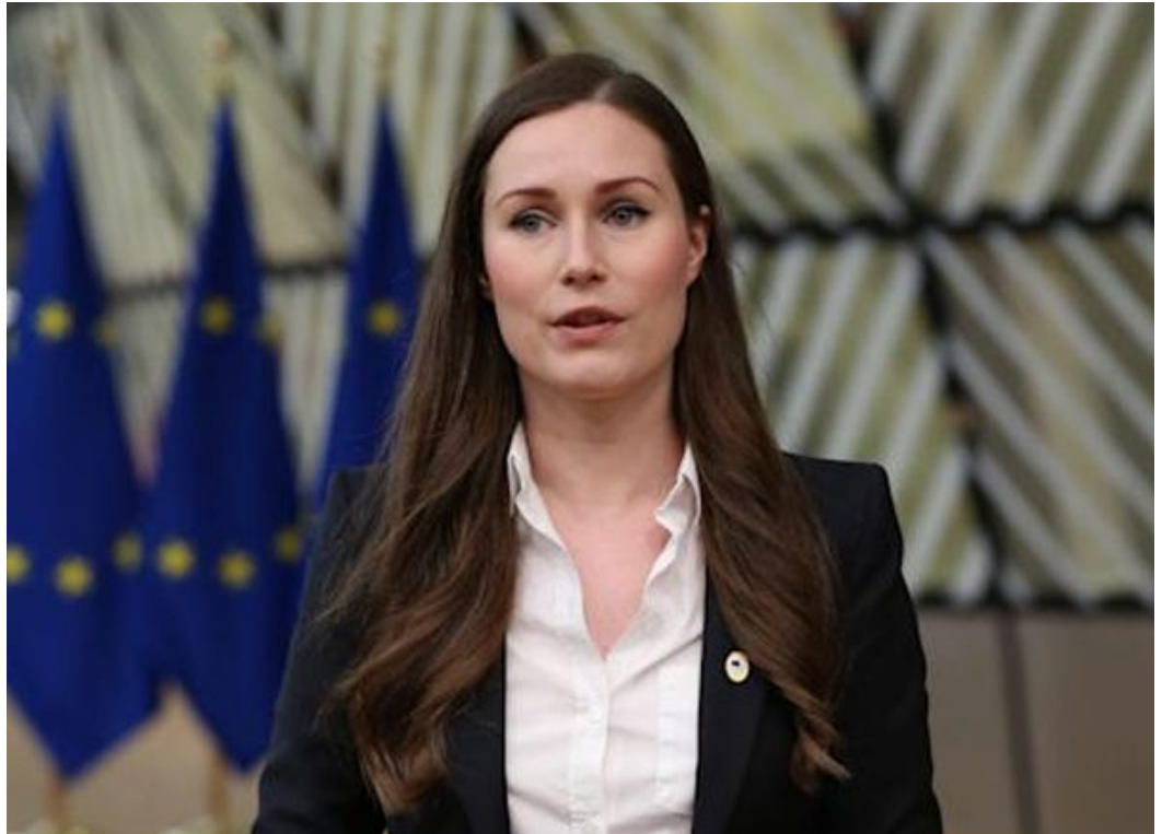
Finnish Prime Minister Sanna Marin.

Economic Affairs Minister Mika Lintila attended a floorball match between Finland and Latvia on Sunday despite being advised to avoid contact with others, Helsingin Sanomat newspaper reported on Wednesday. Defense Minister Antti Kaikkonen went to a dinner party on Saturday while Finance Minister Annika Saarikko and Science & Culture Minister Antti Kurvinen canceled their attendance of the same event to avoid contacts, evening paper Ilta-Sanomat reported on Tuesday.