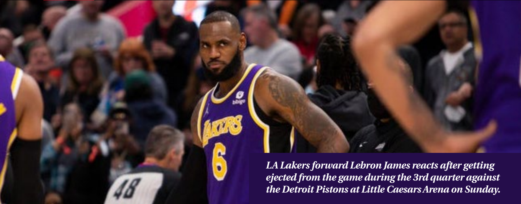
LA Lakers forward LeBron James reacts after getting ejected from the game during the 3rd quarter against the Detroit Pistons at Little Caesars Arena on Sunday.