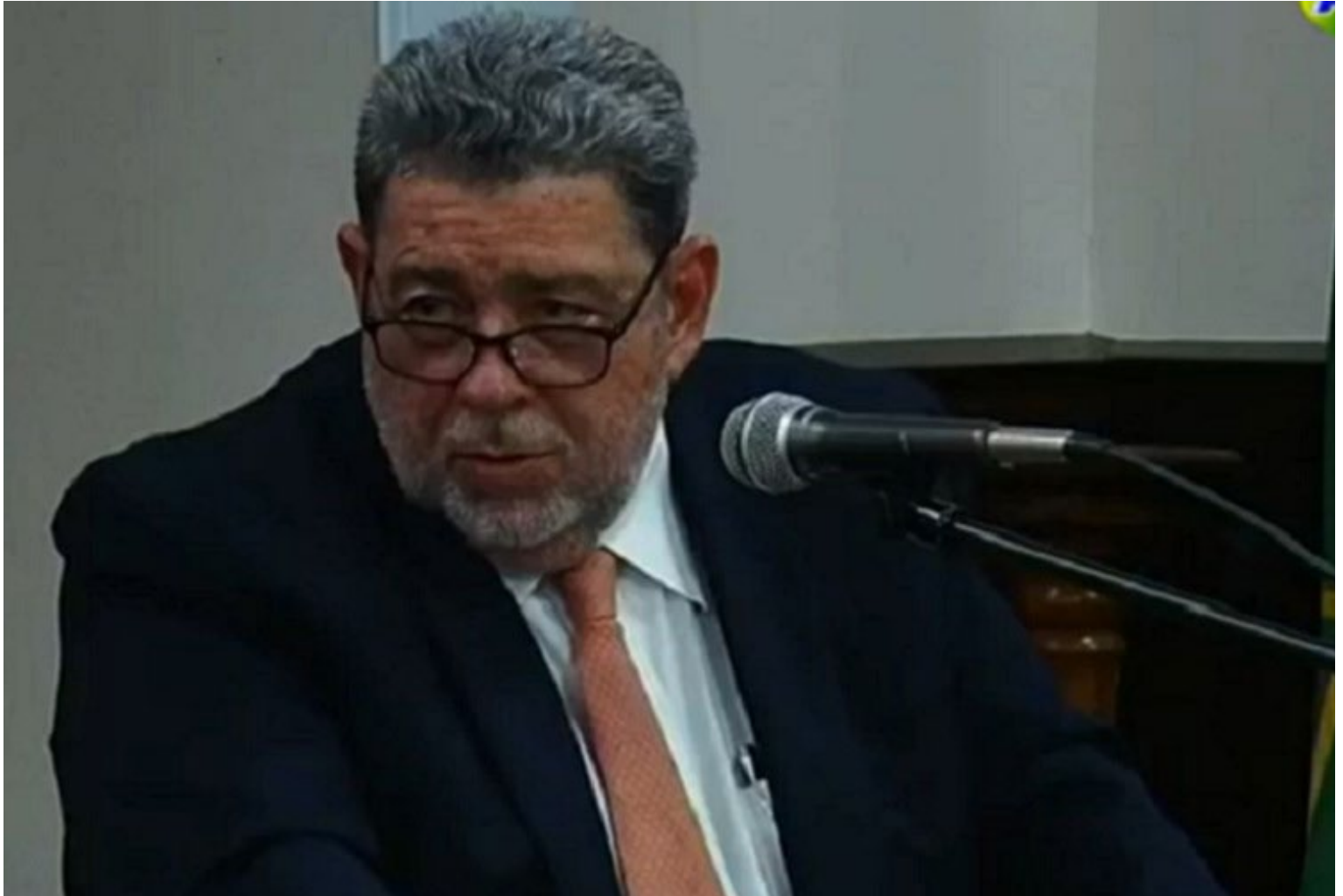
Prime Minister of St. Vincent and the Grenadines, Dr. Ralph Gonsalves.

Loop Caribbean - Prime Minister of St. Vincent and the Grenadines Dr. Ralph Gonsalves had made a final plea for those categories of workers who are required to get vaccinated against COVID-19 to do so, as he does not want to see anybody without a job.