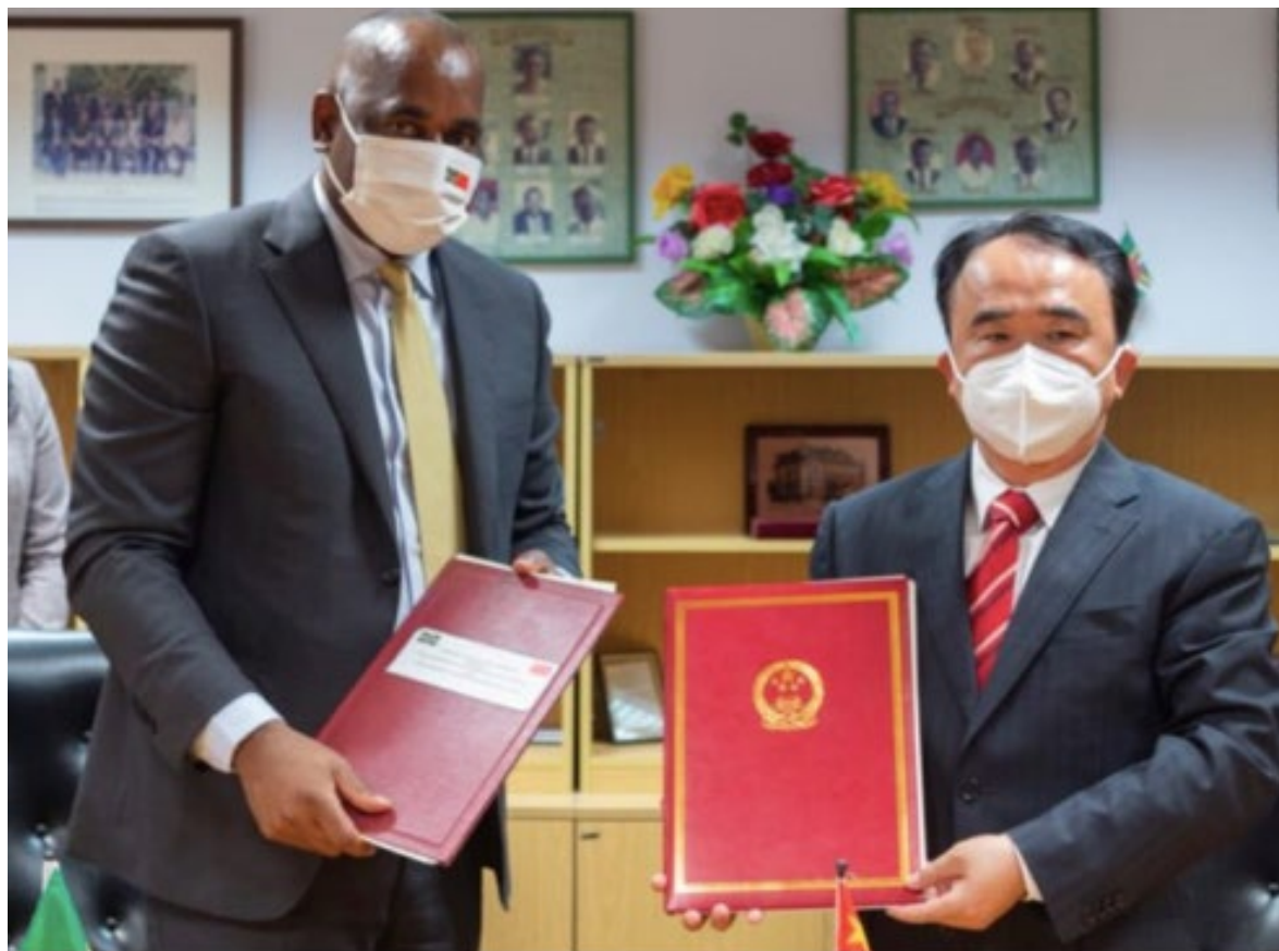
Prime Minister Roosevelt Skerrit and the new Ambassador of the People's Republic of China to the Commonwealth of Dominica, His Excellency Lin Xianjiang.

"The signing of this visa-free agreement between our two countries will now enhance the relationship and will allow our people to