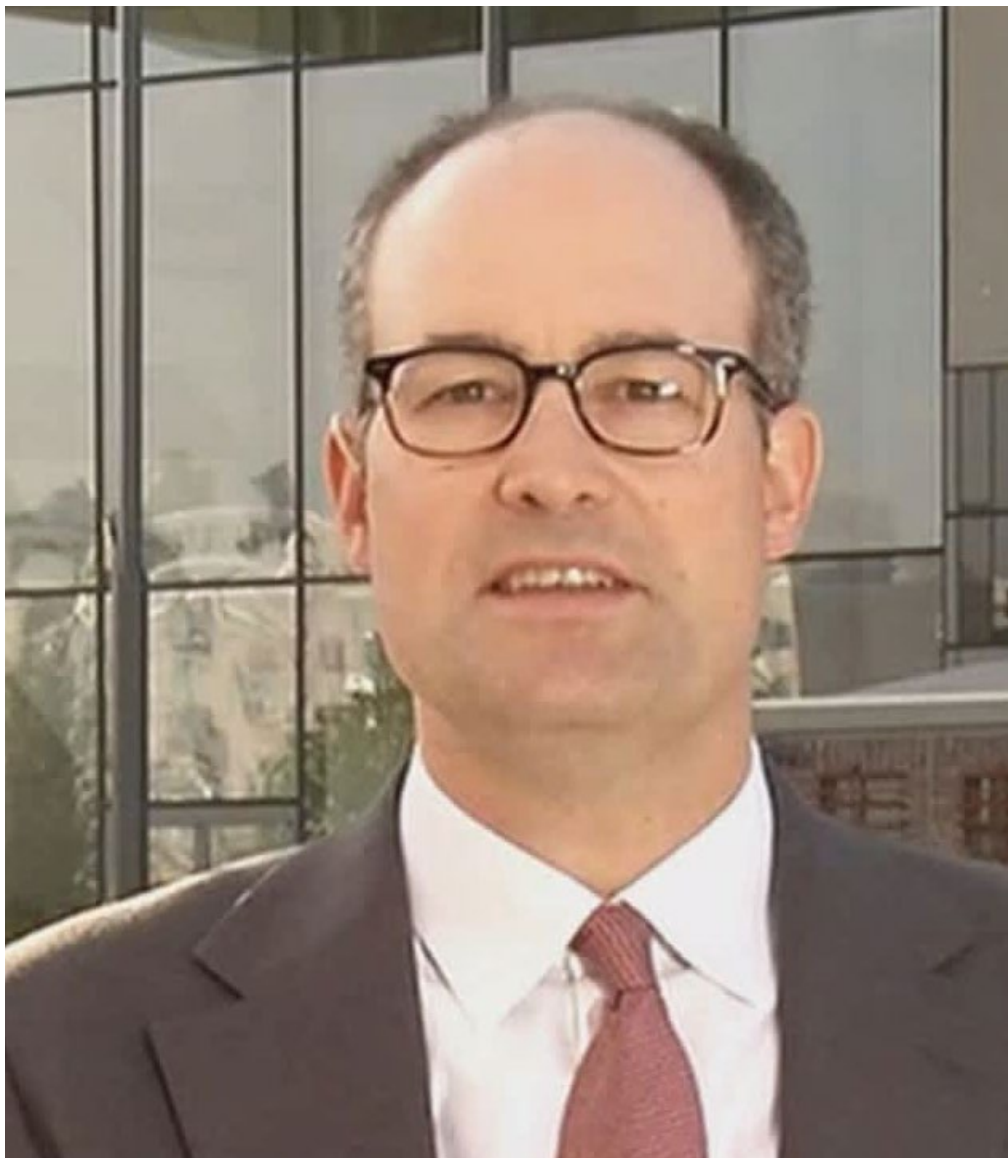
UBS economist Felix Huefner

CNN Business - Almost 2 million workers in Europe's biggest economy are set for a big pay rise.