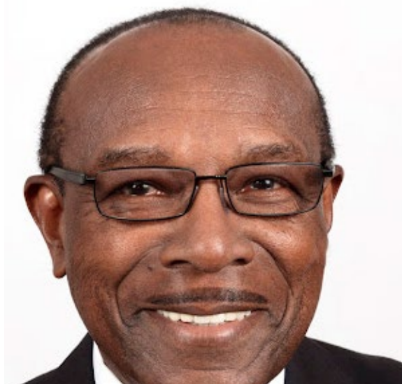
Health & Wellness Minister Sir Molwyn Joseph.

Sir Molwyn assured the public that the ministry's database will allow it to identify those individuals who obtained