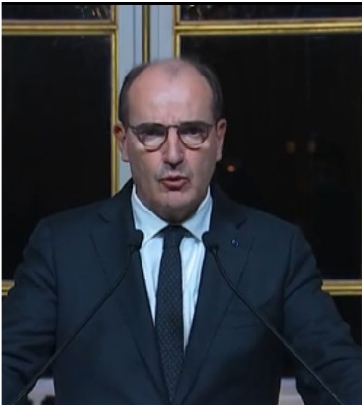
French Prime Minister Jean Castex.

Just about 33 percent of Guadeloupians are vaccinated against COVID-19, compared with 75 percent nation-