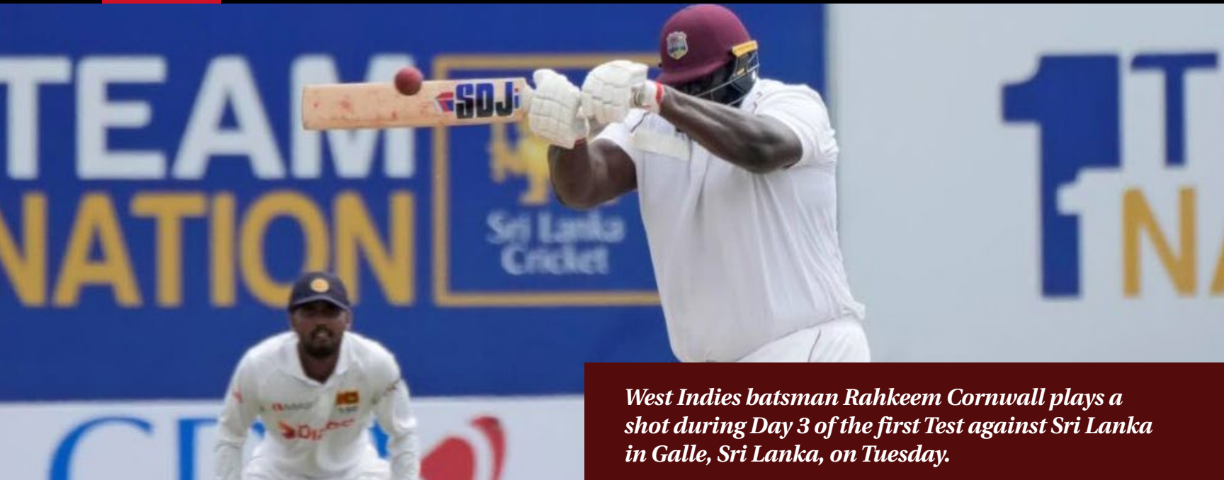
West Indies batsman Rahkeem Cornwall plays a shot during Day 3 of the first Test against Sri Lanka in Galle, Sri Lanka, on Tuesday.