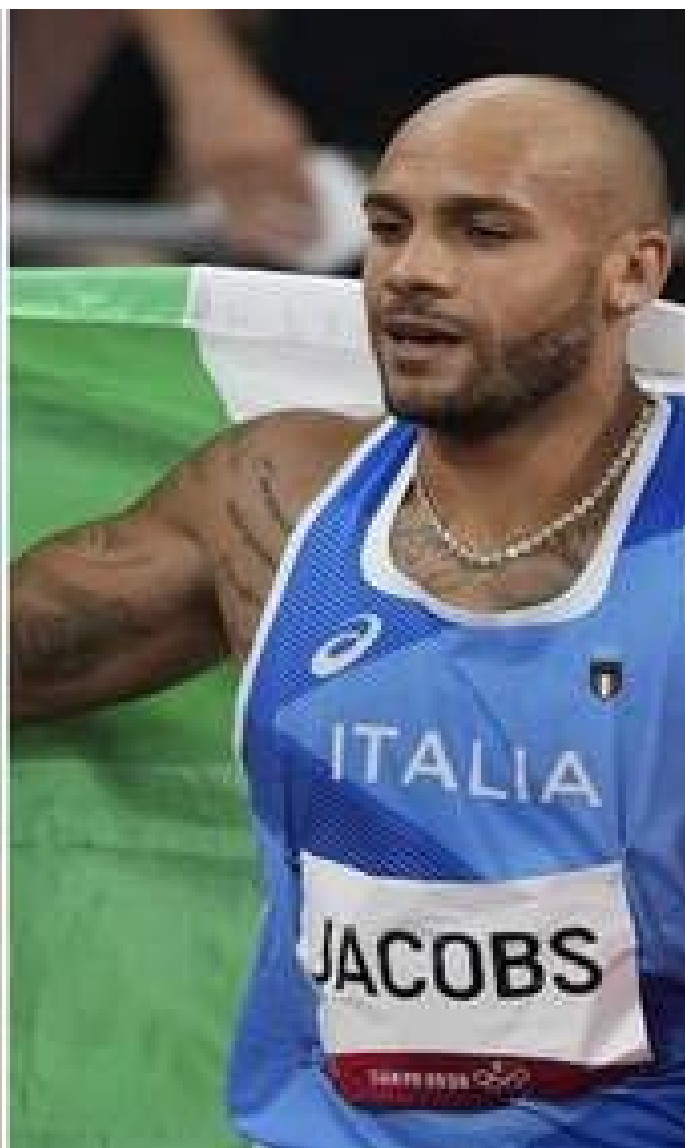
Combination of photos showing Usain Bolt (left) and Lamont Marcell Jacobs.

Italy's Olympic 100m champion Lamont Marcell Jacobs has challenged Usain Bolt to a charity team sprinting contest after the retired Jamaican said he could have won the blue riband race in Tokyo.