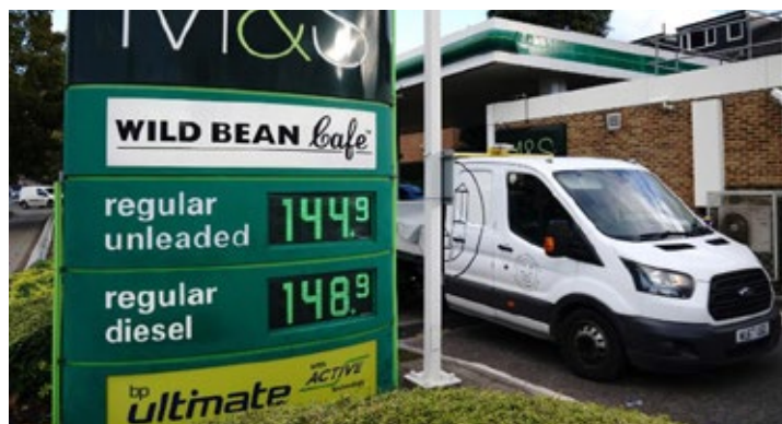
Gasoline prices at filling stations in the United Kingdom hit an all-time high in late October.

"When coupled with yesterday's decent labor market release, the bigger-than-expected