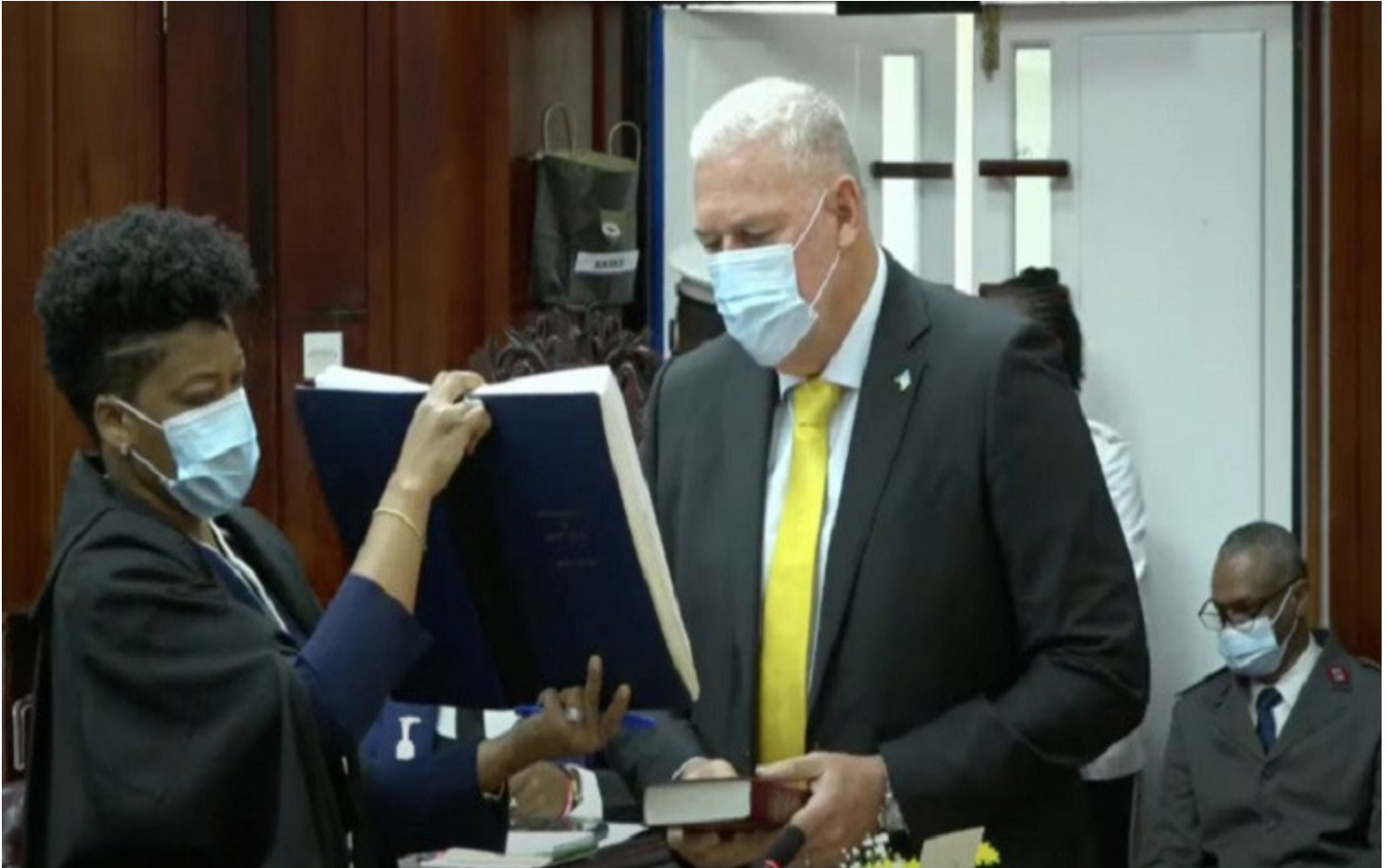
Saint Lucia's Leader of the Opposition, Allen Chastanet.

St. Lucia News Online - Saint Lucia's Leader of the Opposition, Allen Chastanet, was on Tuesday stripped of emoluments for the over 100 days he did not attend the three sessions of the national parliament since the July 26 General Elections.