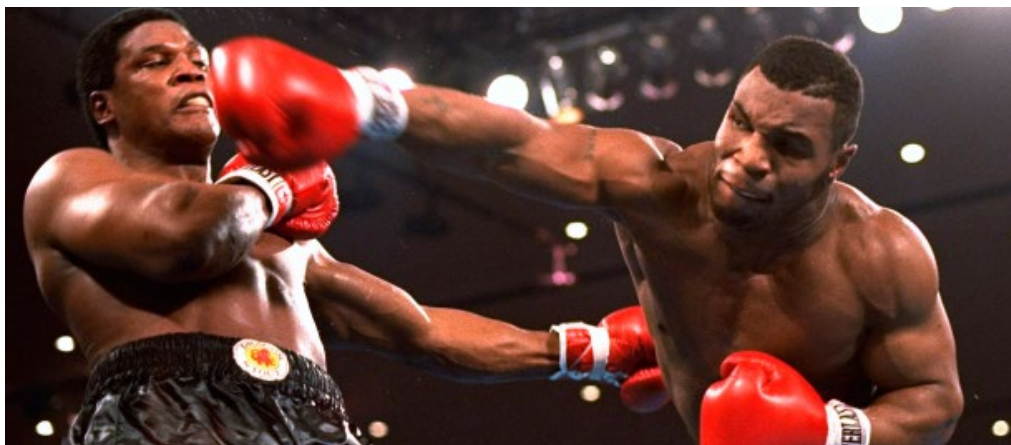
Tyson (left) was feared by all who came across him in the boxing ring.

fought. I was there at ringside seeing these huge men crying, bones shattering or their blood flying everywhere.