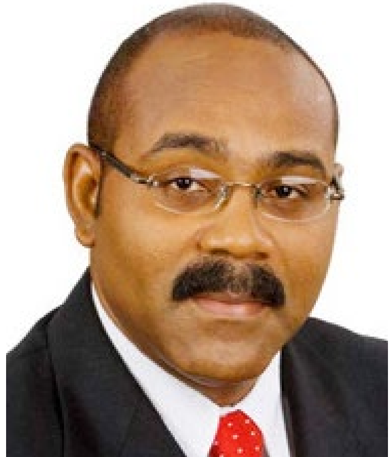
Prime Minister & Minister for Finance, Hon. Gaston Browne.

raising the issue so that in the event of a dip in international petroleum prices (something he expects could happen as early as this week), “This notion that we should be passing on the increase in taxes ... will not arise; because you can’t expect the government will