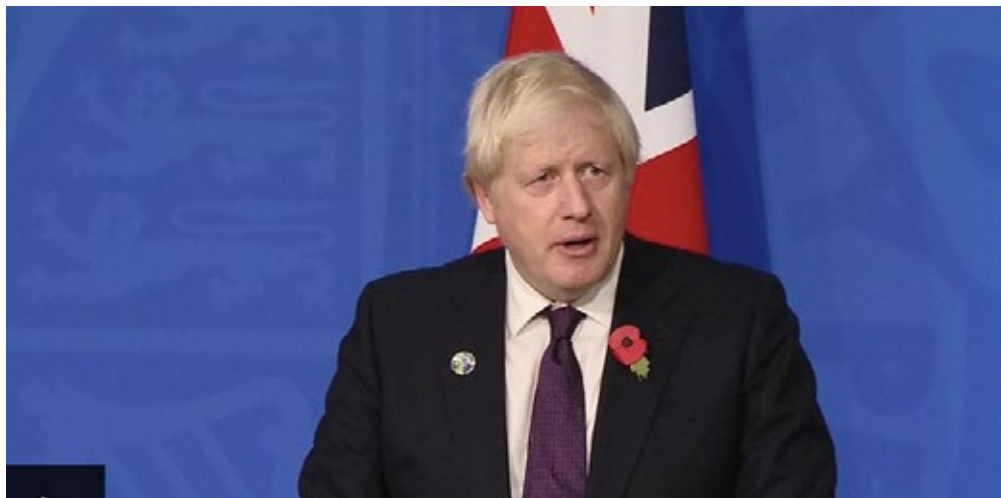
UK Prime Minister Boris Johnson.

But he added the UK could not compel nations to act. “It’s ultimately their decision to make and they must stand by it.”