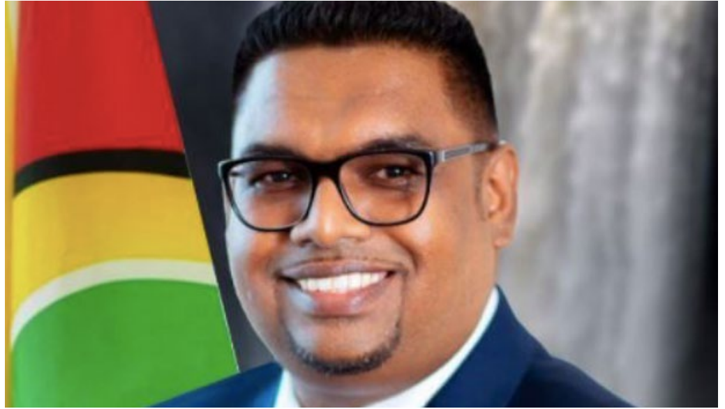
Guyana's President Dr. Mohammed Irfaan Ali.

According to Section 16 (2) of the Firearms Act, if a person is