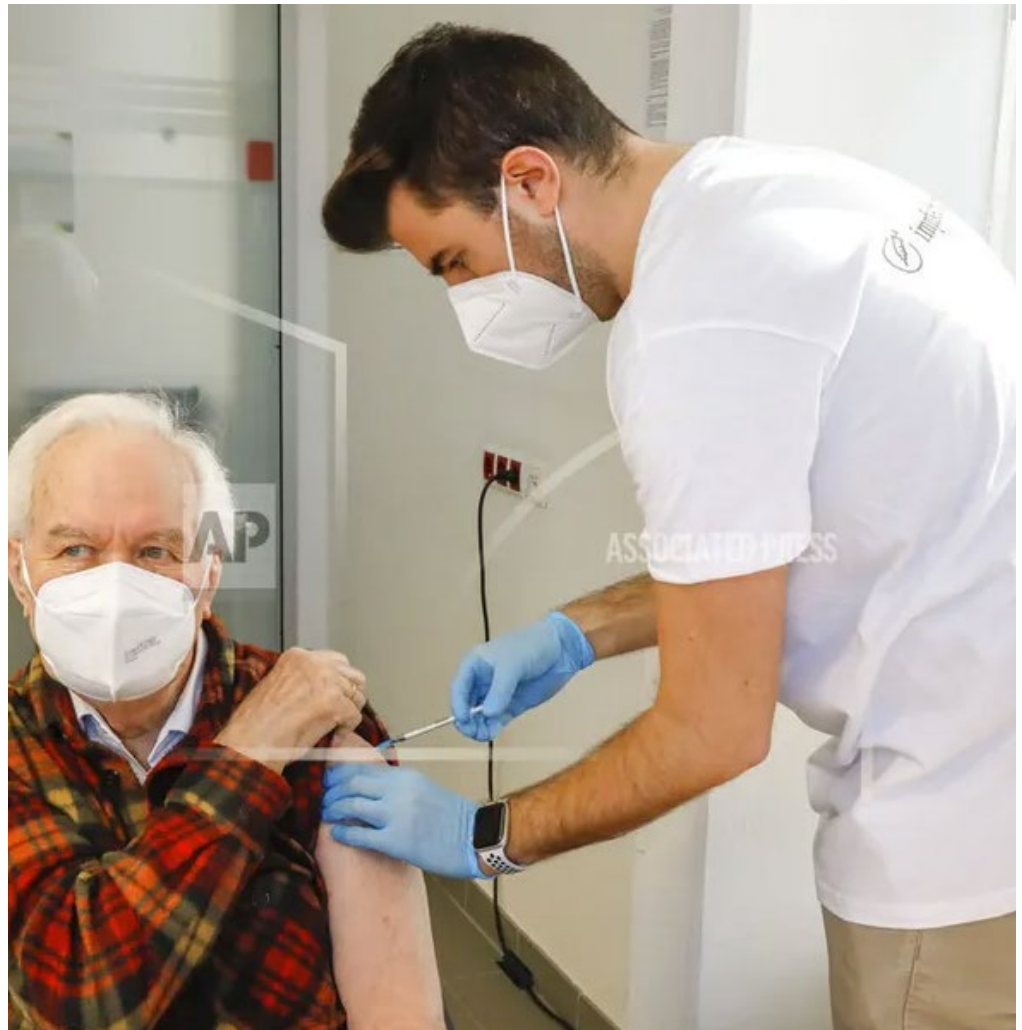
A doctor administers the Pfizer vaccine against COVID-19 to a patient at a vaccination center in Vienna, Austria, April 10, 2021.

Austria has one of the lowest vaccination rates in Western Europe: only around 65% of the total population is fully vaccinated.