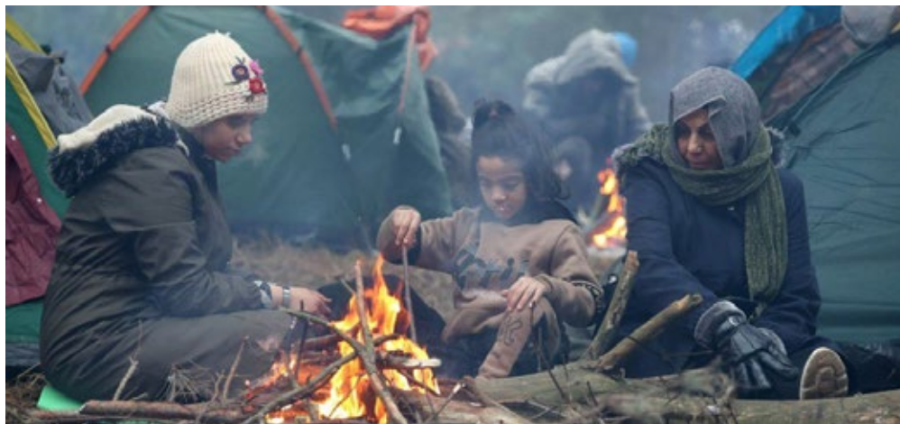
Thousands of people are stranded in freezing conditions at the Belarus-Poland border.

"If the EU pushes Belarus too hard, it may act on this threat,"