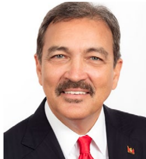
Tourism & Investment Minister Hon. Charles Henry Fernandez

about this partnership with GPH Antigua and the future of Antigua Cruise Port. We believe that this will be the beginning of a new renaissance of increased tourism and economic improvement in the