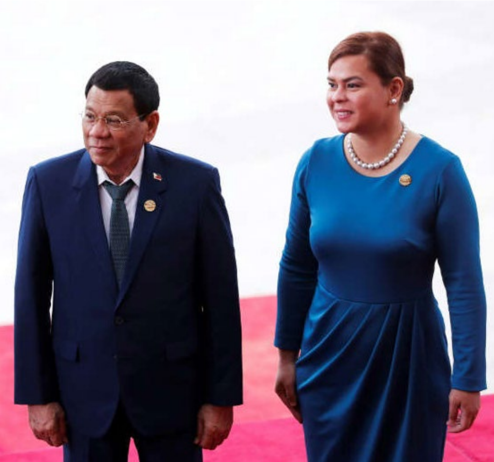
Sara Duterte with father Rodrigo in China in 2018

Philippines "First Daughter" Sara Duterte on Thursday joined a new political party, fuelling speculation she will make a late entry into the presidential race in a bid to succeed her father.