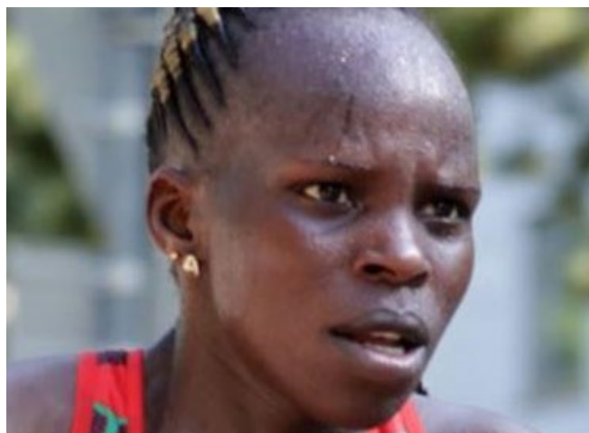
Jepchirchir won the women's marathon at the Olympics in Tokyo earlier this year.