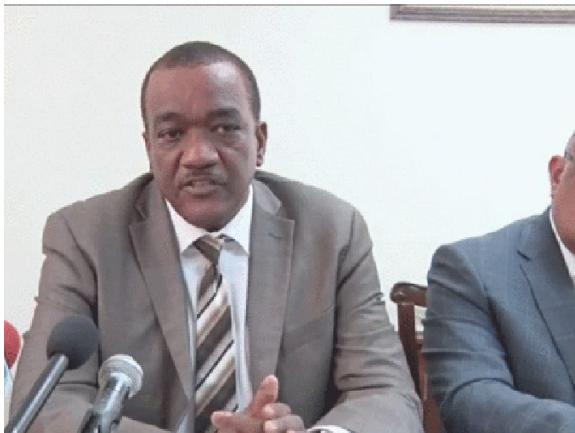
Minister of Health & Wellness, Lieutenant-Colonel Jeffrey Bostic

Bostic explained that the rationale is not so much about directly managing the current COVID-19 surge, but to