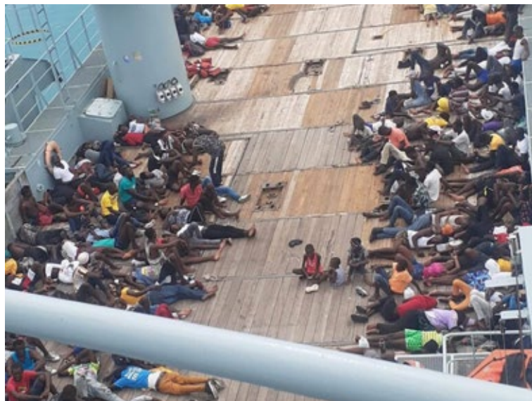
Undocumented Haitian migrants aboard the Royal Bahamas Defence Force (RBDF) HMBS Lawrence Major after being apprehended on Wednesday, September 29, 2021.

EW News - Four United Nations agencies released a joint statement calling on the member states to halt rapid deportations of Haitian migrants without proper assessment of their individual protection needs.