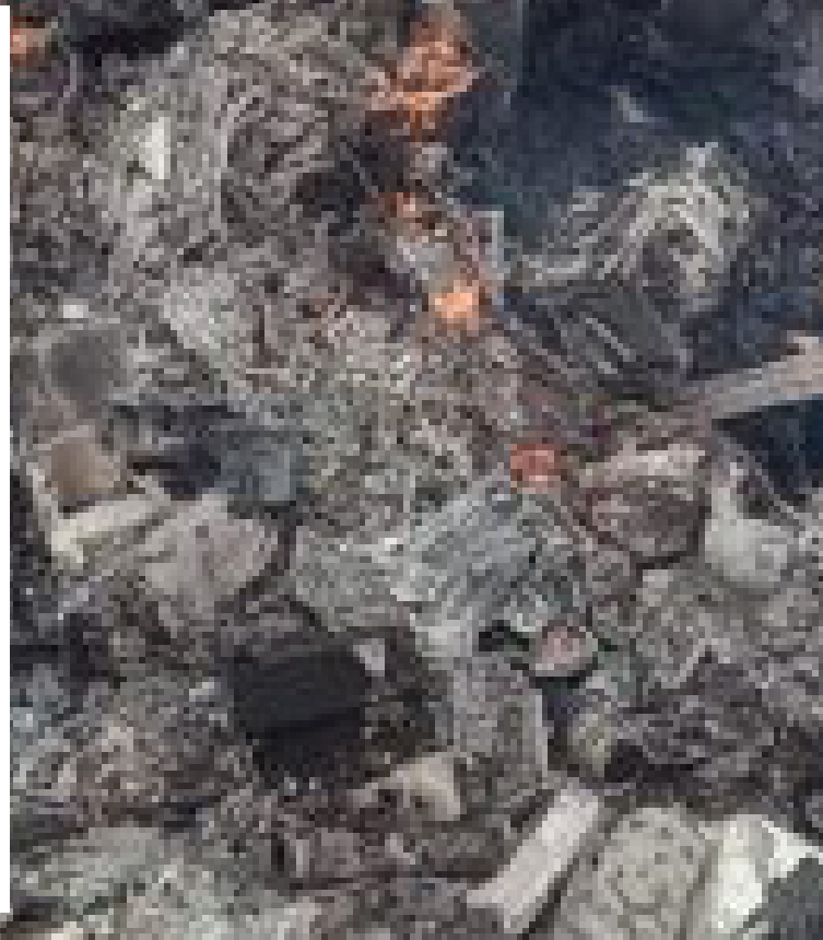
A photo showing the aftermath of a plane crash on Abaco on Monday, July 5, 2021

According to initial reports from the Aircraft Accident Investigation Authority (AAIA), those challenges contributed to the accident.