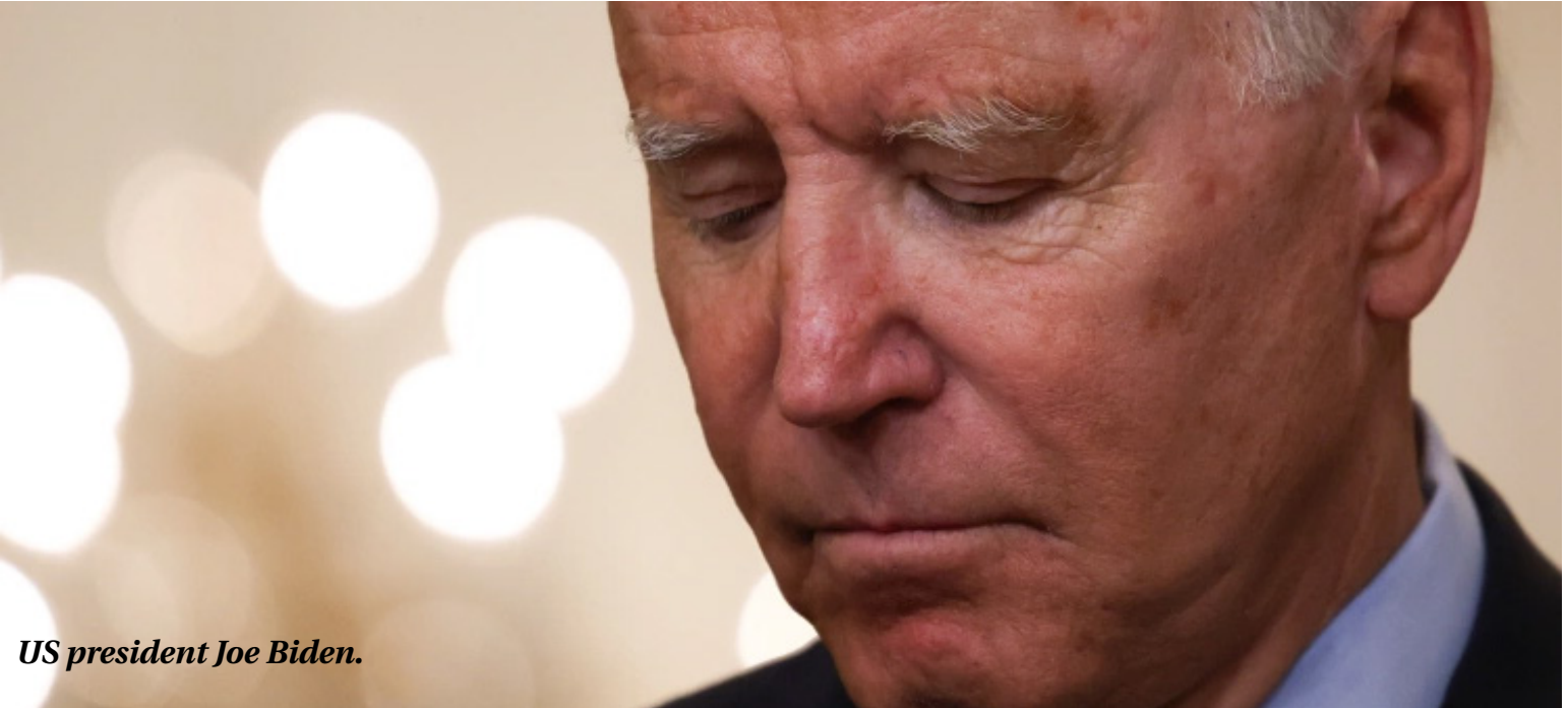
US president Joe Biden.

Aljazeera - United States President Joe Biden said on Thursday that the US military would complete its withdrawal from Afghanistan by August 31, ahead of schedule, and dismissed mounting concerns about a civil war developing in the country occupied by the US since 2001. "The mission is accomplished in that we got Osama bin Laden and that terrorism is not emanating from that part of the world," Biden insisted, defending his decision to keep up the rapid US withdrawal in the face of widening Taliban attacks on Afghan forces.