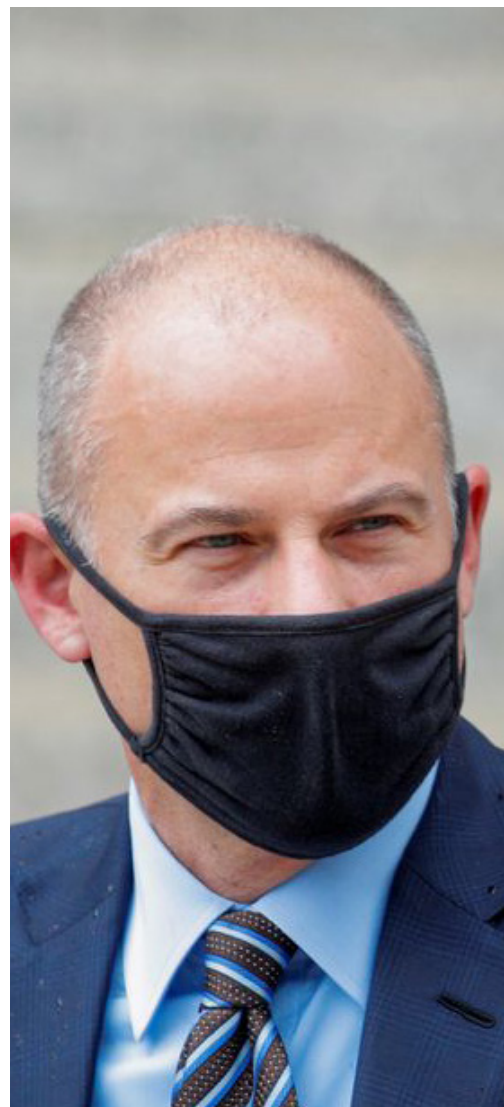
Attorney Michael Avenatti exits the courthouse following his sentencing for an extortion scheme against Nike Inc.

Avenatti has pleaded not guilty to all charges.