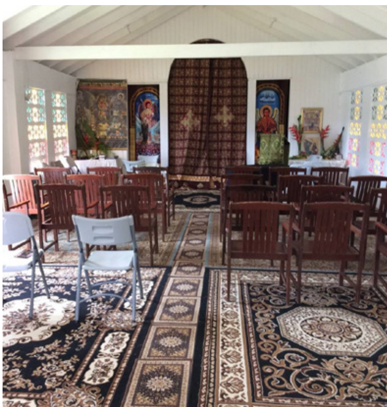
Inside the Ethiopian Orthodox Church in Bendals.

St. Mary of Zion Ethiopian Orthodox Tewahedo Church of Antigua, located in Bendals, on June 27th 2021, was blessed with the entry and installation of the Holy Talbot, a replica of the Ark of the Covenant Ten Commandments from Ethiopia.