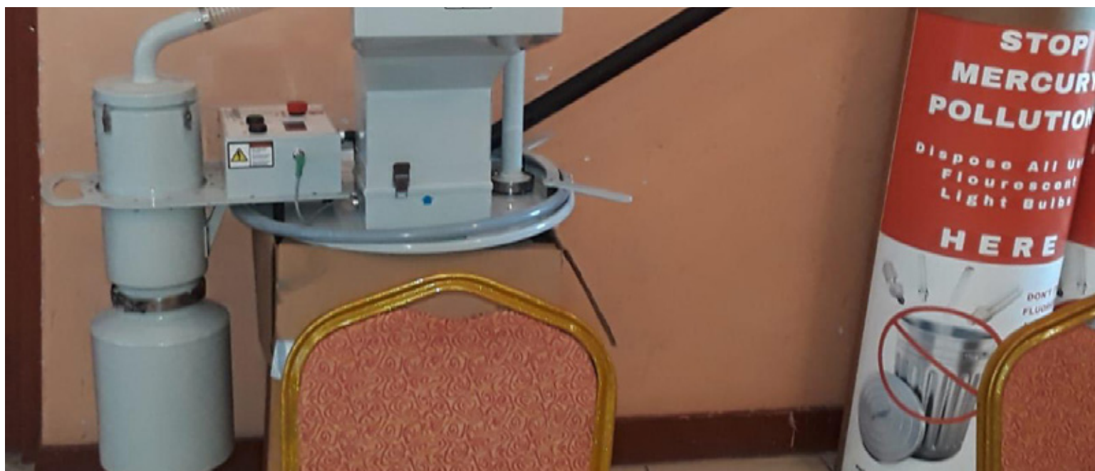
Mercury bulb “eating” machine and specialized disposal receptacle.

The ongoing campaign to phase out mercury and eliminate its threat to human life and the environment in Antigua and Barbuda received a major boost on Tuesday, July 6th 2021. The National Solid Waste Management Authority (NSWMA), supported by stakeholders and several partners, held its official handing over ceremony of specialised bins designed for the safe disposal of used and intact fluorescent light bulbs.