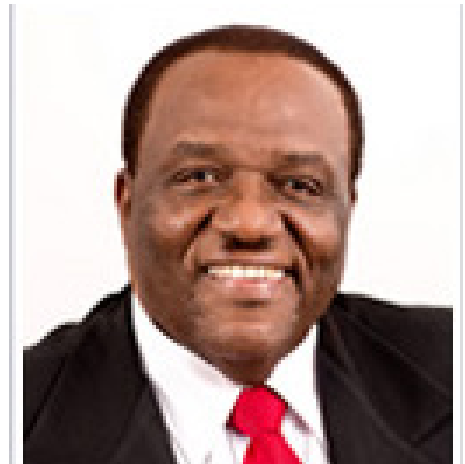
Minister for National Security, Hon. Steadroy Benjamin.

The measures will also extend to increased police presence at the nation's beaches. These officers will wear regular street clothes and thus be working under cover.