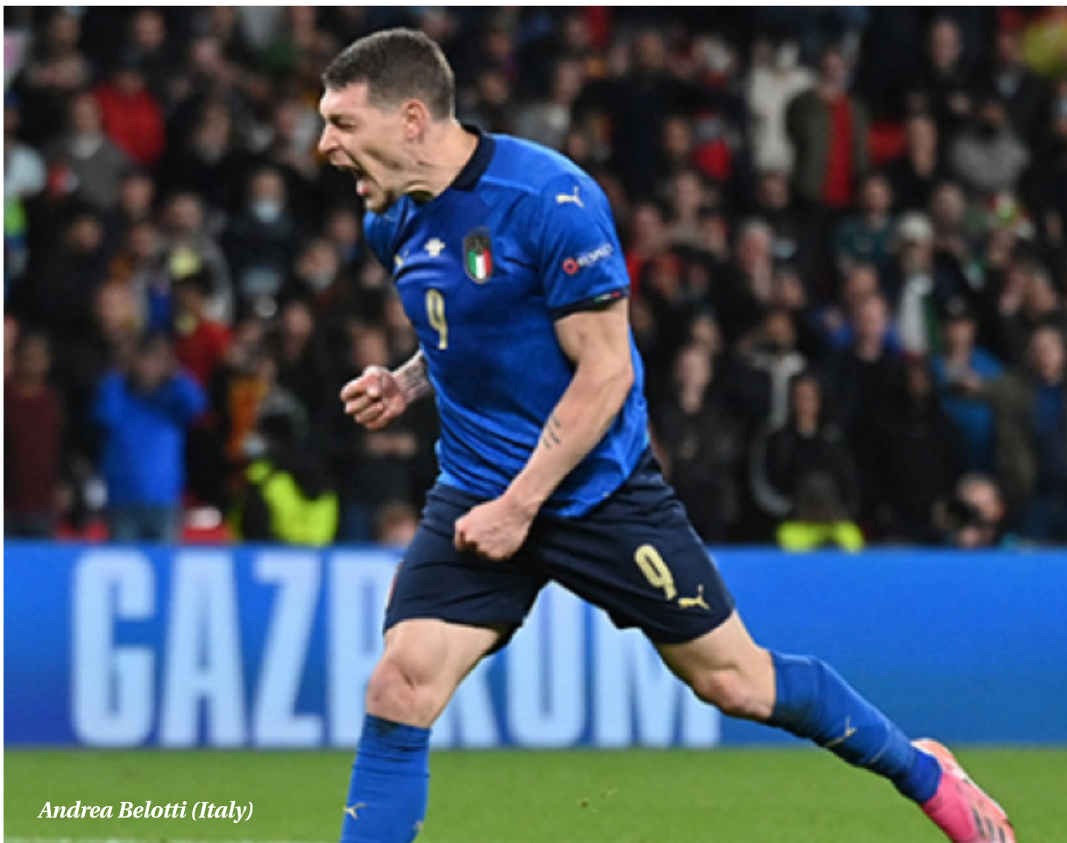
Andrea Belotti (Italy)

WEMBLEY — Italy are through to the final of Euro 2020 after defeating archrivals, Spain 4-2 on penalty kicks. The teams ended the contest tied at 1-1 after regulation and extra time.