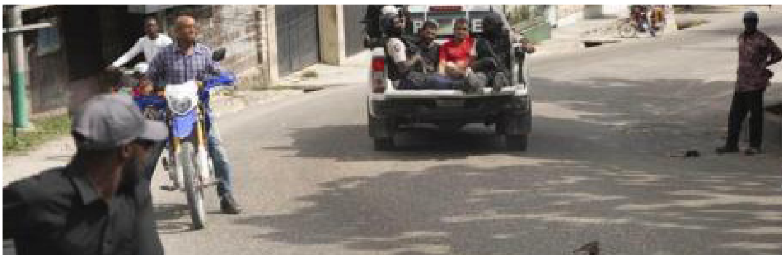
A police truck takes two detainees to the police station of Petion Ville in Port-au-Prince, Haiti, Thursday, July 8, 2021.

They said only that the attack condemned by Haiti's main opposition parties and the international community was carried out by "a highly trained and heavily armed group."