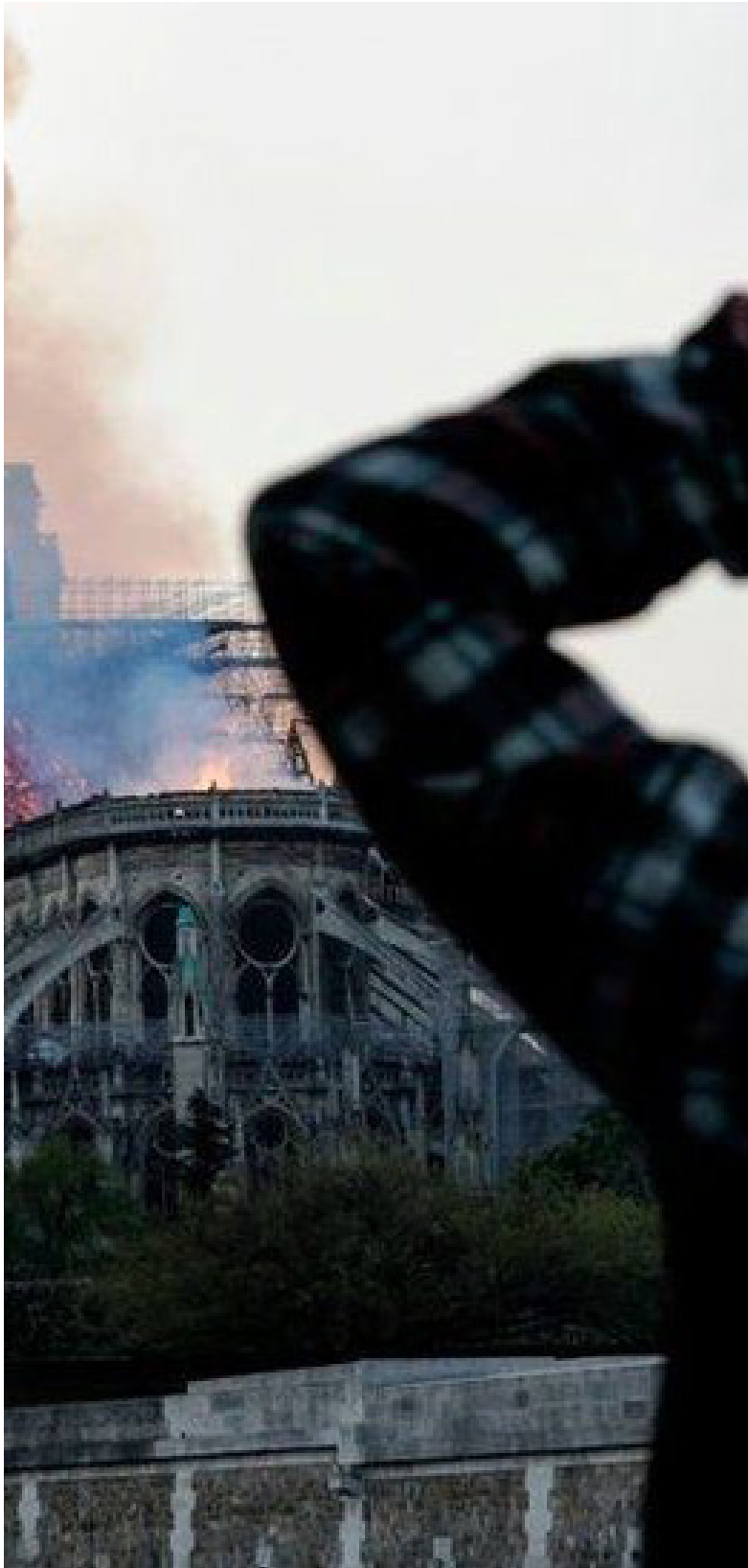
An estimated 400 tonnes of lead were burnt in the cathedral's roof during the blaze.

BBC - Parisian authorities are facing legal action over the health threat from toxic lead particles released during the fire at the Notre-Dame Cathed-