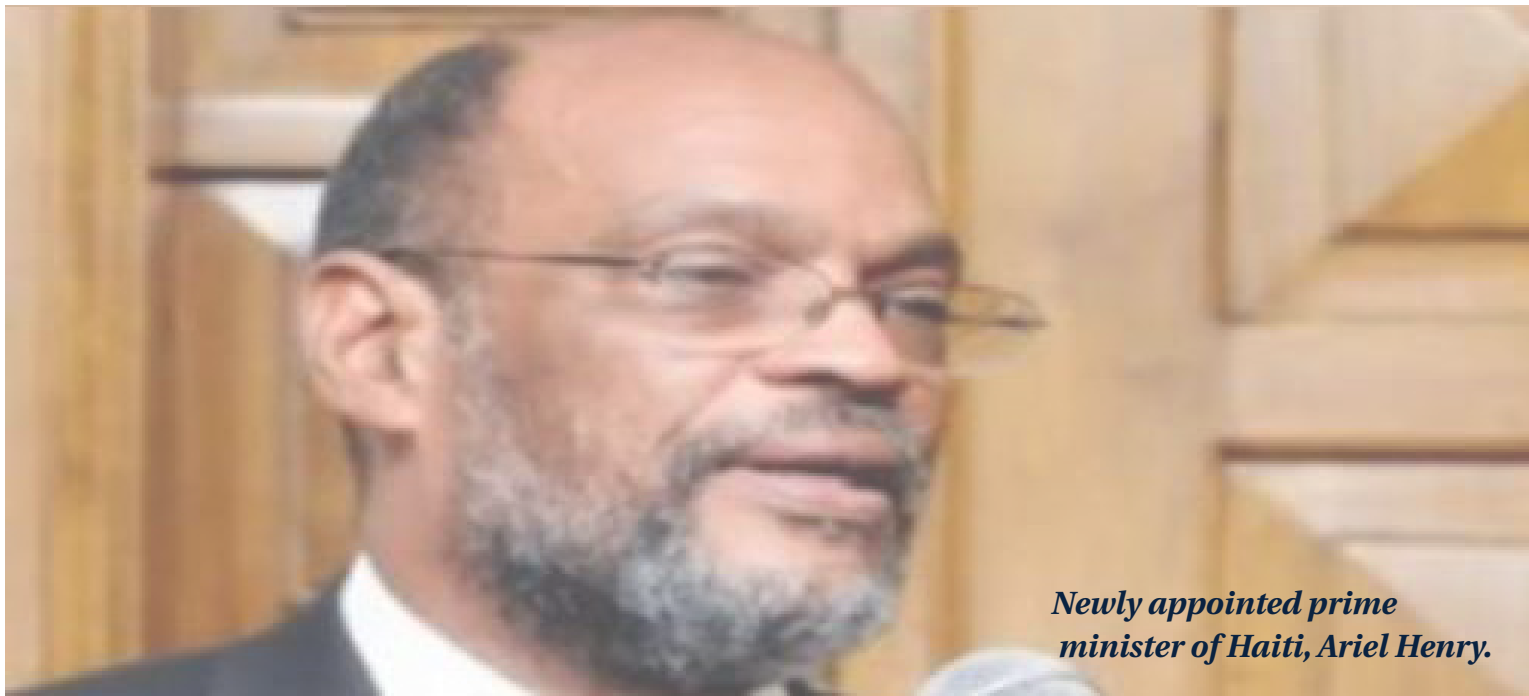
Newly appointed prime minister of Haiti, Ariel Henry.