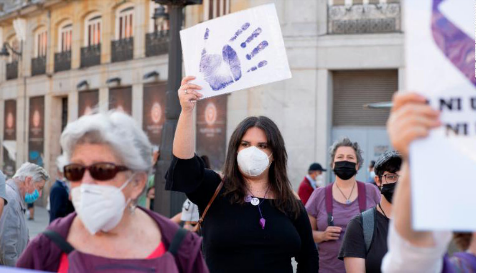
Women in Madrid protest against sexual violence on May 25, 2021.

CNN - The Spanish government approved a law on Tuesday to define all non-consensual sex as rape, part of a legislative overhaul that toughens penalties for sexual harassment and mandates more support systems for victims.