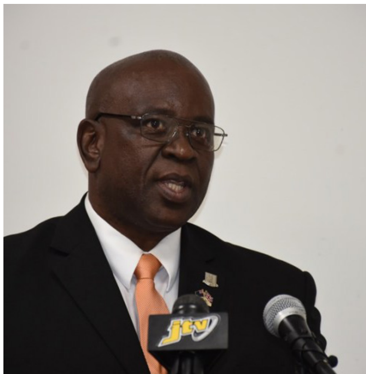
BVI minister of health and social development, Carvin Malone.

He said Cabinet then convened an emergency meeting to consider measures to address the upsurge. According to the Health Minister, vis-