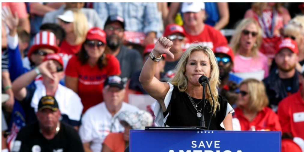
US Republican politician Marjorie Taylor Greene is dismissing the threat of the Delta variant of COVID-19. She led chants of 'Fire Fauci' at a Trump rally on June 26.

"If you look at the number of deaths, about 99.2 percent of them