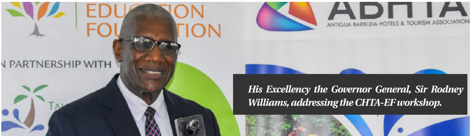
His Excellency the Governor General, Sir Rodney Williams, addressing the CHTA-EF workshop.