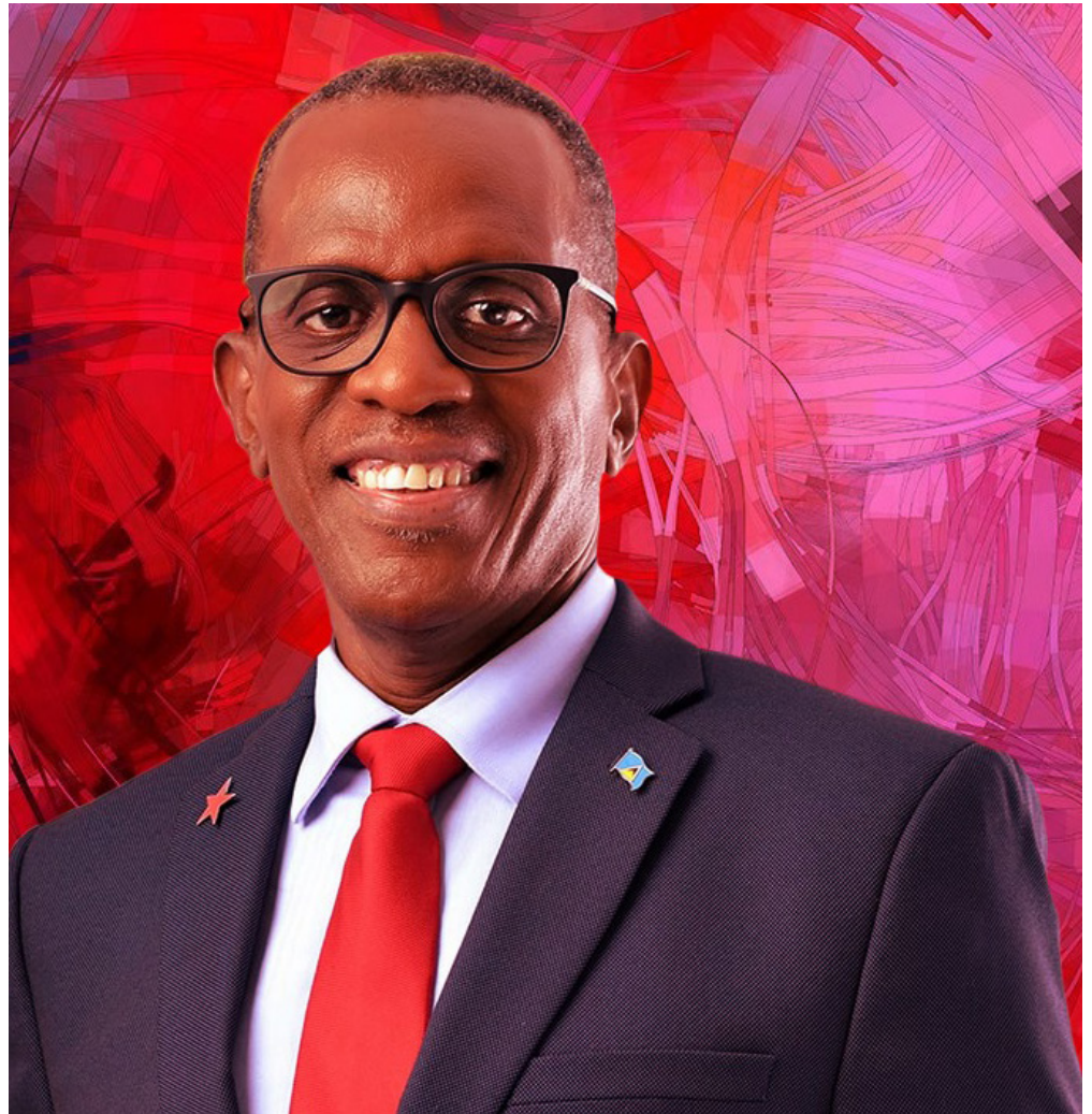
Prime Minister-elect, Phillip J. Pierre

Among the casualties are Gale T.C. Rigobert, the minister for education, innovation, gender relations and sustainable development; Sarah Flood-Beaubrun, the minister with responsibility for external affairs; Guy Joseph, the minister for economic development, housing,