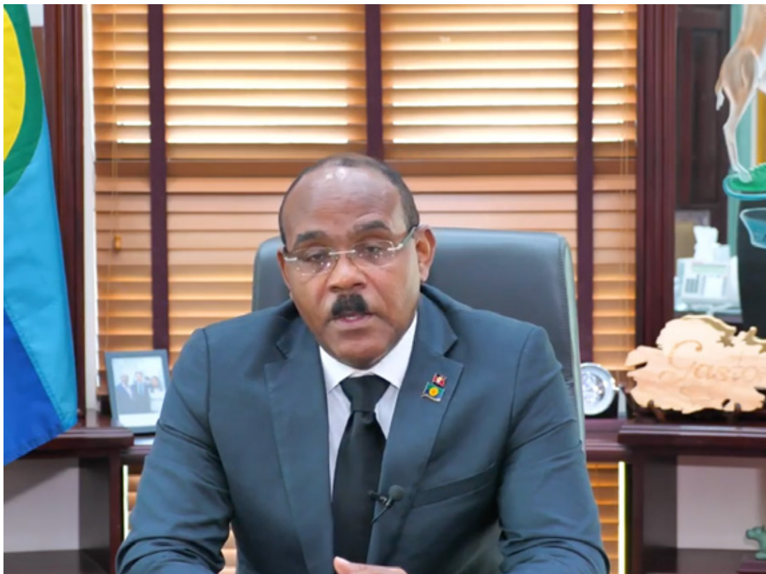
Prime Minister of Antigua and Barbuda and Chairman of CARICOM, Hon. Gaston Browne.

congratulations, and please accept the assurances of my highest consideration,” Prime Minister Browne ended. Philip J. Pierre is expected to be sworn in today, Wednesday 28th July. Pierre will serve as the country’s ninth (9th) Prime Minister after his party won a landslide victory on Monday, securing 13 out of 17 parliamentary seats, defeating outgoing prime minister Allen Chastanet’s United Workers Party.