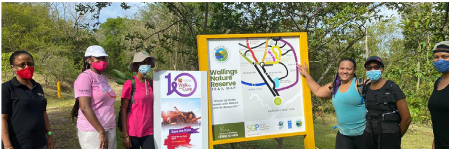
Hikers at the Wallings Nature Reserve.