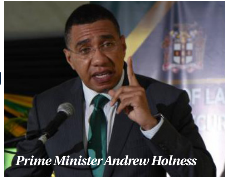
Prime Minister Andrew Holness

Vaccinated tutors to get preferential treatment