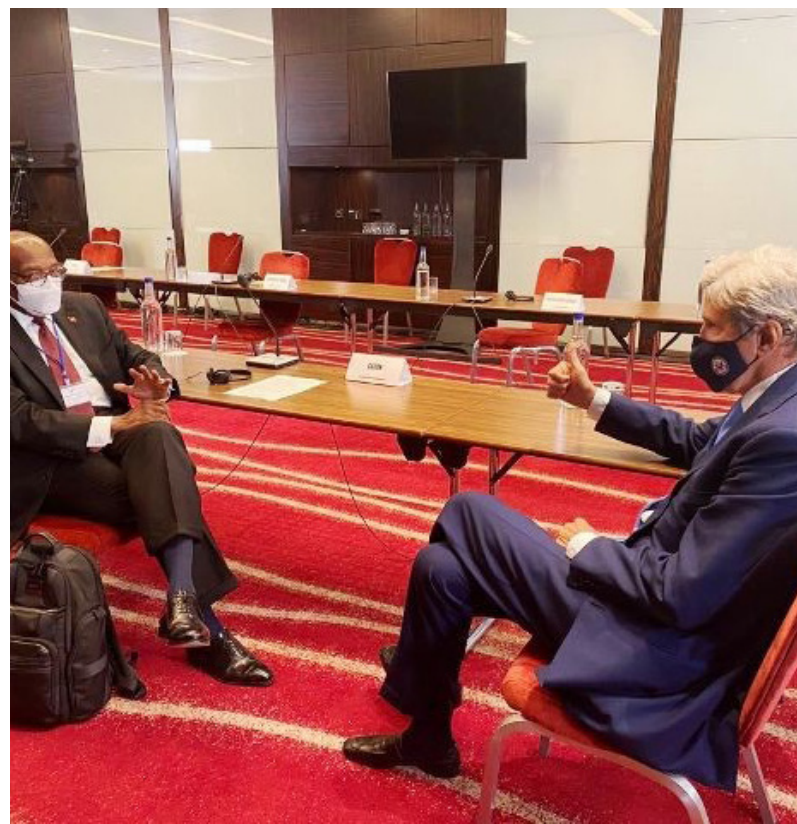
Environment Minister Sir Molwyn Joseph (left) meets with US climate envoy John Kerry.

He continued: “Based on the forecast and trajectory from the best available science, we must achieve drastic emission reductions between now and 2030 to keep 1.5 alive. And, as AOSIS Chair, I am committed to holding all countries accountable to this target. Moreover, major emitters, especially the G20, need to redirect all fossil fuel subsidies into renewable energy investments. Realistically, this is going to require that we continue to press for declared commitments by the major