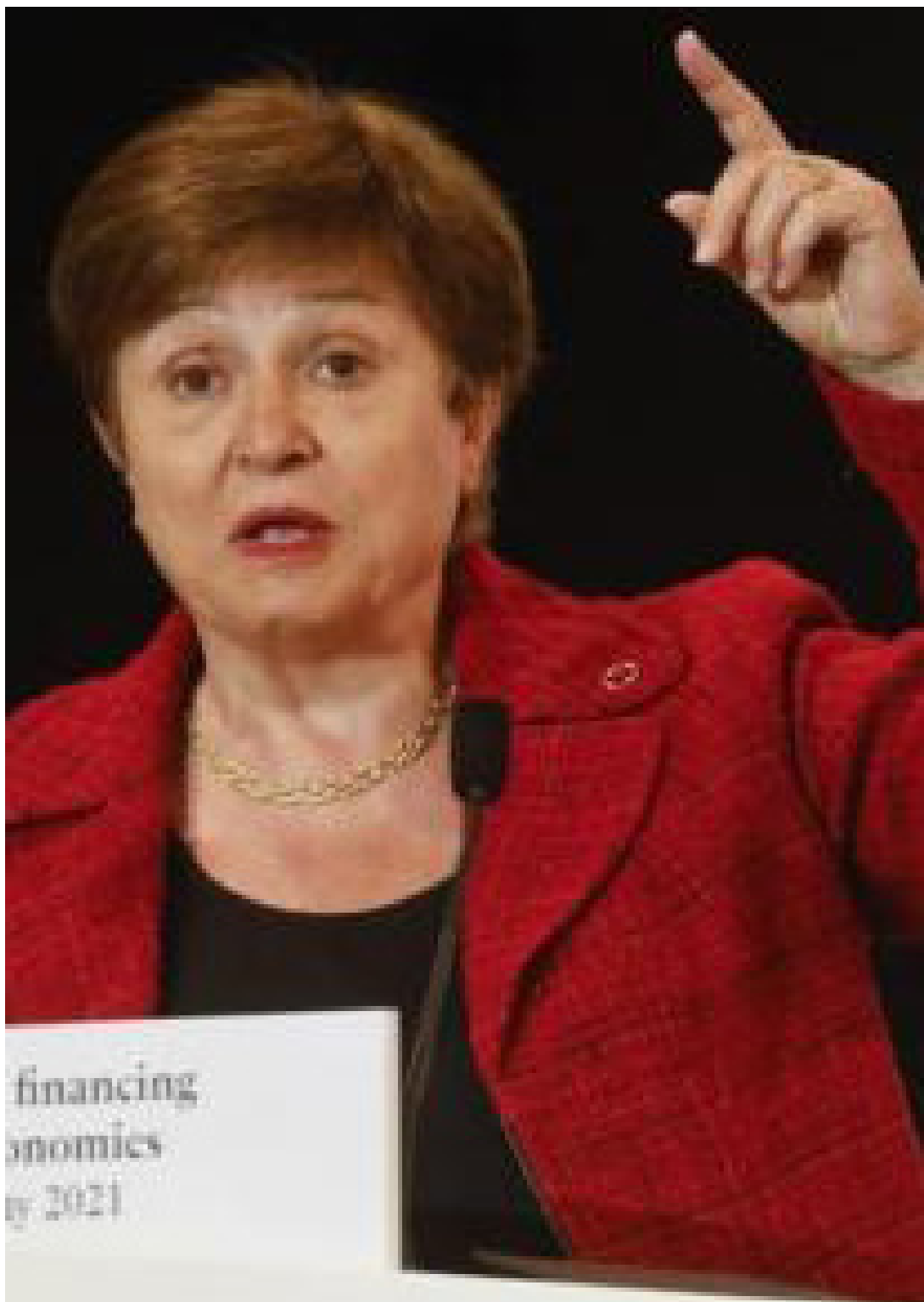
In this 18 May 2021 file photo, IMF Managing Director Kristalina Georgieva speaks at the end of the ‘Financing of African Economies’ summit in Paris.

A brighter outlook for Latin America was offset by lower forecasts for emerging and developing Asian economies.