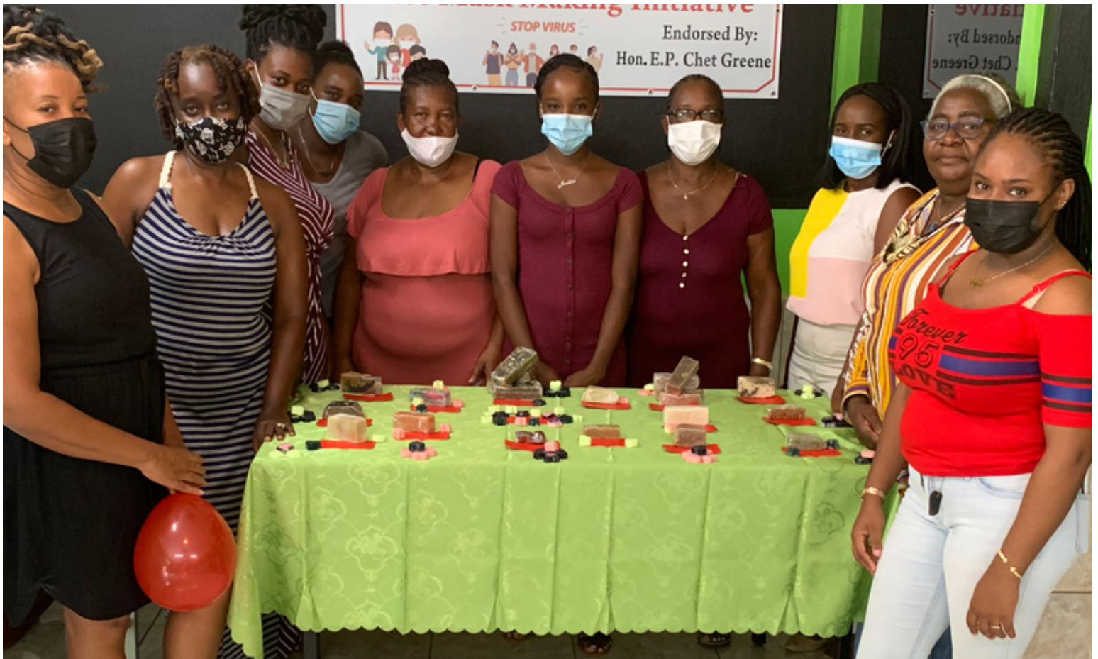
Soap-making course participants and facilitators.