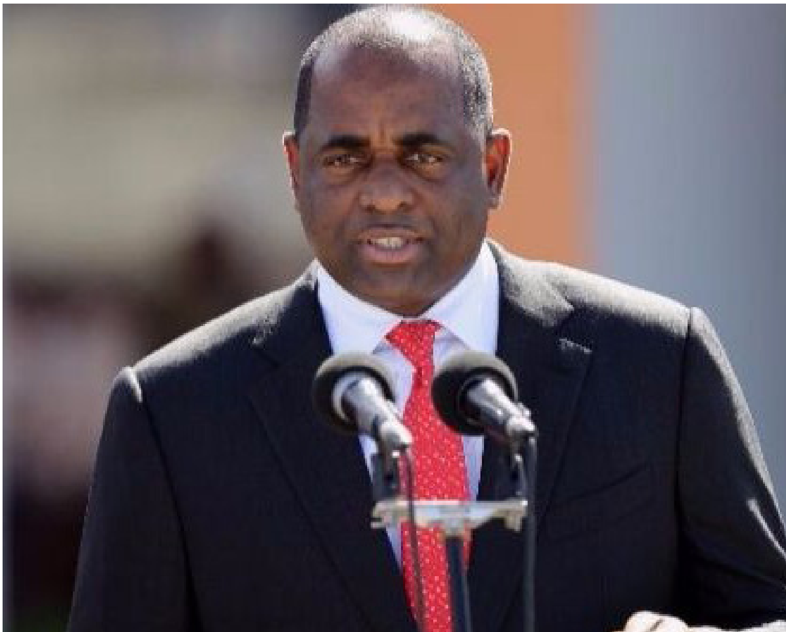
Dominica's Prime Minister, Roosevelt Skerrit

Dominica News Online - Prime Minister Roosevelt Skerrit has told Dominicans that they should secure their livelihood by applying for health insurance.