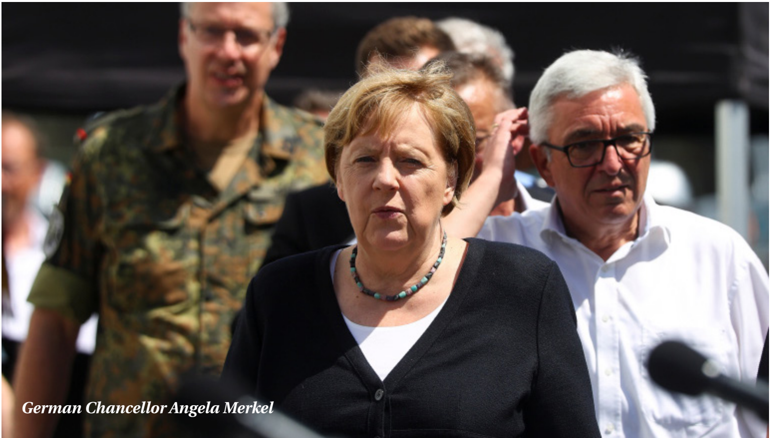
German Chancellor Angela Merkel

Al Jazeera - German Chancellor Angela Merkel has described the flooding that ravaged parts of her country as "surreal" and "terrifying", as the death toll from floods in Western Europe climbed above 180 with dozens still missing. Merkel promised on Sunday swift financial aid after visiting one of the areas worst affected by the record rainfall and floods that have killed at least 157 people in Germany alone in recent days, in the country's worst natural disaster in almost six decades. "It is terrifying," she told residents of the small town of Adenau in the state of Rhineland-Palatinate, one of the two hardest-hit regions in western Germany. "The German language can barely de-