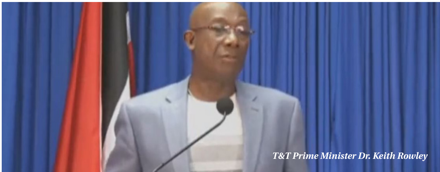
T&T Prime Minister Dr. Keith Rowley

LoopTT - If the country receives Pfizer vaccines from the United States in August, they will be used to vaccinate secondary school students. Prime Minister Dr. Keith Rowley made the comment while speaking at a media conference at the Diplomatic Centre, St Ann's, on Saturday afternoon.