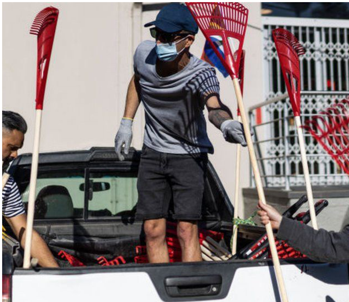
Volunteers have been organising clean-up operations in KwaZulu-Natal and Gauteng provinces.

The violence was sparked by the jailing of ex-President Jacob Zuma. He handed himself in to police on 7 July to serve a 15-month sentence for contempt of court. The 79-year-old was found guilty for failing to appear before an inquiry to answer questions about corruption during his presidency. On Monday, Mr. Zuma is due to attend - via video link - another corruption trial in relation to a $5bn (£3bn) arms deal from the 1990s. He has pleaded not guilty to the charges and his lawyers are now calling for a postponement because of the violence. Nelson Mandela, South Africa's first democratically elected president, died at the age of 95 in 2013 when Zuma was president. Each year on what would be Mandela's birthday - 18 July - people are urged to spend