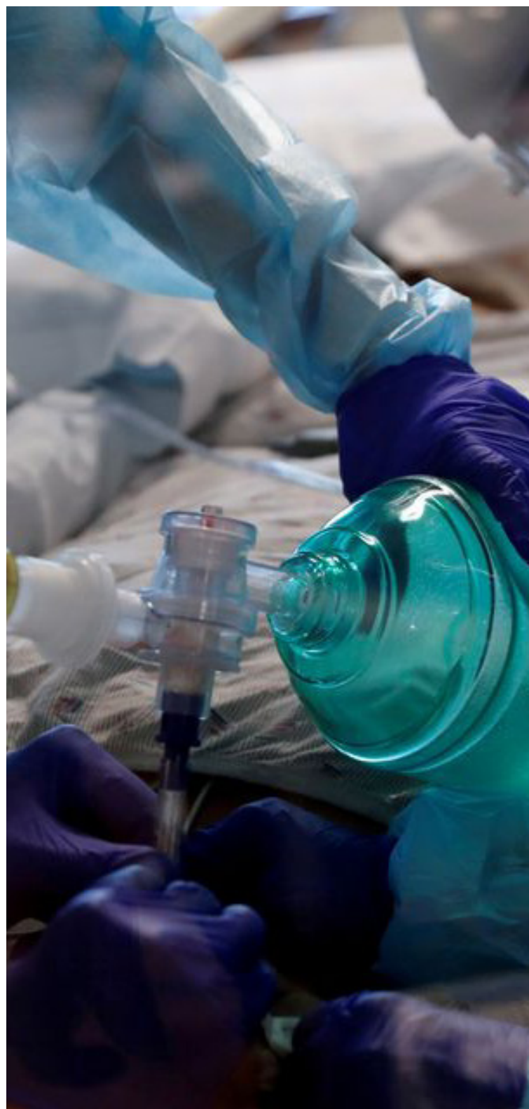
Critical care workers insert an endotracheal tube into a COVID-19 patient in the intensive care unit (ICU) at Sarasota Memorial Hospital in Sarasota, Florida, February 11, 2021.