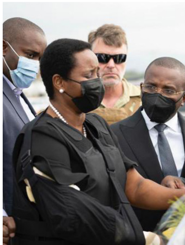
In this handout photo released by Haiti's Secretary of State for Communication, Haiti's first lady Martine Moïse, wearing a bullet proof vest and her right arm in a sling, arrives at the Toussaint Louverture International Airport, in Port-au-Prince, Haiti, Saturday, July 17, 2021.

suspects directly linked to the killing have been arrested, the majority of them former Colombian soldiers. At least three suspects were killed and police say they are looking for numerous others. Colombian officials have said that the majority of former soldiers were duped and did not know of the assassination plot.