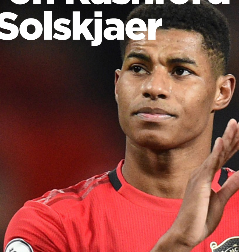
Manchester United forward Marcus Rashford.

We still need to address it with the experts."