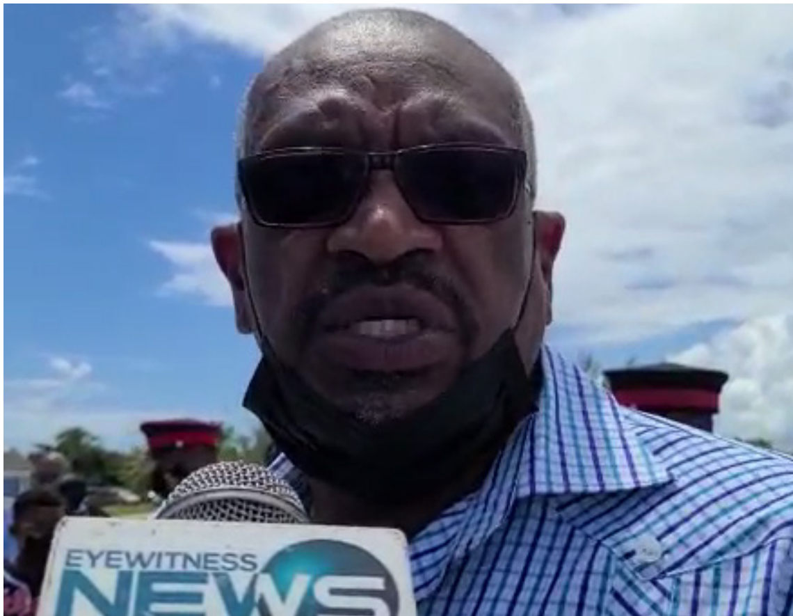
Prime Minister Dr. Hubert Minnis speaks with Eyewitness News on Friday, July 16, 2021, during a tour on Eleuthera.

EW News - Prime Minister Dr. Hubert Minnis yesterday assured that once vaccination numbers “reach a certain level”, the state of emergency could be allowed to end. Asked whether the government intends to move forward with ending the COVID-19 emergency orders when the current state of emergency ends on August 13, the prime minister said he does not see the “need” for it once enough Bahamians are vaccinated.