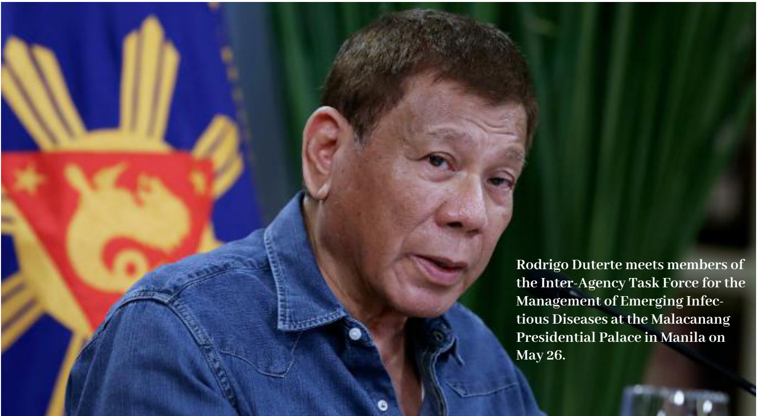
Rodrigo Duterte meets members of the Inter-Agency Task Force for the Management of Emerging Infectious Diseases at the Malacanang Presidential Palace in Manila on May 26.