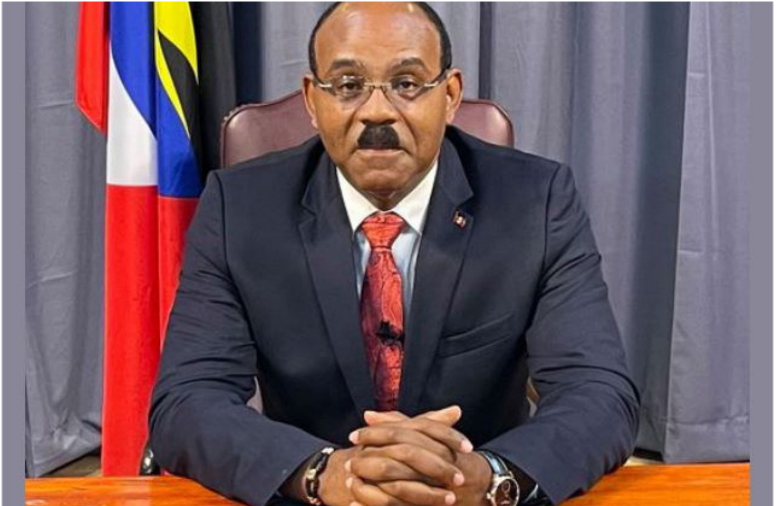
Prime Minister Gaston Browne.

A motion to extend the State of Emergency (SOE) under which the government has introduced several measures designed to curtail the spread of the coronavirus among the population, has been approved by the House of Representatives.