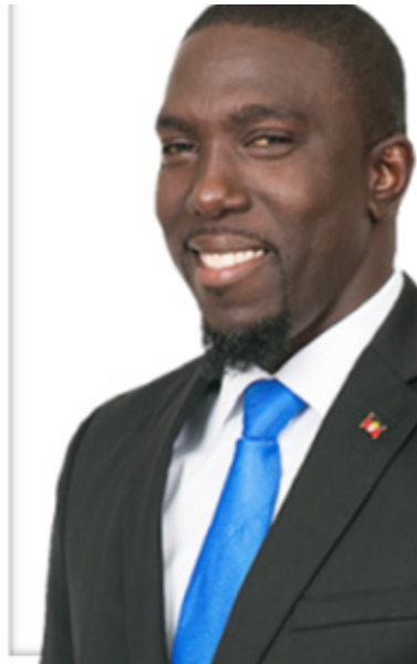
Prime Minister Gaston Brown (left) and Opposition Leader Jamale Pringle.

Prime Minister Gaston Browne says protecting the nation's borders remains one of the serious challenges that his government has to contend with because of limited resources.