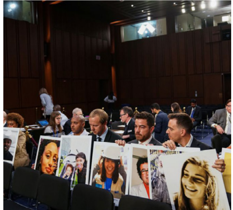
Family members in Washington, U.S., October 29, 2019, hold photographs of Boeing 737 MAX crash victims lost in two deadly 737 MAX crashes that killed 346 people.

The DOJ settlement includes a fine of $243.6 million and compensation to airlines of $1.77 billion over fraud conspiracy charges related to the plane's flawed design. The Justice Department said in January, "Boeing's employ-