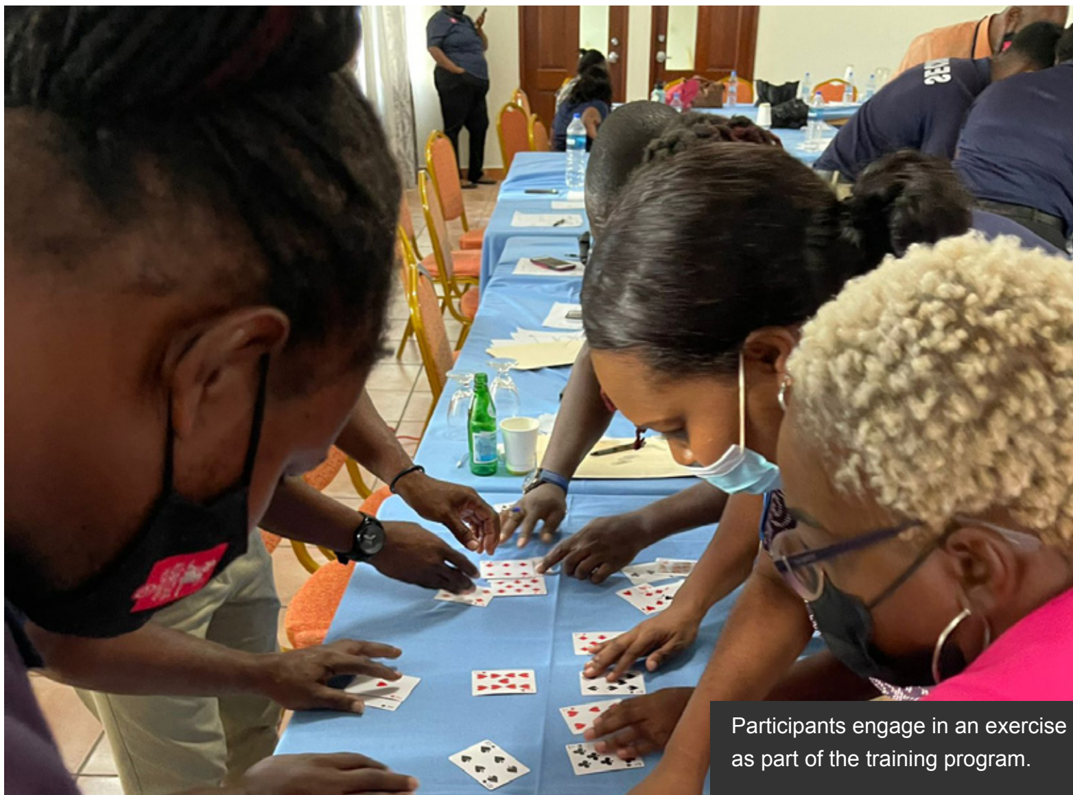
Participants engage in an exercise as part of the training program.