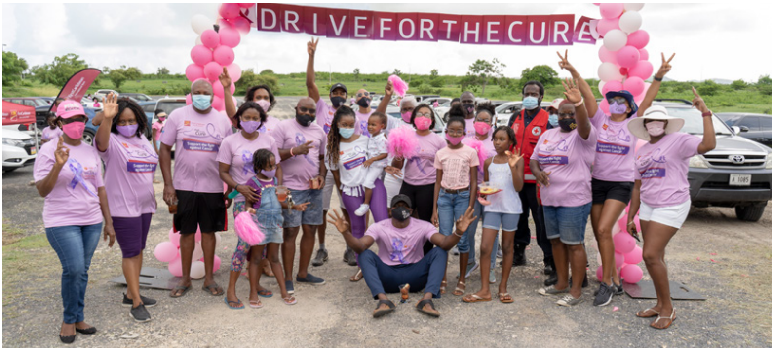
Flashback to last year's Drive for the Cure.

The region's largest cancer fundraiser, CIBC FirstCaribbean's Walk for the Cure, celebrates 10 years this year and is giving the bank's businesses across the region three ways to mark the milestone – the traditional walk with friends and family, a drive for the cure, or a virtual event.