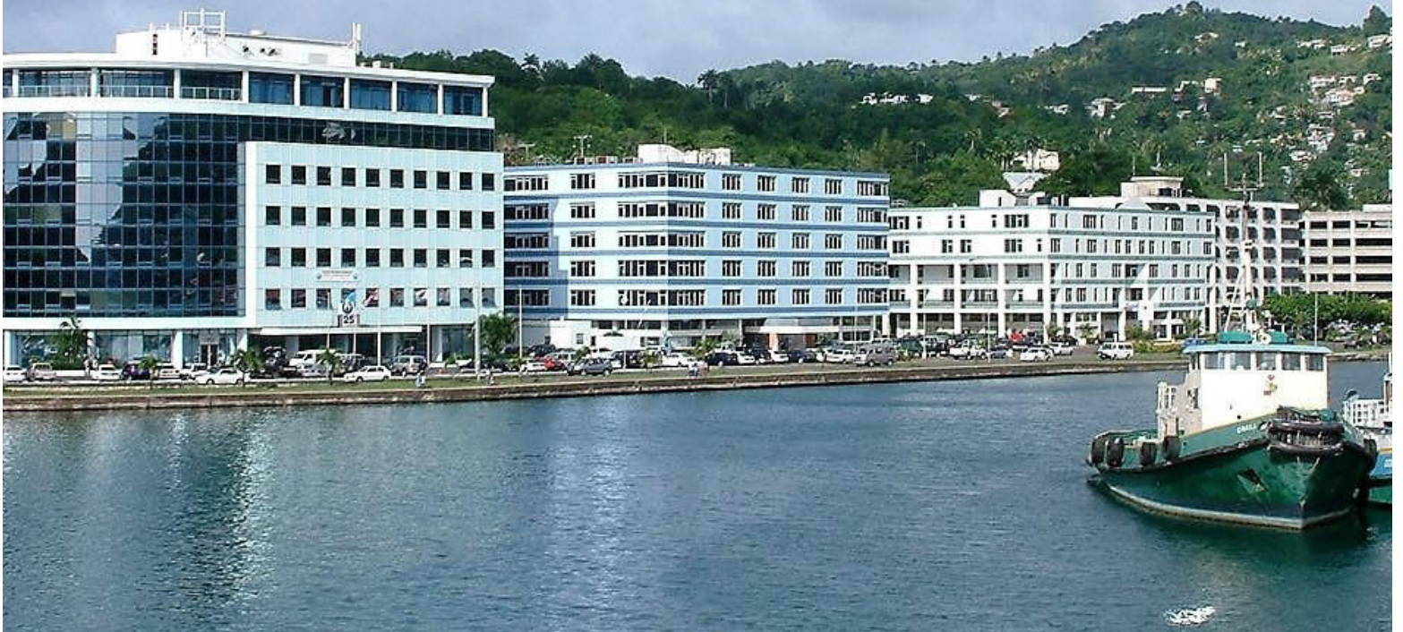
View of Government Buildings from across the Castries Harbour

Loopslu - Public sector employees will learn coping mechanisms for dealing with COVID-19-associated anxiety and depression.