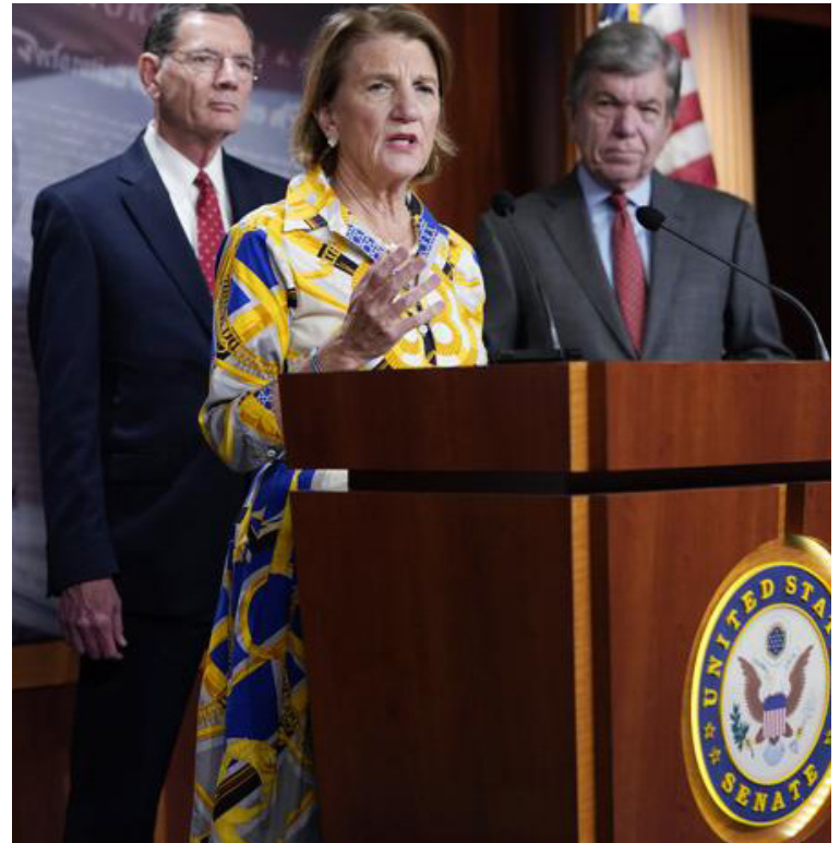
Republican senators announce their counter-offer to the Biden Infrastructure plan

With about $250 billion in new spending, the GOP plan falls short of the more ambitious proposal outlined in the president's American Jobs Plan. In earlier negotiations, Biden reduced his $2.3 trillion opening bid to $1.7 trillion. Biden, in an economic address later Thursday in Cleveland, planned to present "head-on" the choice before Congress and the country, according to a White House official, and will frame the argument as whether Americans want to keep giving breaks to corporations or invest in modernizing infrastructure. The official was not authorized to