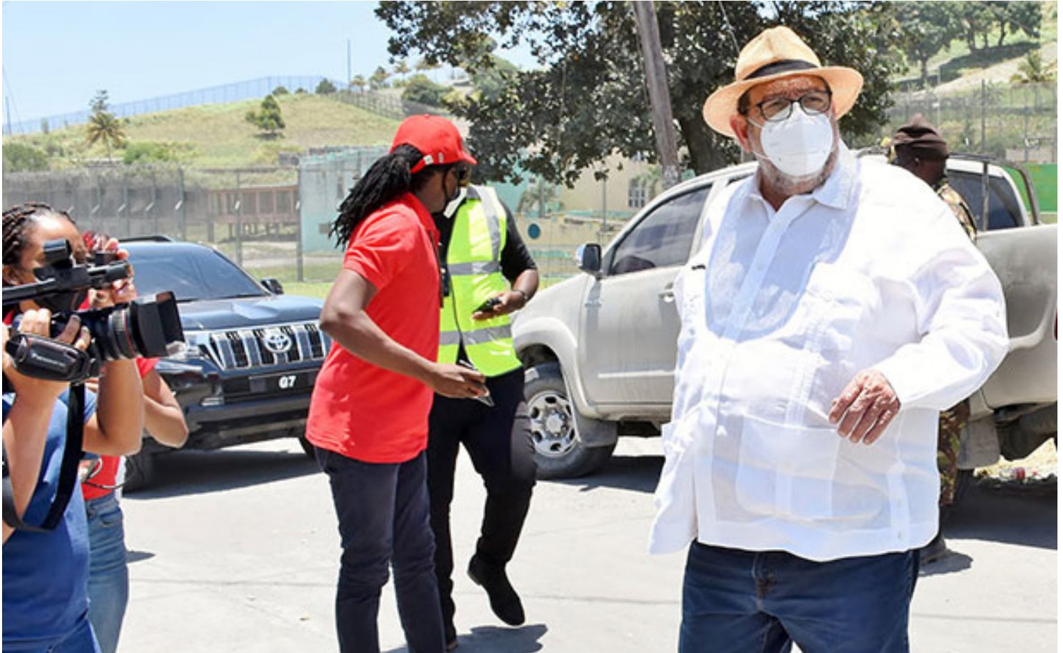
SVG PM Dr. Ralph Gonsalves speaking with reporters on prison release

Kingstown, St. Vincent, iWitnessNews - Between 40 and 50 prisoners could be released this week following a meeting of the Committee of Mercy.