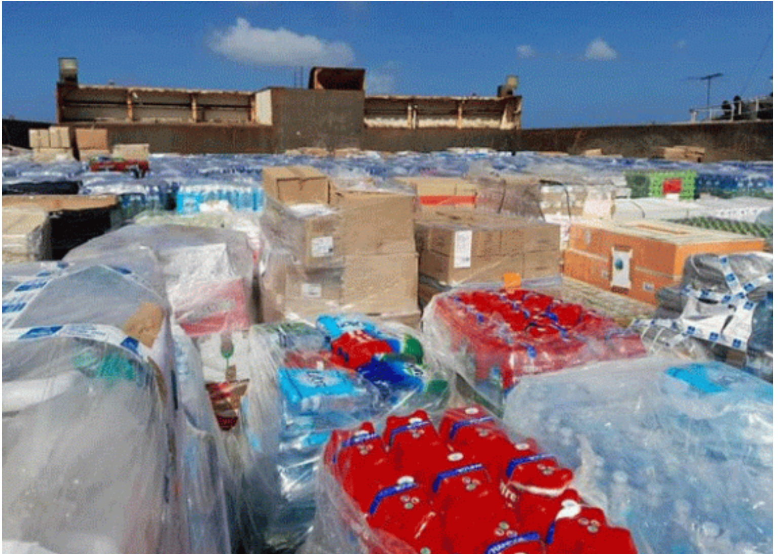
Bottled water were some of the items shipped from some of the islands