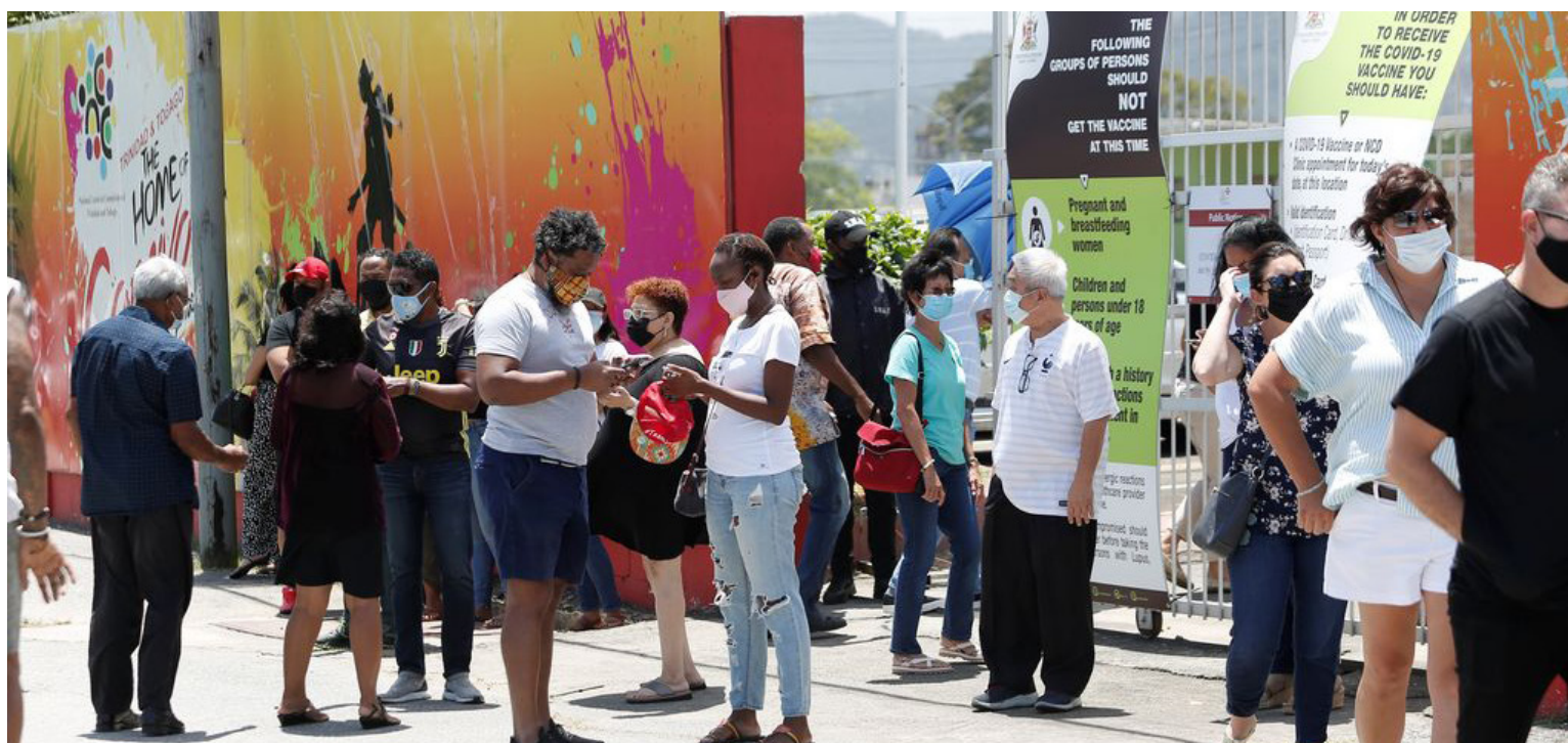
People join queue to be vaccinated in T&T