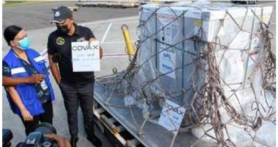
A shipment of AstraZeneca vaccine arrives in Jamaica

Jamaica Observer - MINISTER of Health and Wellness Dr. Christopher Tufton says the Government has been in communication with the United States and is hoping that Jamaica will be one of the beneficiaries of the 60 million doses of AstraZeneca vaccines to be distributed by the US soon.