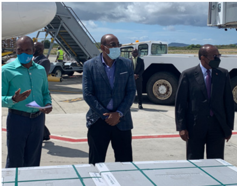
Prime Minister Gaston Browne