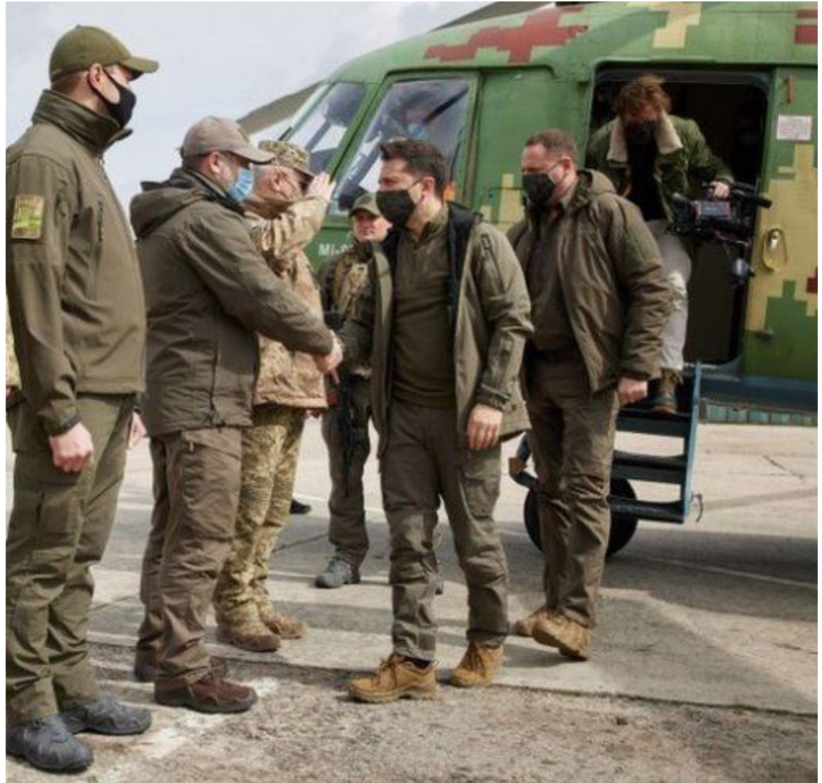
Ukraine's President Zelensky has been visiting troops in this region

German Chancellor Angela Merkel has called