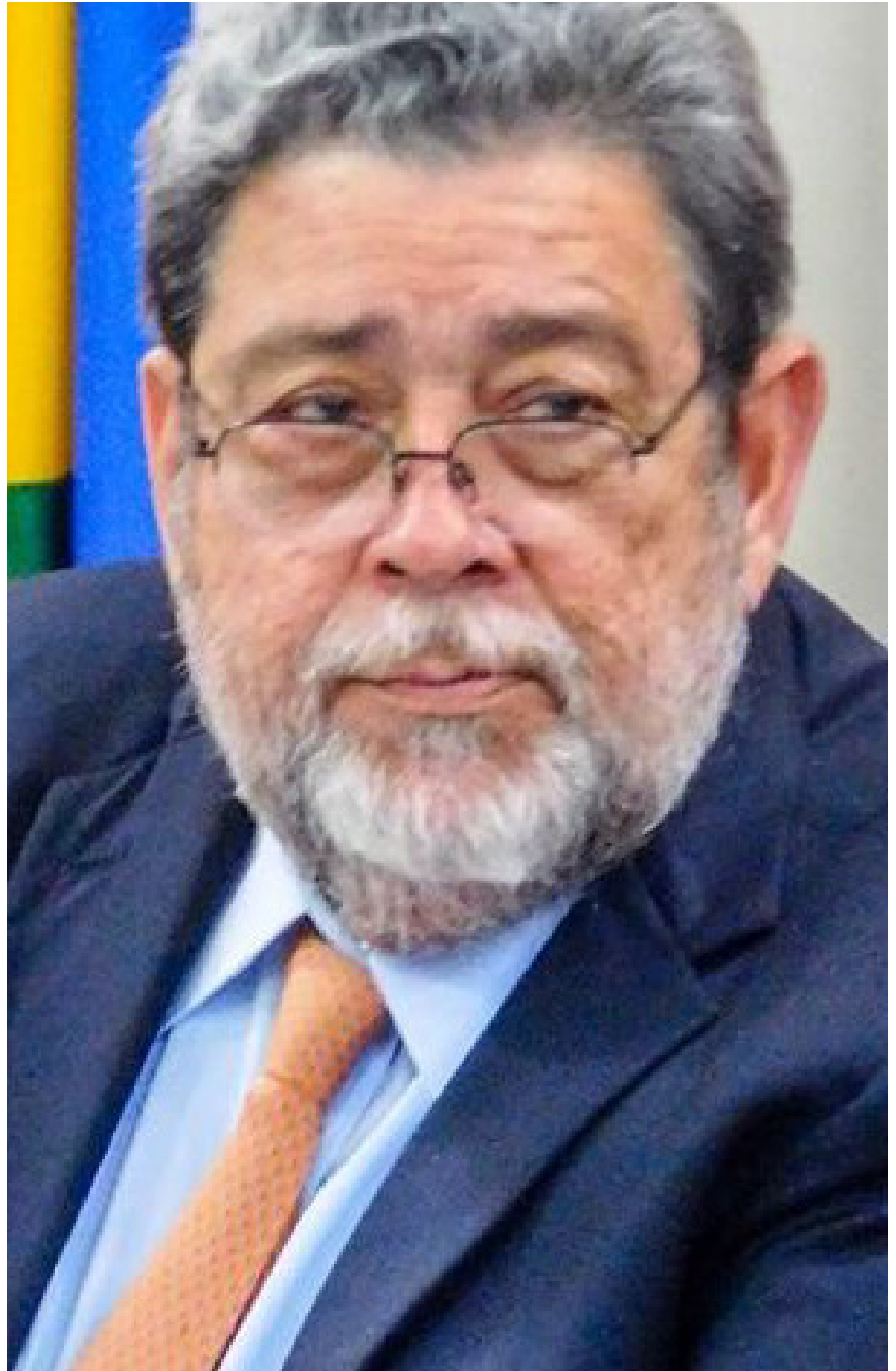
Prime Minister Ralph Gonsalves,

The World Bank indicates that St. Vincent's economy is expected to grow by 0.2 percent in 2021.