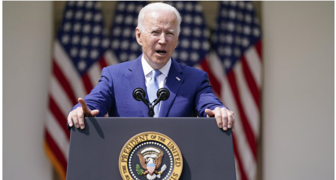
President Joe Biden speaks about gun violence prevention in the Rose Garden at the White House

Biden’s Thursday announcement delivers on a pledge the President made last month to take what he termed imme-