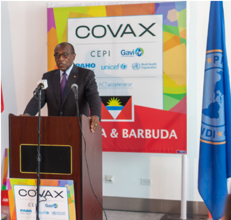
Health Minister, Sir Molwyn Joseph

Health Minister, Sir Molwyn Joseph, is issuing a clarion call for all residents of Antigua and Barbuda to make themselves available to be vaccinated as the country's future may depend upon it.