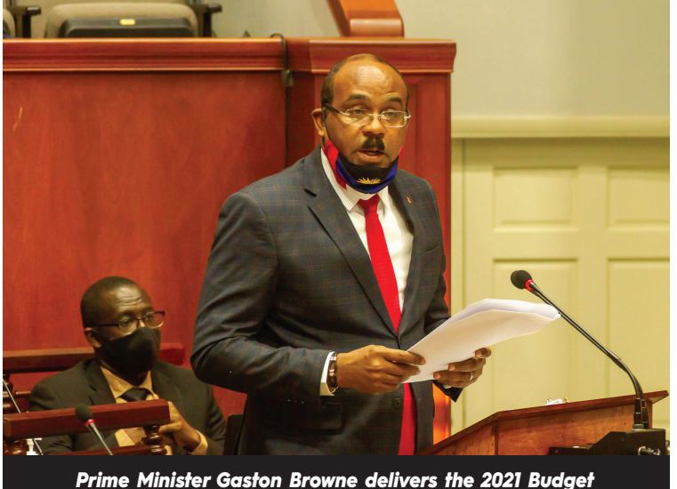
Prime Minister Gaston Browne delivers the 2021 Budg

Prime Minister Gaston Browne delivered an optimistic overview of the nation's economy when he delivered the 2021 National Budget in the House of Representatives on Thursday under the theme 'Maintaining a Healthy Nation and Restoring a Vibrant Economy.'