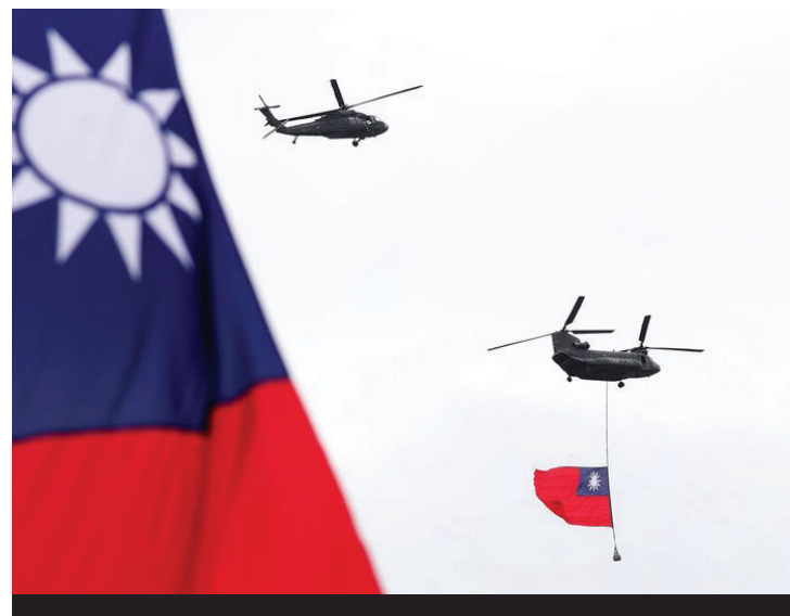
China believes that Taiwan's democratically-elected government is moving the island towards a declaration of formal independence

Asked at a monthly news briefing about the air forces' recent activities, Chinese Defence Ministry spokesman Wu Qian said Taiwan was an inseparable part of China.