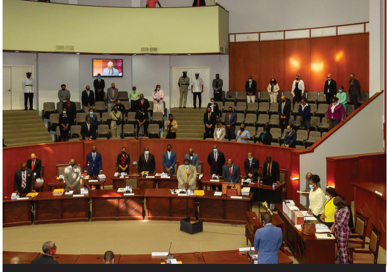
Members of Parliament and citizens gather for the 2021 Budget presentation

"The nation was on track to achieve the fiscal targets set out in the Budget. How-