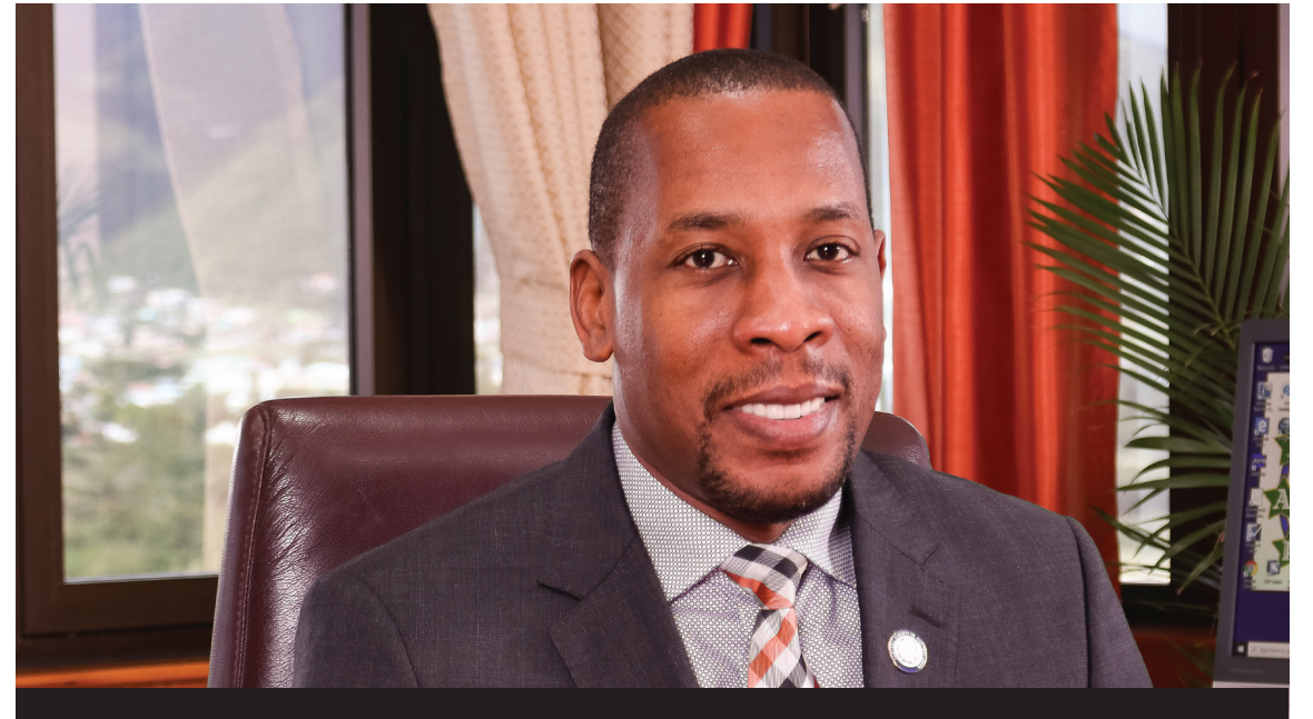
Governor of the Eastern Caribbean Central Bank Timothy N. J. Antoine

(OECS Press Room): The Monetary Council has approved the reappointment of Timothy N. J. Antoine as Governor of the Eastern Caribbean Central Bank.