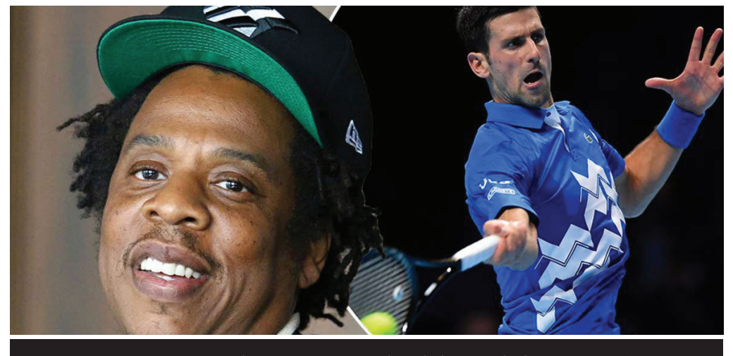
Rap mogul Jay-Z and tennis superstar Novak Djokovic invested in fitness startup CLMBR

Rap mogul, Jay-Z, and tennis superstar, Novak Djokovic, have reportedly invested in a new fitness start-up.