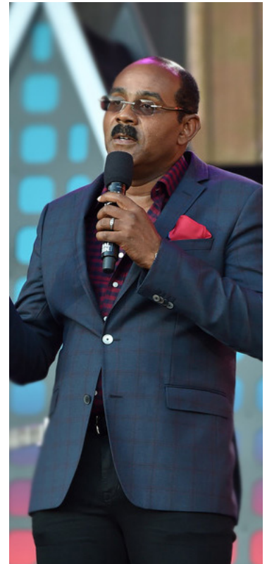
Prime Minister Gaston Browne international brand and in response he withdrew from the project,” Browne accused.

“Packer said the problems with the Barbuda Council were damaging his