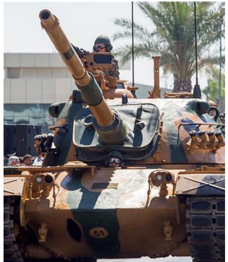
As tensions run high, the Turkish military began exercises called 'Mediterranean Storm' with the Turkish Cypriot Security Command

Greece responded with naval exercises to defend its maritime territory, which were later bolstered by the deployment of