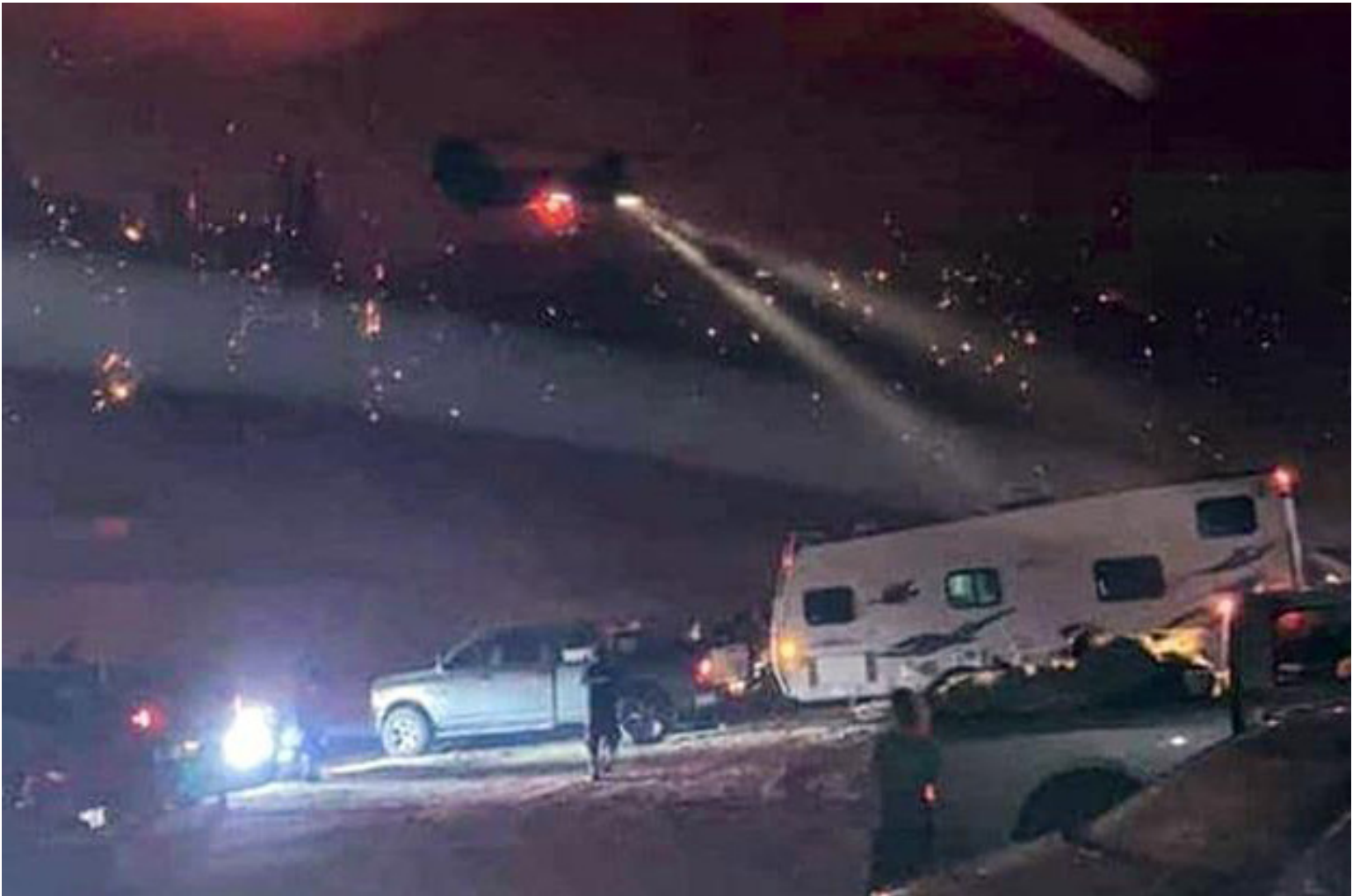
The Creek Fire sparked on Friday and quickly spread throughout Saturday, trapping campers near the city of Fresno.

More than 200 people have been airlifted to safety after being trapped by a fast-moving wildfire near a popular recreation area in northern California, officials said on Sunday.