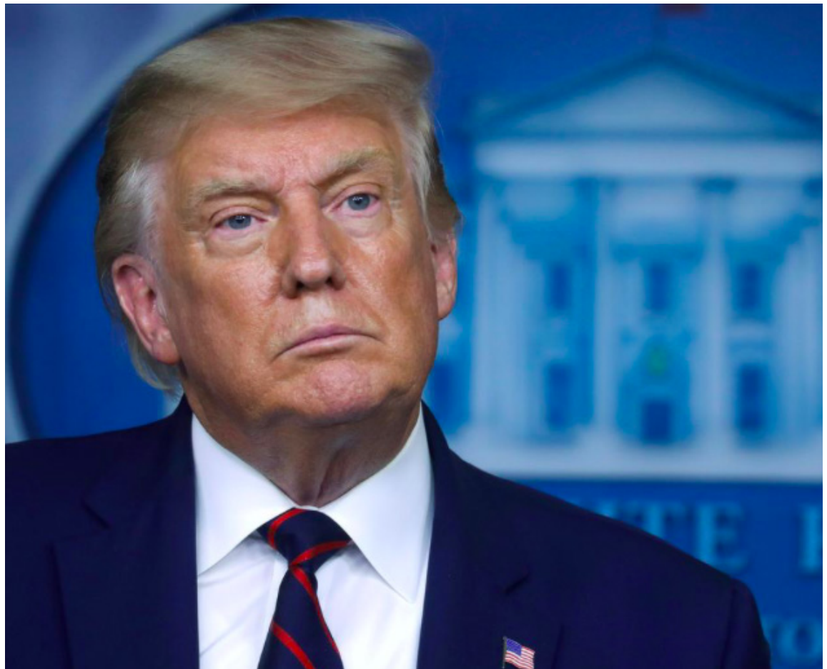
U.S. President Donald Trump listens to a question as he answers reporters questions during a news conference at the White House in Washington, U.S., September 4, 2020.

Trump made the disparaging remarks after canceling a visit to an American cemetery during a November 2018 trip to France, an account the president denied on Thursday and on Sunday said was "disinformation."