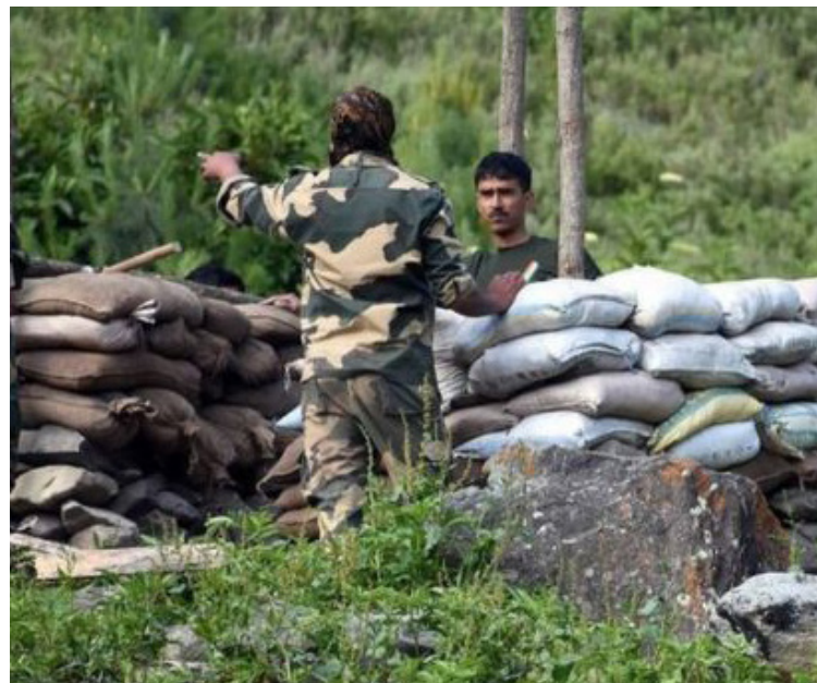
India and China have been locked in a border dispute for decades

The two countries have fought only one war so far, in 1962, when India suffered a