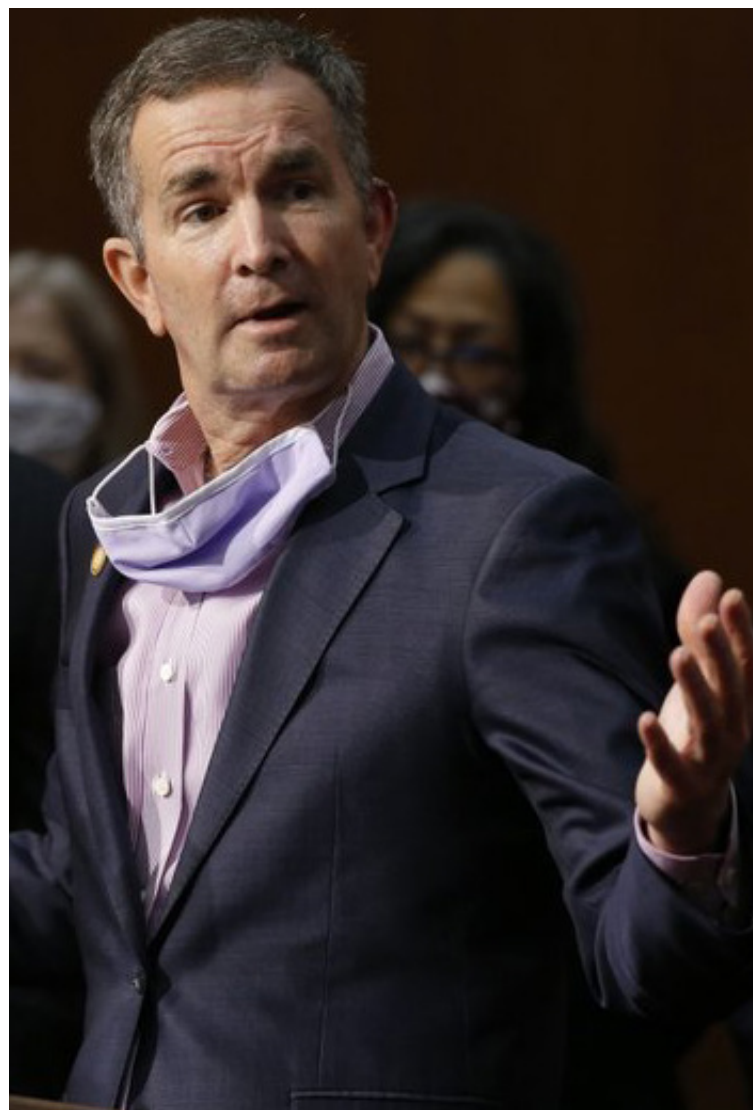
Virginia Gov. Ralph Northam speaks during a news conference in Richmond, Va. Northam announced Tuesday, June 16, 2020 that he's making Juneteenth — a day that commemorates the end of slavery in the U.S. — an official holiday in a state that was once home to the capital of the Confederacy.

"Here's our day, and if you love us, it'll be your day too,"