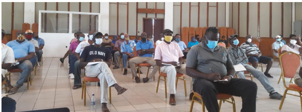
In May, some 280 taxi operators in Antigua who operate at the airport and hotels were trained ahead of the reopening of the airport.

The delegation visiting Barbuda today comprises of representatives from