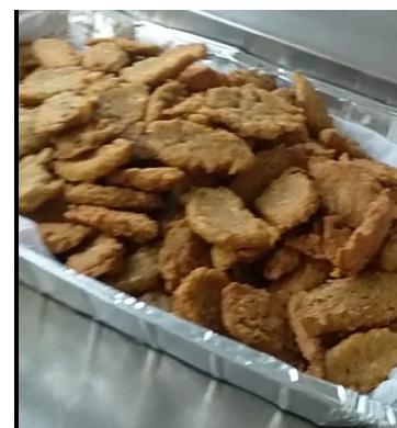
Samples of the food being served at HM Prison